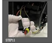
STEP11 Pluck off the pair of plugs in the image above.