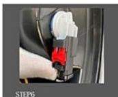
STEP6 The pair of plugs on the harness plugs into the light holder.