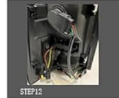
STEP12 Installation completed.