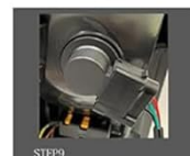
STEP9 Screw the lamp holder onto the lamp body.