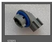
STEP3 Lamp holder removed.