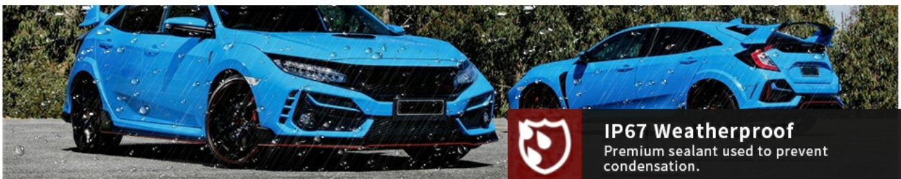
Image: Explanation of moisture ingress in lights.

✓ If you're trying to combat condensation in a place without a lot of sunlight or natural heat to help, the next best solution is to keep the vehicle away from water. This includes when it rains or even taking it through a car wash. Let the headlights/ taillights dry out on their own time.