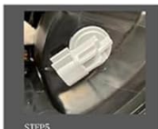
STEP5 Screw the lamp holder onto the lamp body.