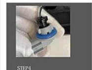
STEP4 Plug the lamp holder into the T10 plug from the lamp.