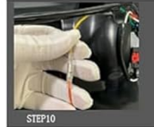
STEP10 Plug in the single pin insert, put on the protective sleeve.