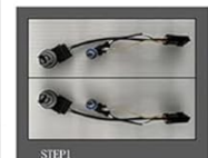
STEP1 Take out the transfer wires from the packing box.