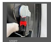
STEP7 Push on the red carabiner.