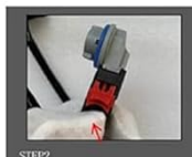
STEP2 Remove the lamp holder by pressing the position indicated by the arrow.