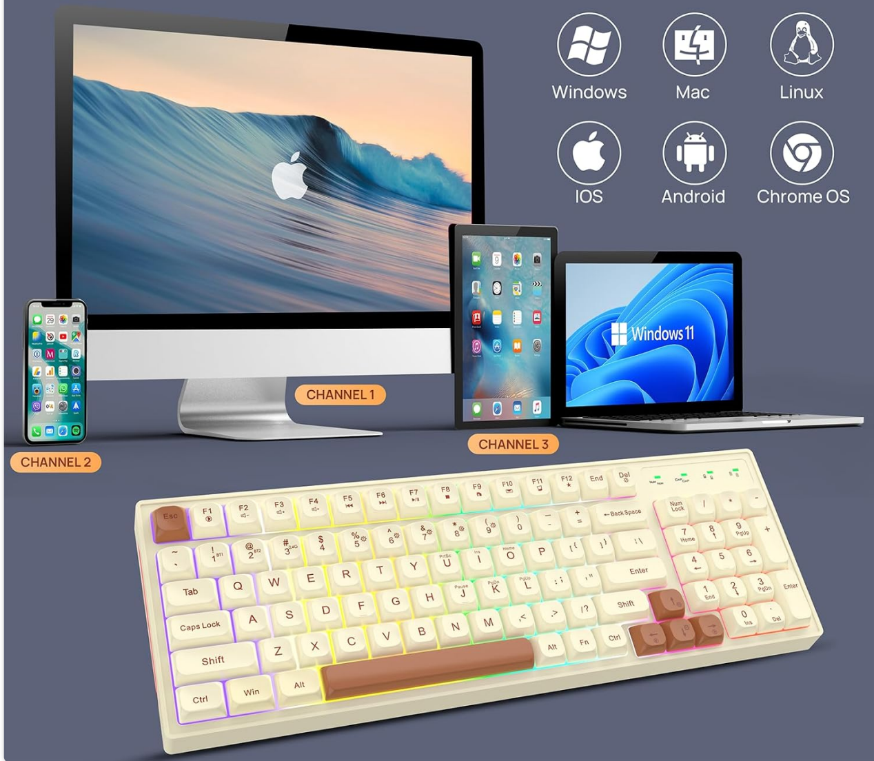
Image: The keyboard demonstrating its multi-device compatibility with various operating systems including Windows, Mac, Linux, iOS, Android, and Chrome OS.