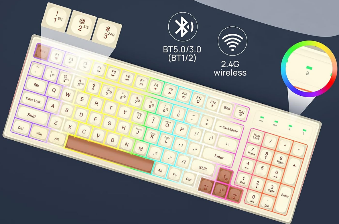
Image: Illustration of the keyboard's dual connection modes (Bluetooth and 2.4G Wireless) and the multifunctional knob for switching between devices.

Switch Bluetooth/Wireless/Description; LONG PRESS; FN+1/2/3