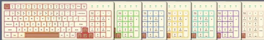
Image: A visual guide to the 12 distinct RGB backlight effects, demonstrating the variety of lighting options for the keyboard.