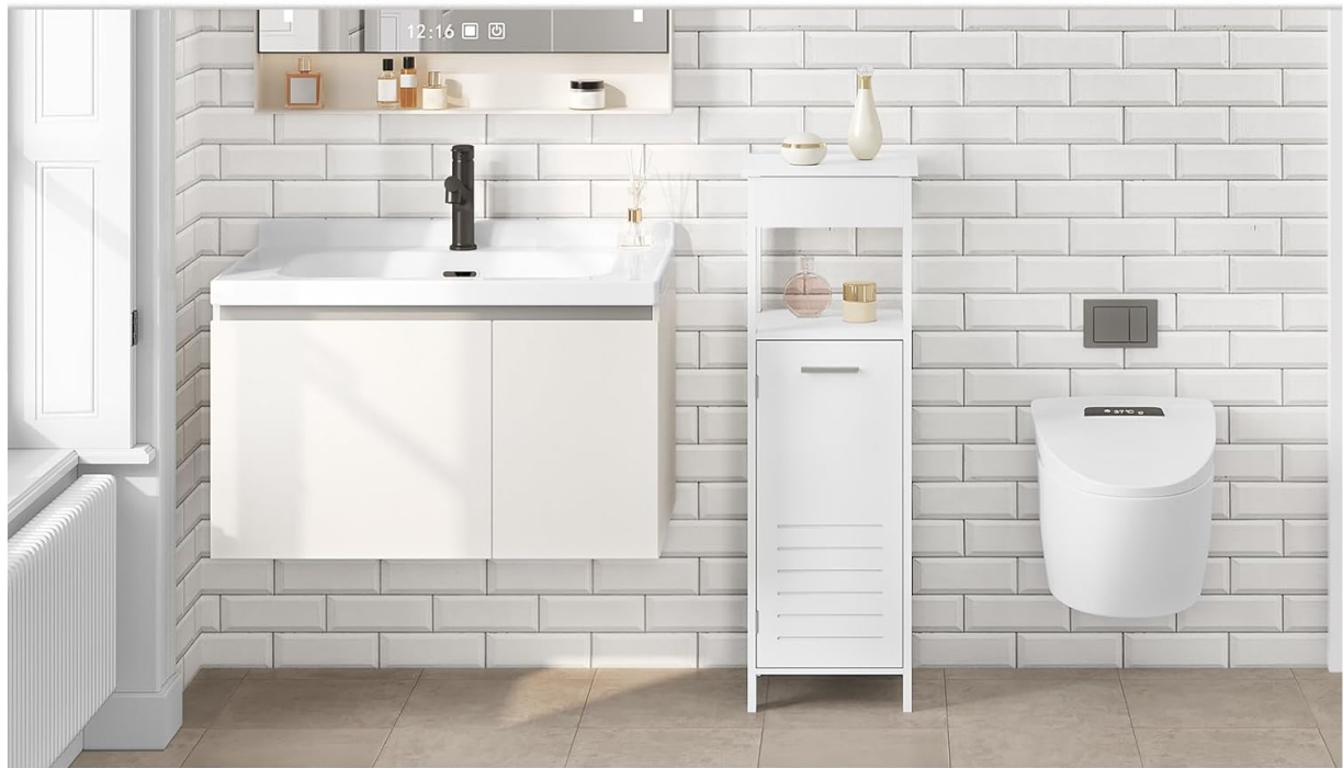
Image: Demonstrates storage capacity and adjustable shelf.