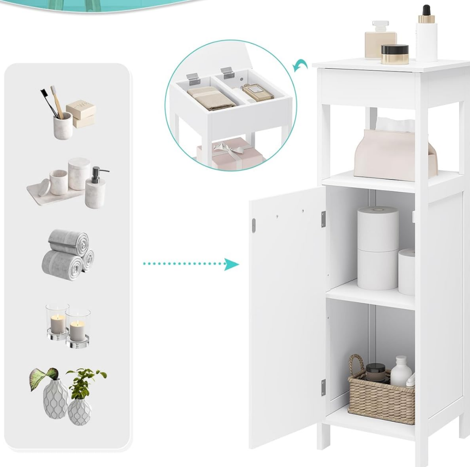
Image: Key features including water-resistant surface, metal handle, magnetic door, and raised legs.