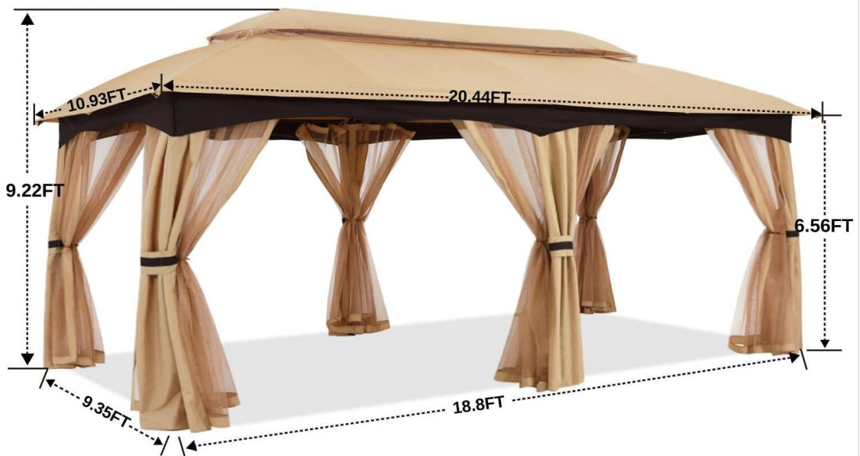
Figure 1: Product dimensions of the ABCCANOPY 10x20 Outdoor Gazebo. This diagram illustrates the overall length, width, and height of the assembled gazebo, including roof overhangs and peak height.