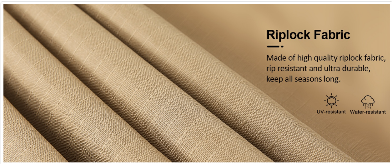
Figure 6: Rip-Lock Fabric. This image displays the texture of the high-quality rip-lock fabric, highlighting its rip-resistant and water-resistant properties.