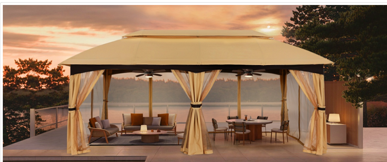
Figure 5: Shade Size Guide. This guide illustrates the capacity and recommended furniture arrangements for different gazebo sizes, including the 10x20 model.