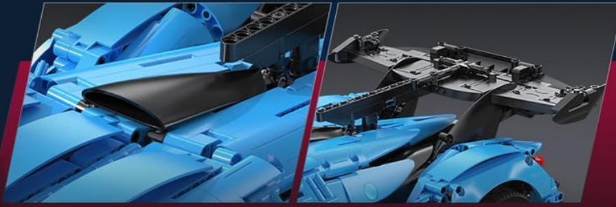
Upgrade the exterior parts of the top intake duct and tail wing