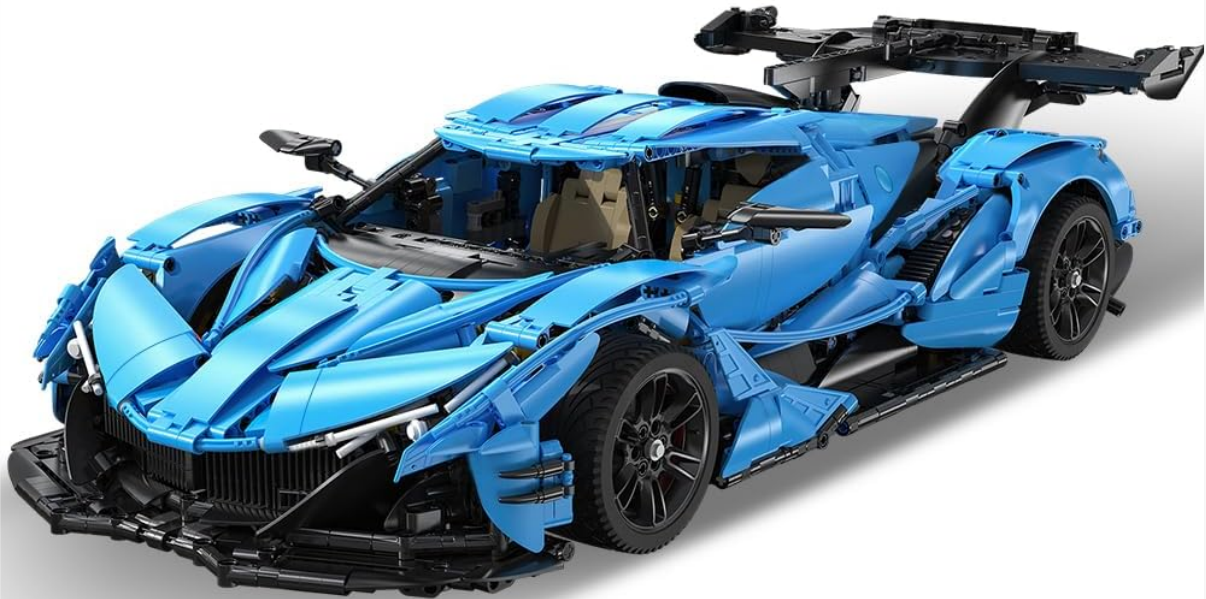
Image: The product packaging and the fully assembled CaDA Master Apollo IE C64003W model.