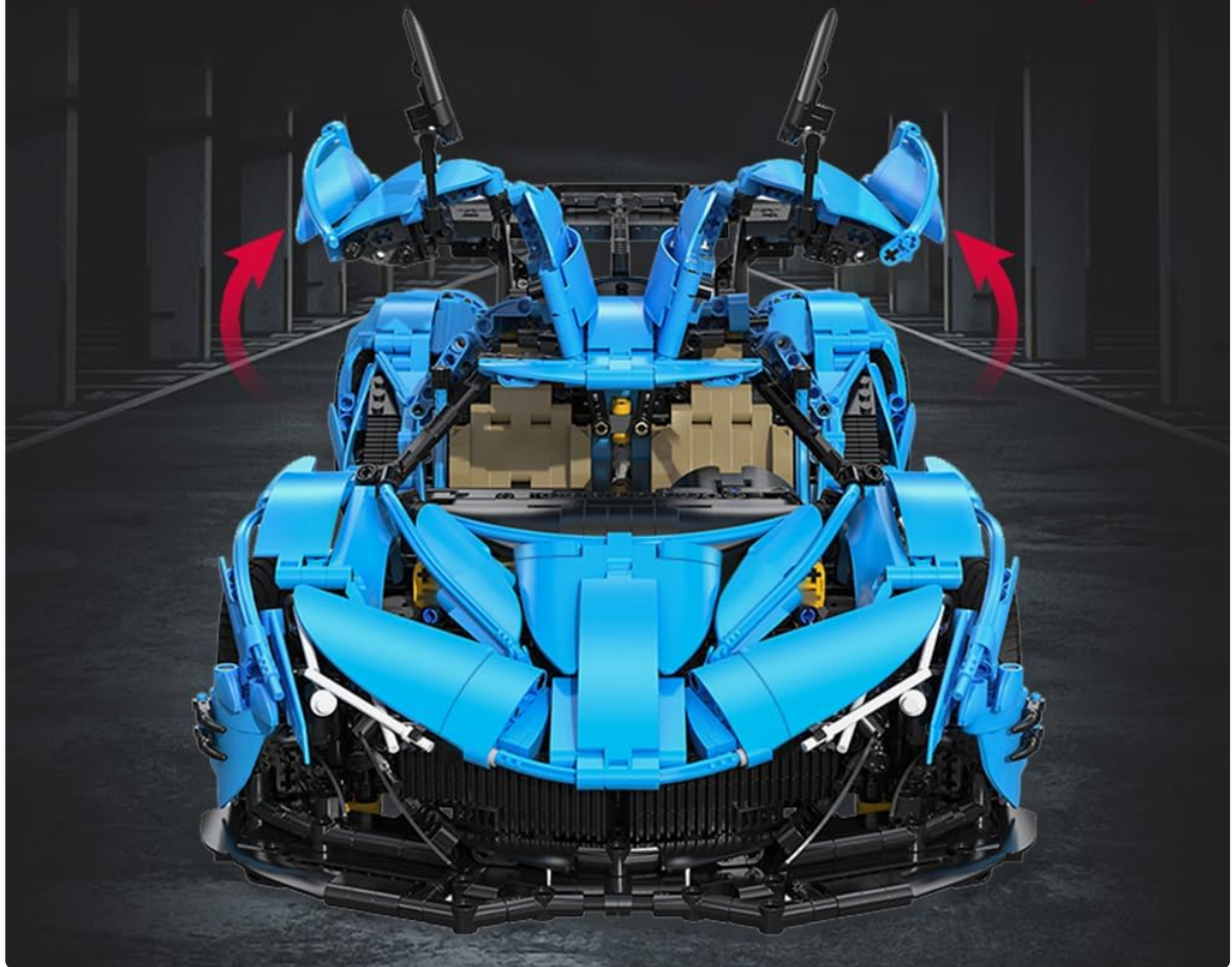
Image: The sports car doors can be vertically unfolded up to 90 degrees, showcasing the gull-wing door mechanism.

Can be vertically unfolded up to 90 degrees