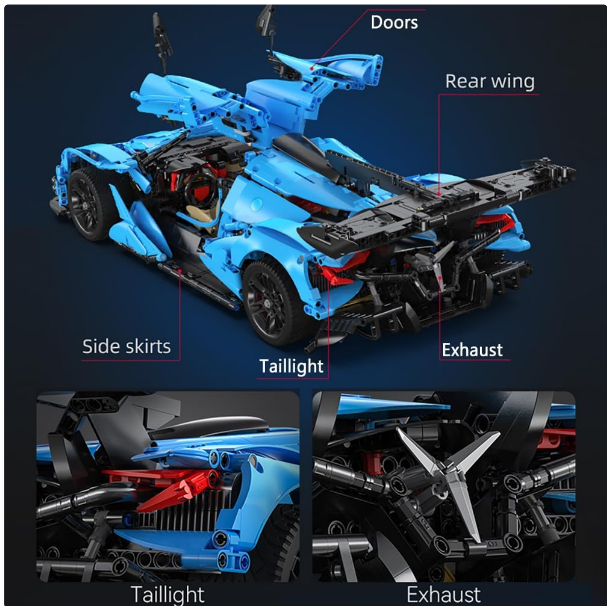
Image: Rear view of the model, detailing the doors, adjustable rear wing, side skirts, taillights, and exhaust system.