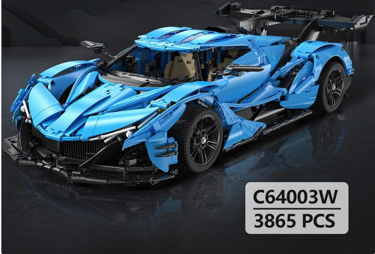
Image: The CaDA Master Apollo IE C64003W Super Car Building Kit, highlighting its 1:8 scale and 3865 pieces.