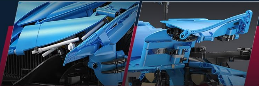
Optimize the assembly method of front headlights and doors

Image: Close-up views of upgraded exterior parts, including the top intake duct, tail wing, rearview mirror components, and optimized front headlight and door assembly methods.