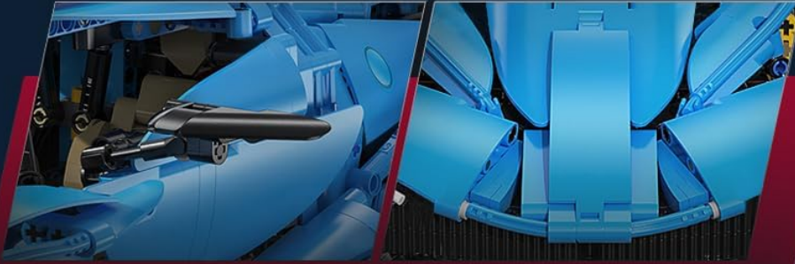
Upgrade rearview mirror components, front air inlet assembly method