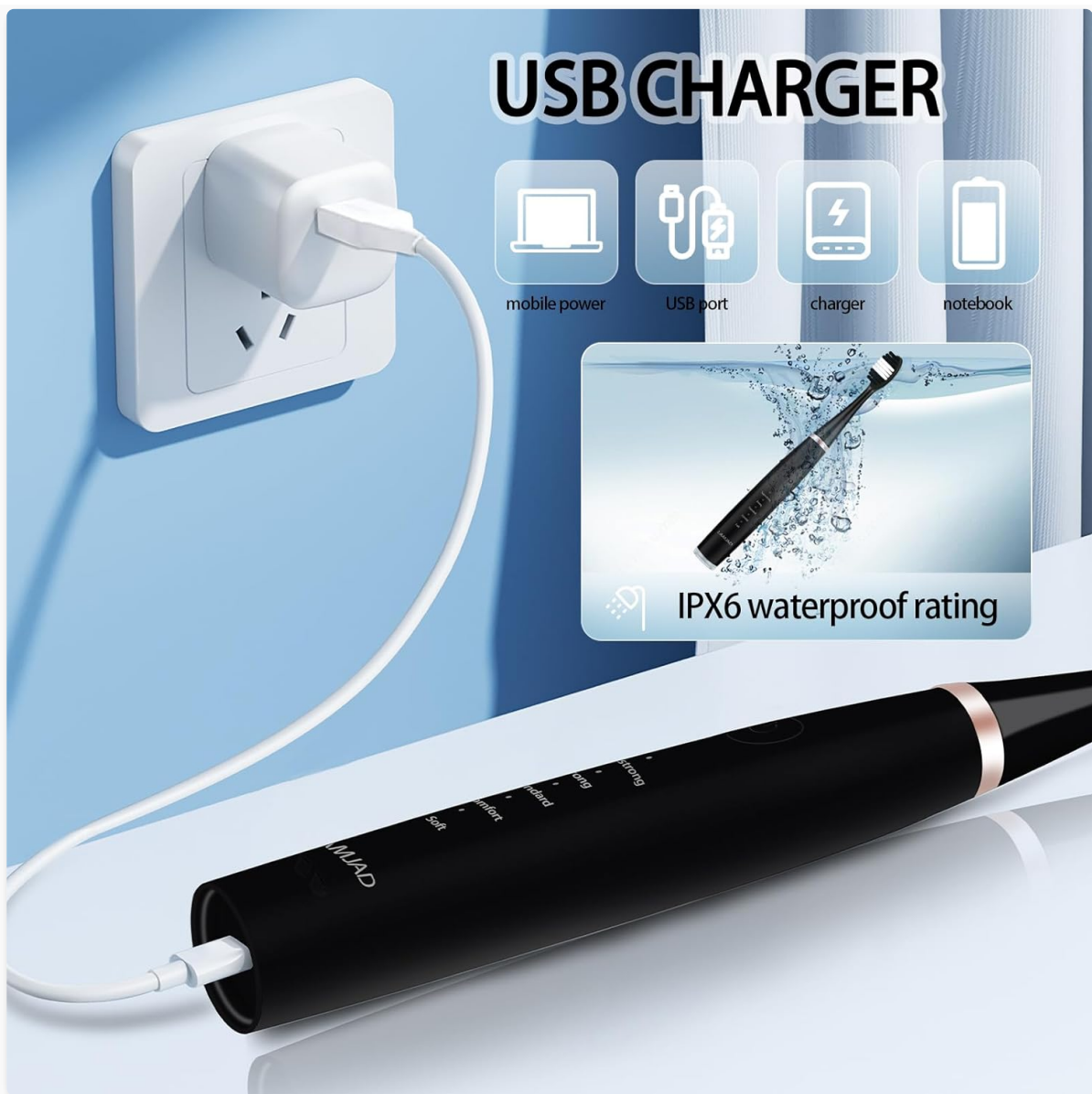
Image: The LAMJAD Electric Toothbrush connected to a USB charger, illustrating its USB charging capability and IPX6 waterproof design.