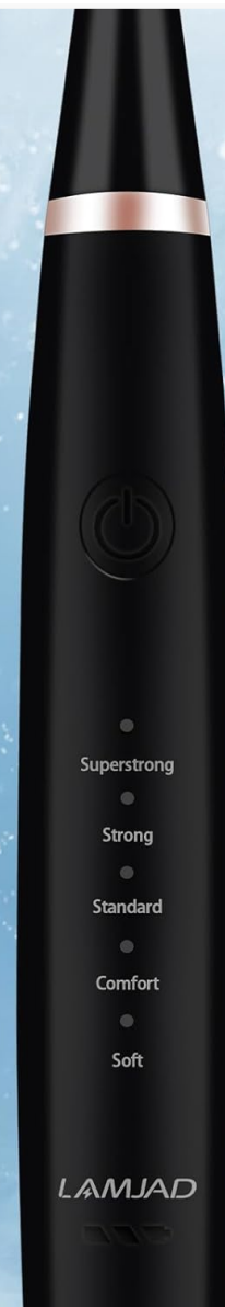
Image: A close-up of the LAMJAD Electric Toothbrush handle, highlighting the five distinct cleaning modes and their recommended uses.

(Hinweis: Beim Auswechseln der Zahnbürste ist das Vibrationsgeräusch laut, was normal ist. Es wird empfohlen, den Komfortmodus einzustellen, damit sich die Zähne anpassen können.)