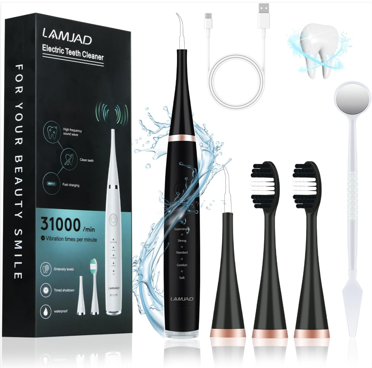
Image: Overview of the LAMJAD Electric Toothbrush and its included accessories, such as the main unit, multiple brush heads, and a USB charging cable.