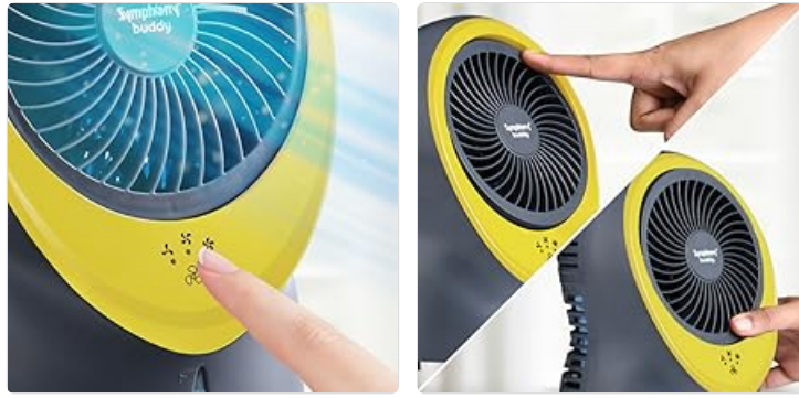
Images: Left: Detailed view of the touch control panel with indicators for Low, Medium, and High fan speeds. Right: A finger interacting with the touch control panel to change the fan speed.