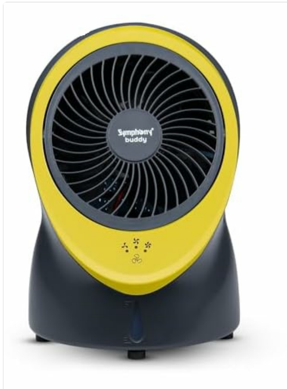
Image: The Symphony Buddy Mini Air Cooler, demonstrating its compact size suitable for a desk environment. Dimensions are shown as 23 cm height and 15 cm width.

The Symphony Buddy Mini is a compact and portable tabletop air cooler designed for personal use in various settings such as homes, offices, and small workspaces. It features a whisper-quiet operation, touch controls, and three-speed settings for customized cooling. This manual provides essential information for the safe and efficient use, setup, maintenance, and troubleshooting of your air cooler.