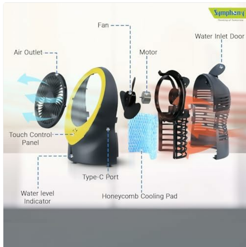
Image: An exploded diagram illustrating the internal and external components of the Symphony Buddy Mini air cooler, including the fan, motor, honeycomb cooling pad, water inlet door, air outlet, touch control panel, and Type-C port.