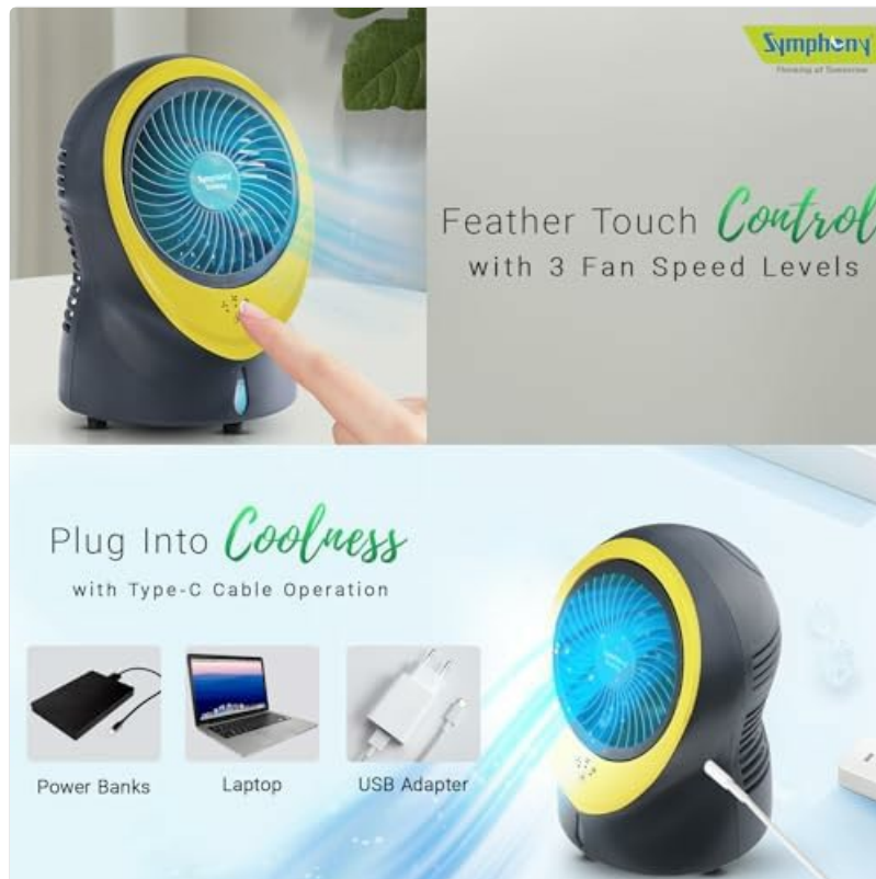
Image: The Symphony Buddy Mini Air Cooler powered by a Type-C USB cable, illustrating connectivity options with a power bank, laptop, and USB adapter.