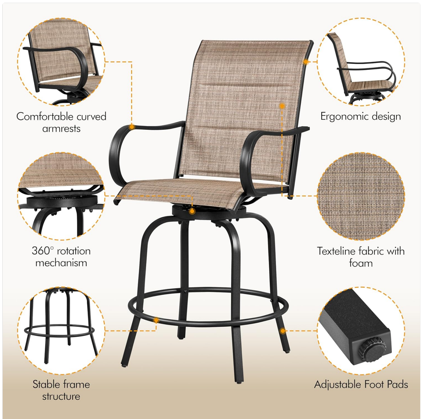
Figure 2: Key features of the bar stool, illustrating the swivel mechanism and adjustable foot pads.