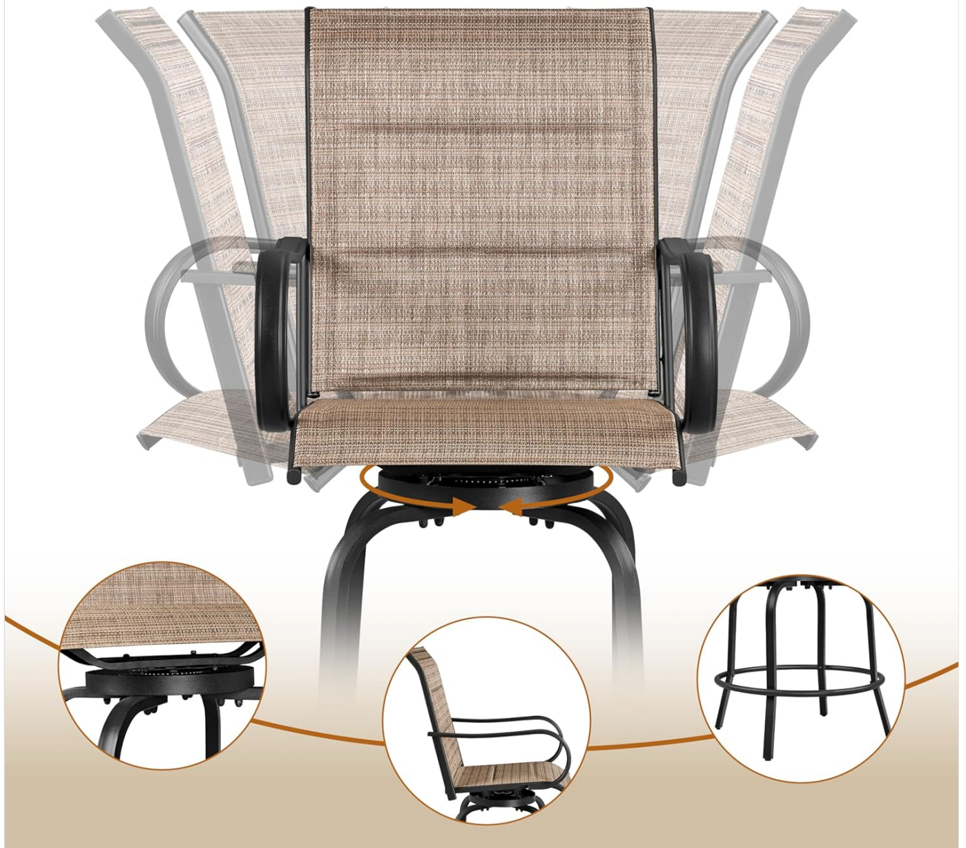
Figure 3: Demonstration of the smooth 360-degree swivel function.