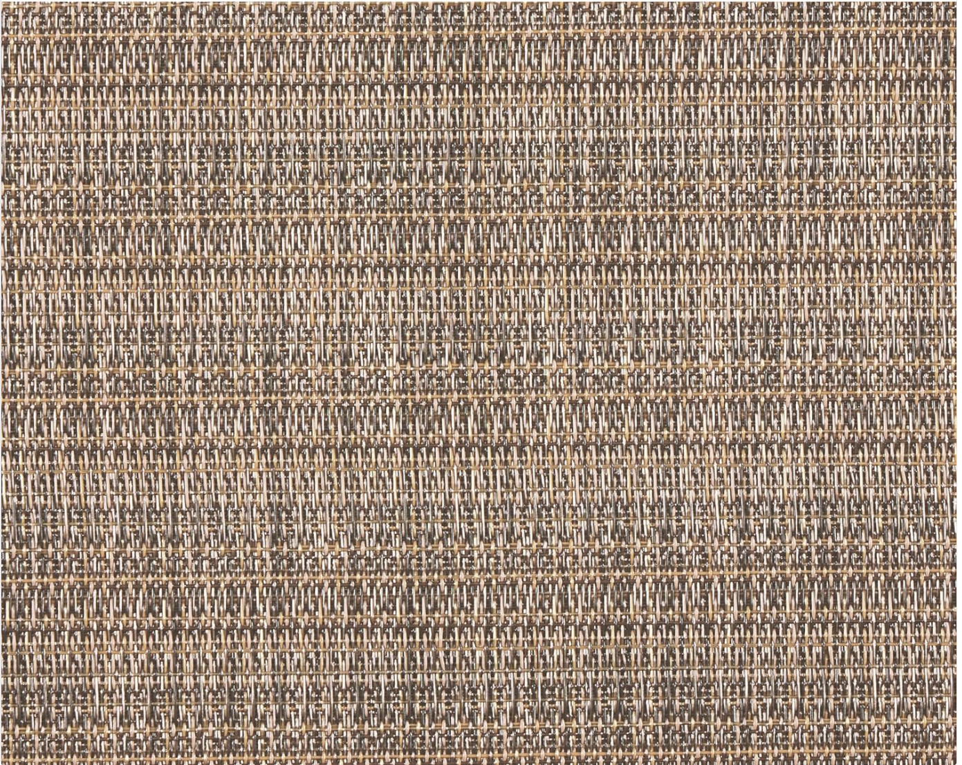
Figure 5: The textiline material is designed for durability and breathability.

Very breathable, durable, long service life