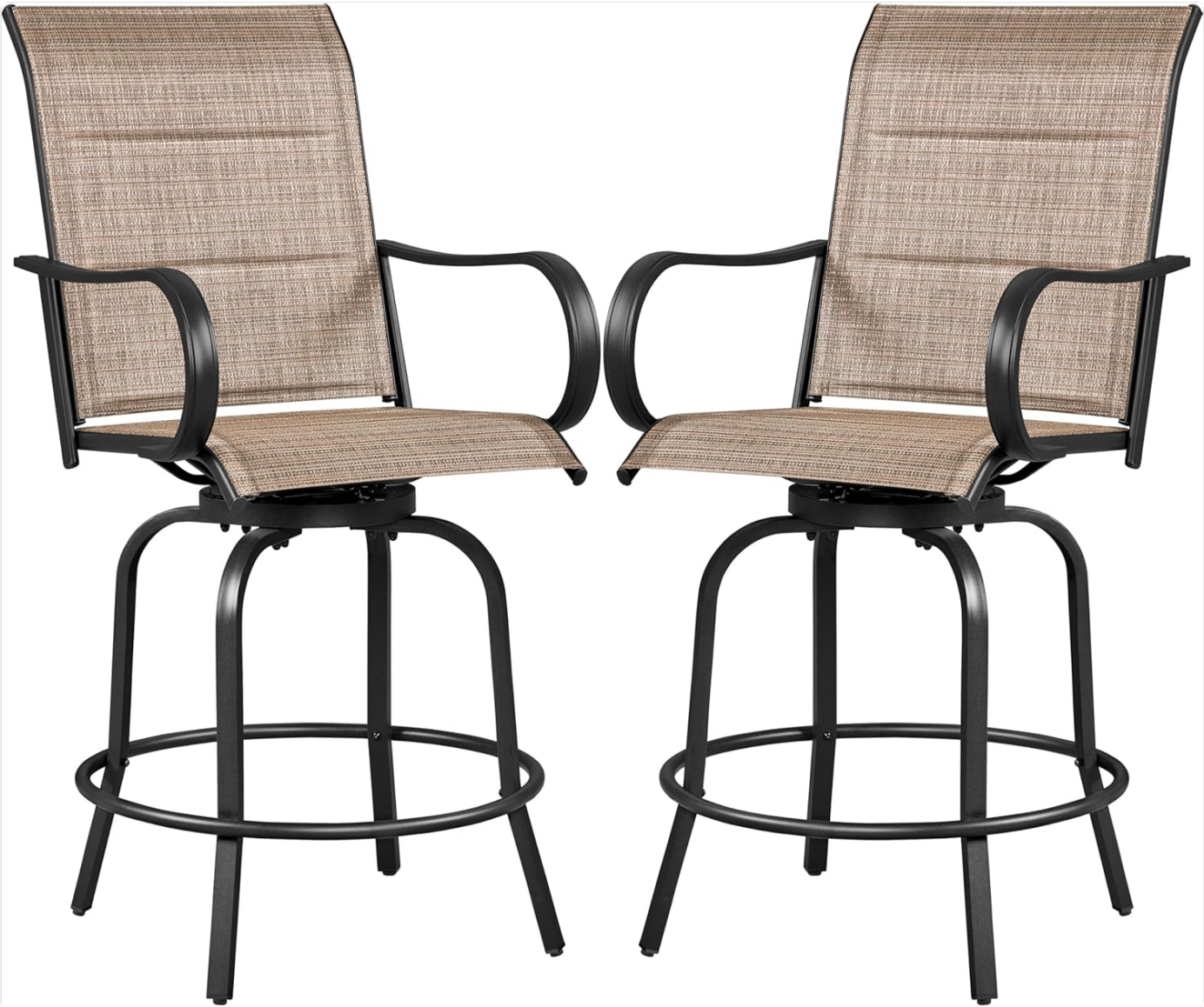
Figure 1: Fully assembled Yaheetech Patio Swivel Bar Stools.

Assembly is required for these bar stools. It is recommended to have two people for easier and quicker assembly. Follow the step-by-step instructions provided in the included assembly guide. Ensure all screws are tightened securely, but do not overtighten. For best results, partially tighten all screws first, then ensure the chair is level before fully tightening them in sequence.