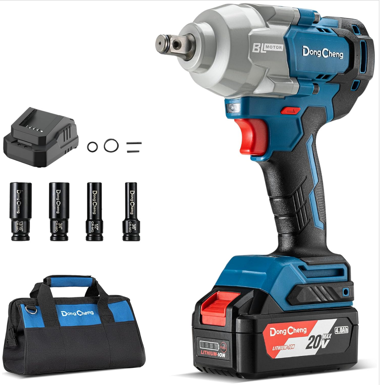
Figure 1: Dong Cheng 20V Brushless Impact Wrench and included accessories.