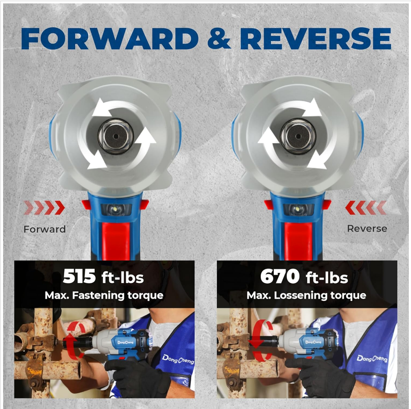
Figure 4: Forward and Reverse operation of the impact wrench.

The tool features a safety lock. To operate, push the red button (directional switch) to the left for forward (tightening) or to the right for reverse (loosening). When the switch is in the middle position, the tool is locked and will not operate.