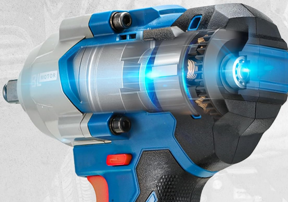
Figure 6: Benefits of the enhanced brushless motor.

Video 2: Overview of the Dong Cheng 20V Brushless Impact Wrench features and capabilities.