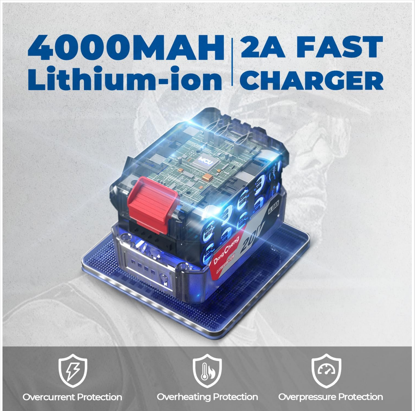
Figure 2: Battery and charger for the impact wrench.

Before first use, fully charge the 4.0Ah Lithium-Ion battery. Insert the battery into the provided fast charger. The charger's indicator light will show the charging status (red for charging, green for complete). Ensure the battery is securely seated.