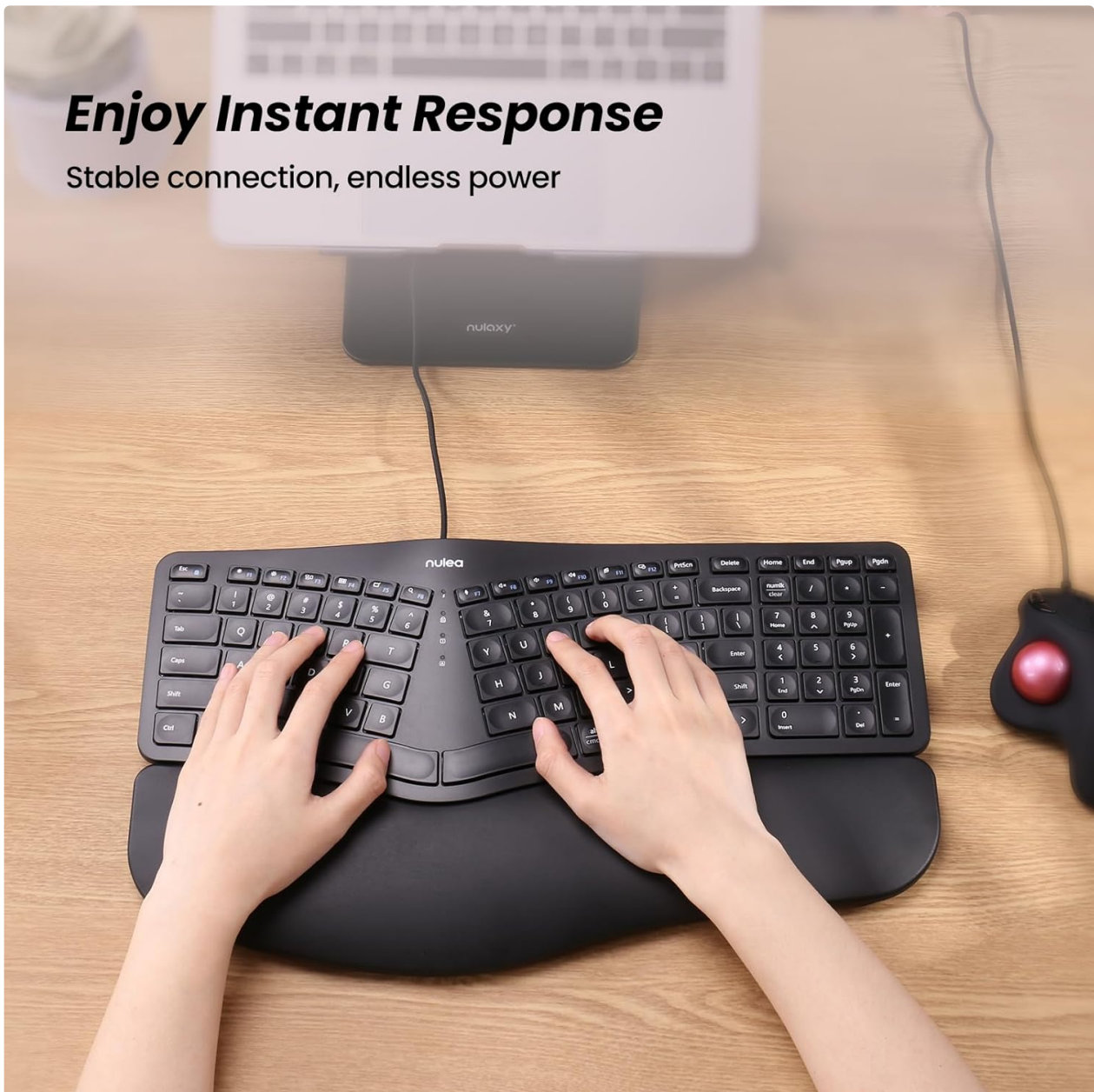
Figure 5.1: Proper hand placement on the Nulea RT05C keyboard for comfortable and efficient typing.

The Nulea RT05C features a standard QWERTY layout with 101 keys. The split design encourages a more natural hand and wrist position. Place your hands so that your wrists rest comfortably on the cushioned wrist rest, allowing your fingers to naturally reach the keys.