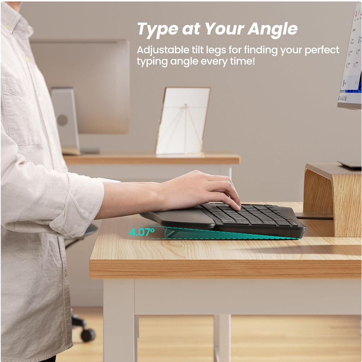
Figure 3.3: Adjustable tilt legs allow customization of the typing angle for optimal comfort.

Adjustable tilt legs for finding your perfect typing angle every time!