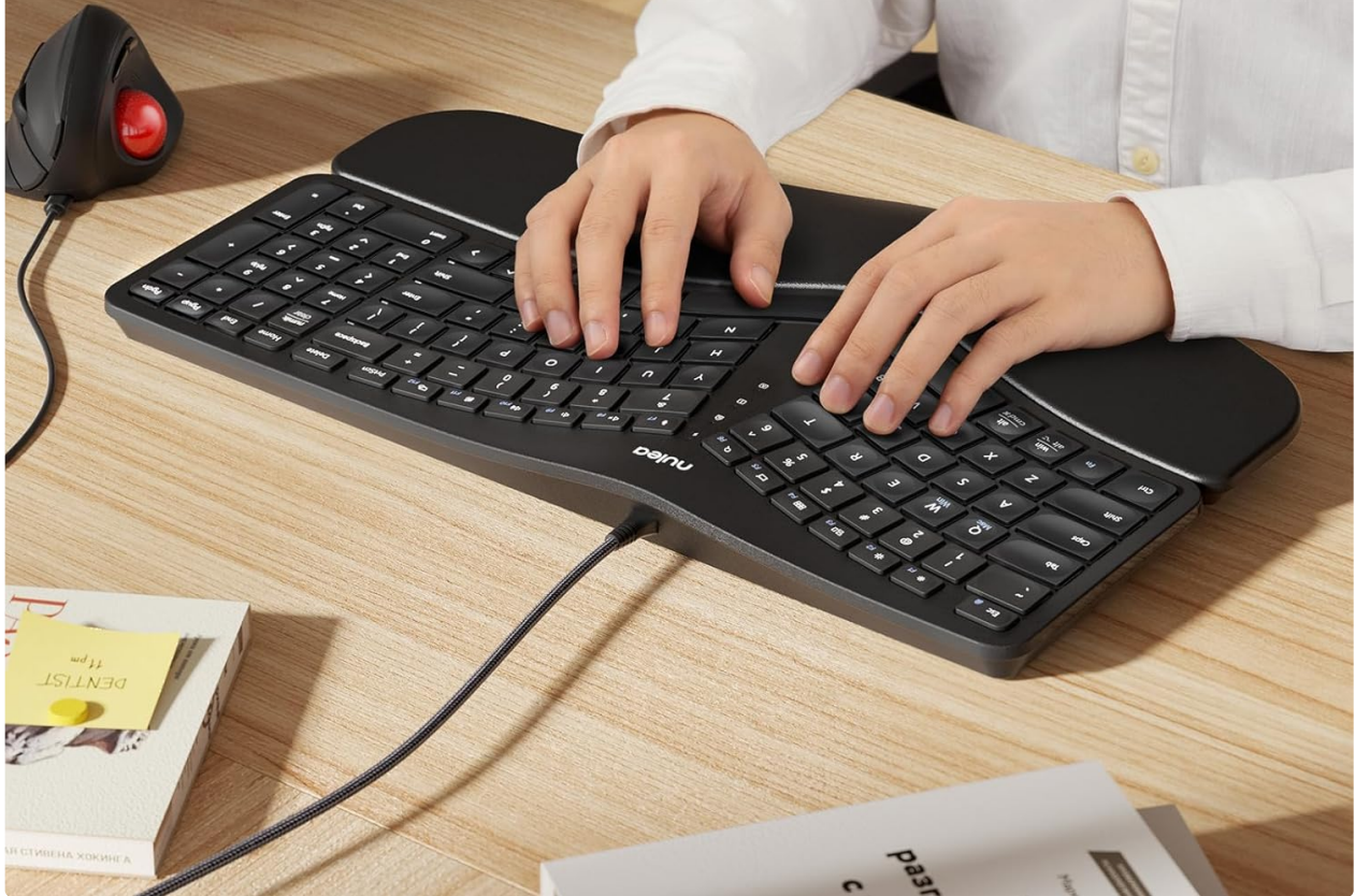
Figure 3.1: Overall view of the Nulea RT05C Ergonomic Keyboard, highlighting its split design for natural hand placement.

Split layout design for a naturally comfortable typing posture