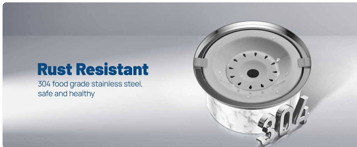
Figure 7: The Smartoo dog water bowl, showcasing its 4000ML capacity and robust food-grade thickened stainless steel construction for durability.