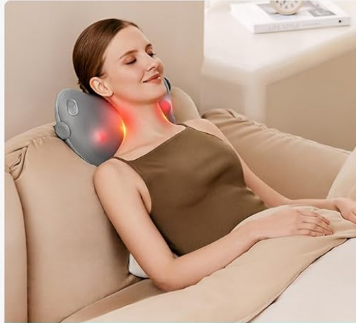
Deep kneading, full body massage