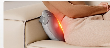
Large Area Heat

Image: A woman demonstrating the use of the SKG T1-2 PRO massager for lower back relief while seated.