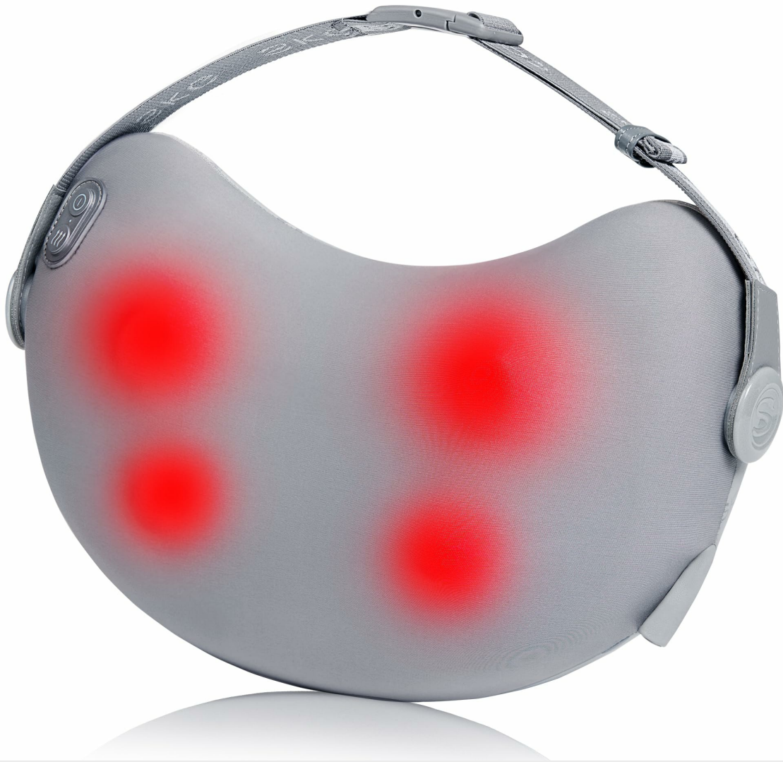
Image: The SKG T1-2 PRO massager being used on the lower back, illustrating its ergonomic design and heat function.