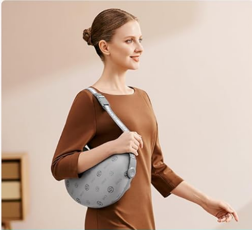
Stylish and compact design