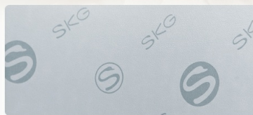
High Quality Leather