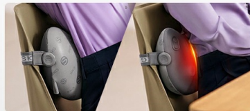
Back and Neck Massager