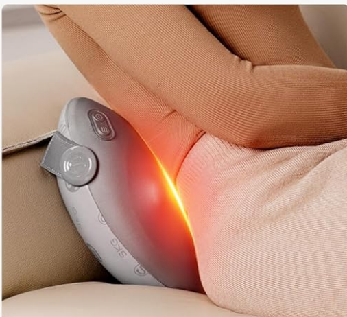
Large area heat to relax body