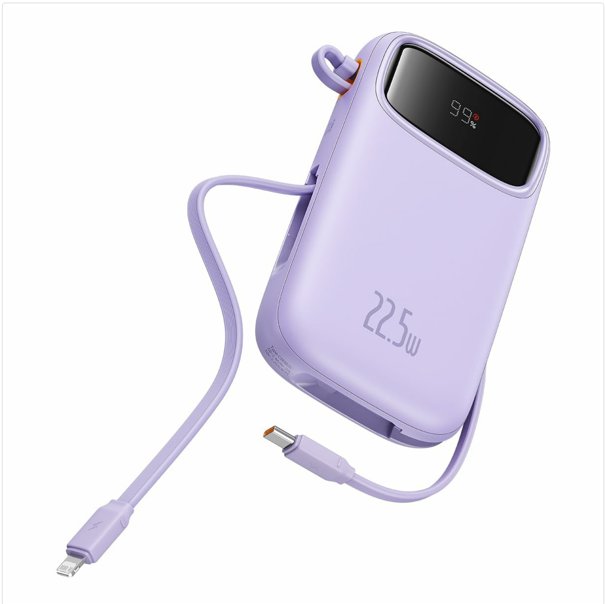
Front view of the Baseus Qpow2 Power Bank, showing its compact design and digital display.