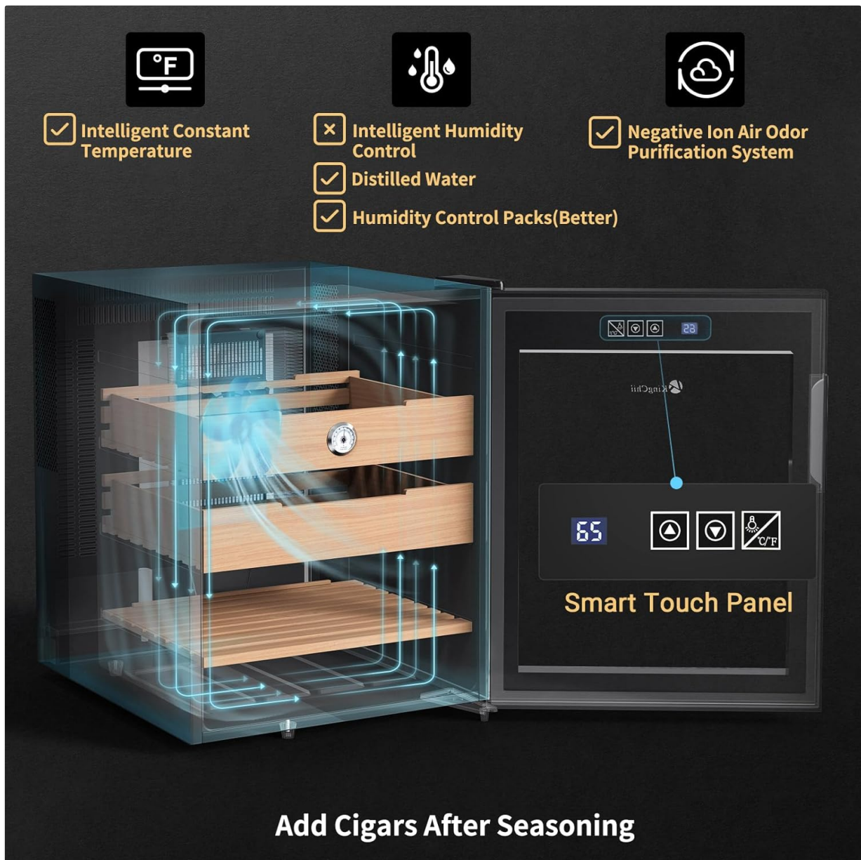
Image: A transparent view of the humidor's interior, showing the 360° air circulation system, Spanish cedar shelves, and the smart touch panel with temperature and humidity readings. It emphasizes intelligent constant temperature, humidity control with distilled water or humidity packs, and a negative ion odor purification system.