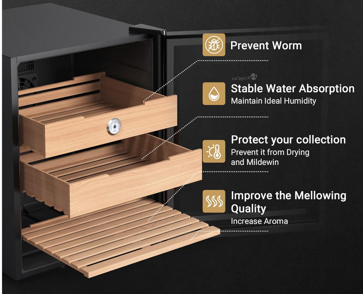
Image: Close-up of the Spanish cedar wood shelves and drawers inside the humidor, detailing benefits such as preventing worms, stable water absorption for ideal humidity, protecting collections from drying and mildew, and improving mellowing quality to increase aroma.