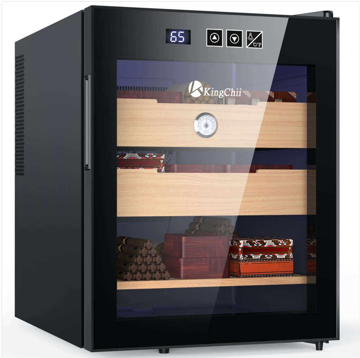
Image: Illustration of the semiconductor chip and air cooling technology within the KingChii humidor, highlighting its temperature control range of 64-74°F.