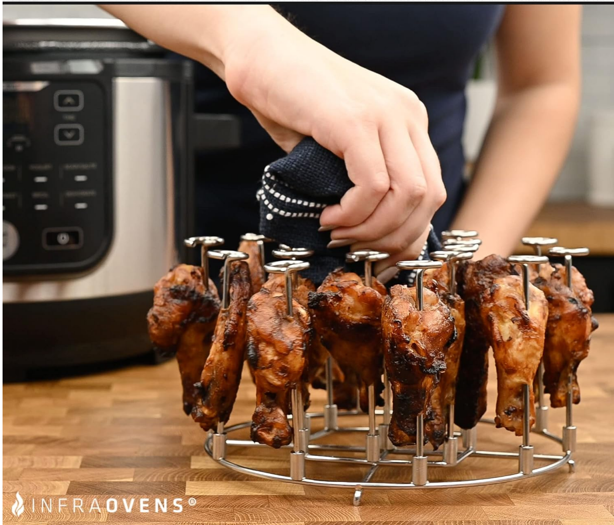
Image: A hand carefully placing cooked chicken wings onto the individual skewers of the INFRAOVENS rack, demonstrating its ease of use.

Use the middle handle to easily grab the rack