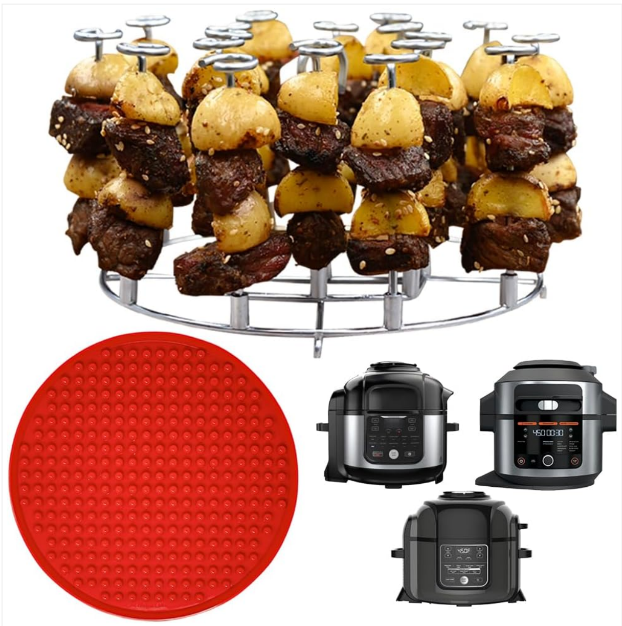
Image: The complete INFRAOVENS Pressure Cooker Accessories Rack set, showcasing the skewer stand filled with food, the red silicone mat, and various compatible Ninja Foodi models.