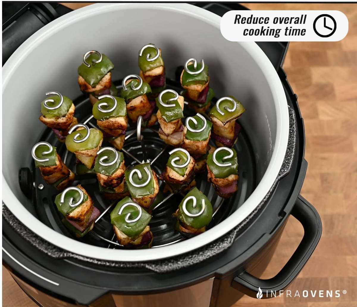
Image: The skewer stand, loaded with food, positioned inside the inner pot of a Ninja Foodi pressure cooker, ready for cooking.

Your browser does not support the video tag.