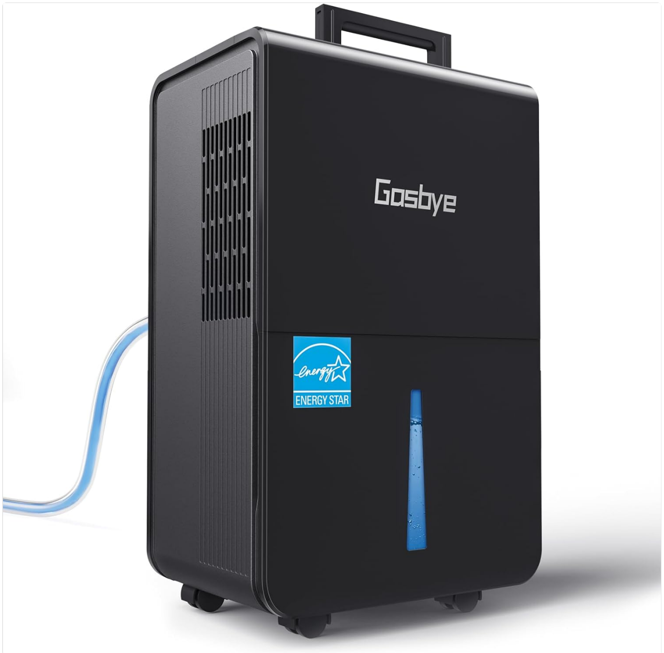
Figure 1: Gasbye DryPrime Dehumidifier (Model DryPrime-50-B) with drain hose connected. Dimensions and Energy Star rating are visible.

The Gasbye DryPrime Dehumidifier is designed for efficient operation in large areas. Its compact dimensions (11"D x 15"W x 24"H) allow for flexible placement. Ensure adequate air circulation around the unit for optimal performance.