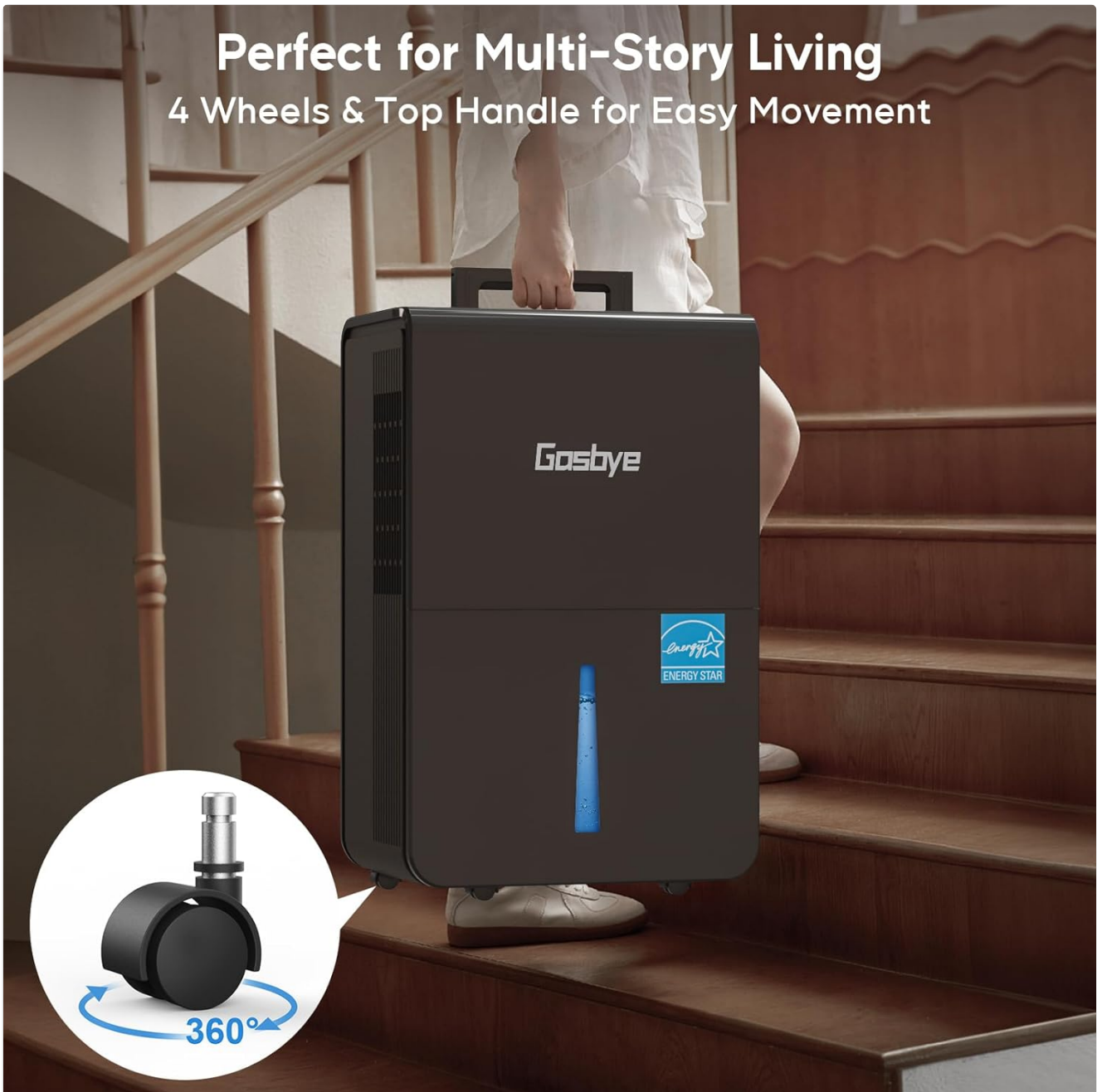
Figure 3: The Gasbye DryPrime Dehumidifier being carried up stairs using its top handle, demonstrating its portability with built-in wheels.