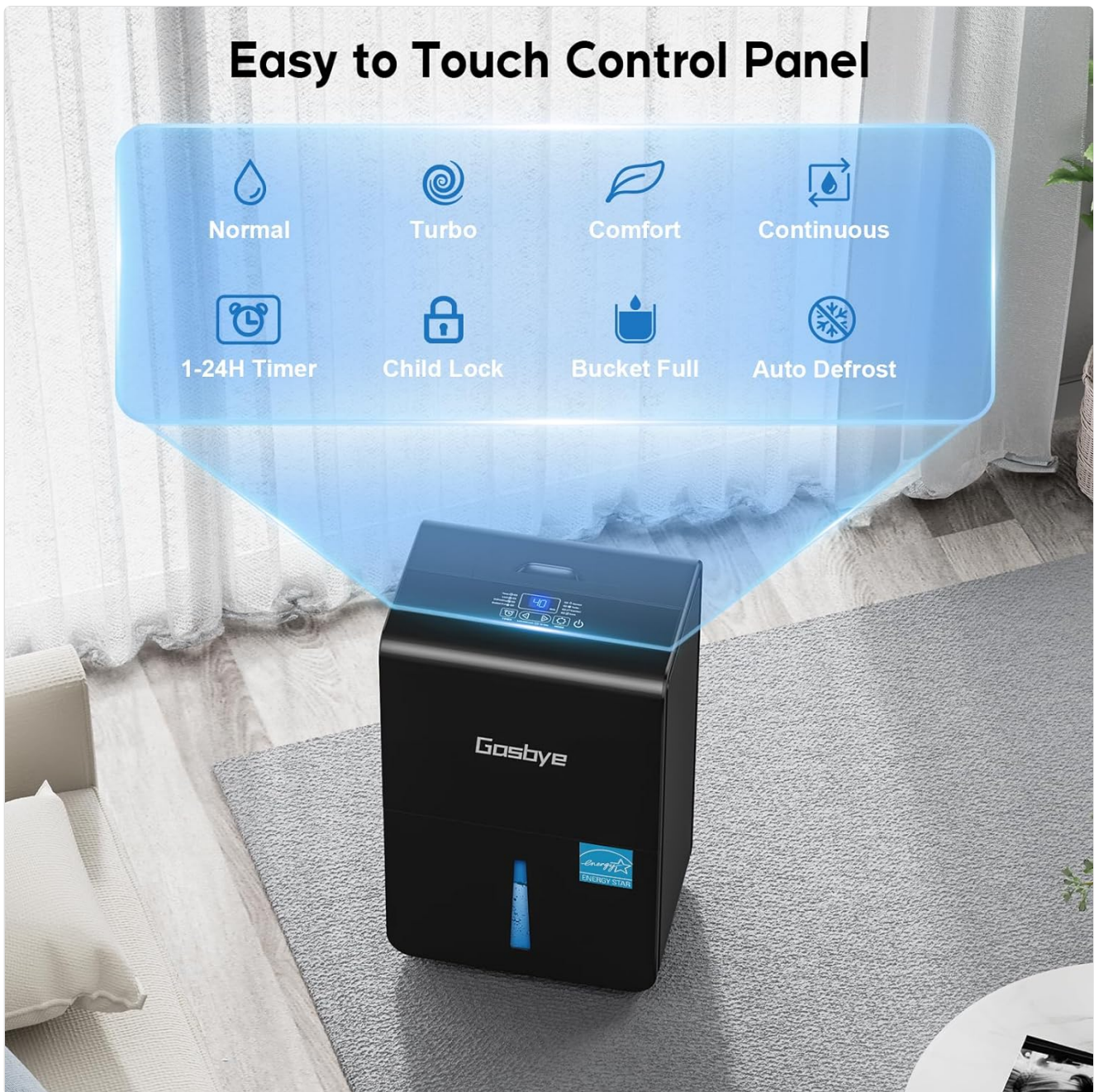
Figure 4: Close-up of the Gasbye DryPrime Dehumidifier's touch control panel, displaying icons for Normal, Turbo, Comfort, Continuous modes, Timer, Child Lock, Bucket Full indicator, and Auto Defrost.