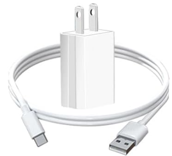
Power adapter and usb-c cable