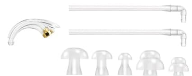
Thick sound tube for moderate-severe loss