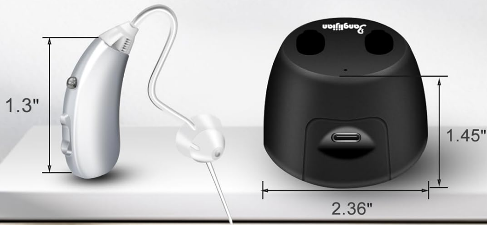
Figure 2.1: Contents of the gift package, showing the hearing device, charging dock, shockproof case, power adapter, USB-C cable, cleaning brush, slim sound tubes, thick sound tubes, and various ear domes.

Familiarize yourself with the parts of the hearing device: