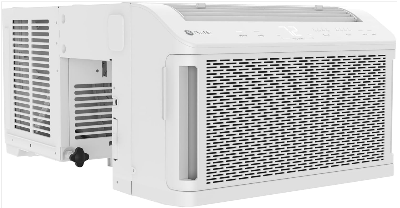
Image: Front view of the GE Profile ClearView Window Air Conditioner, showcasing its sleek design.