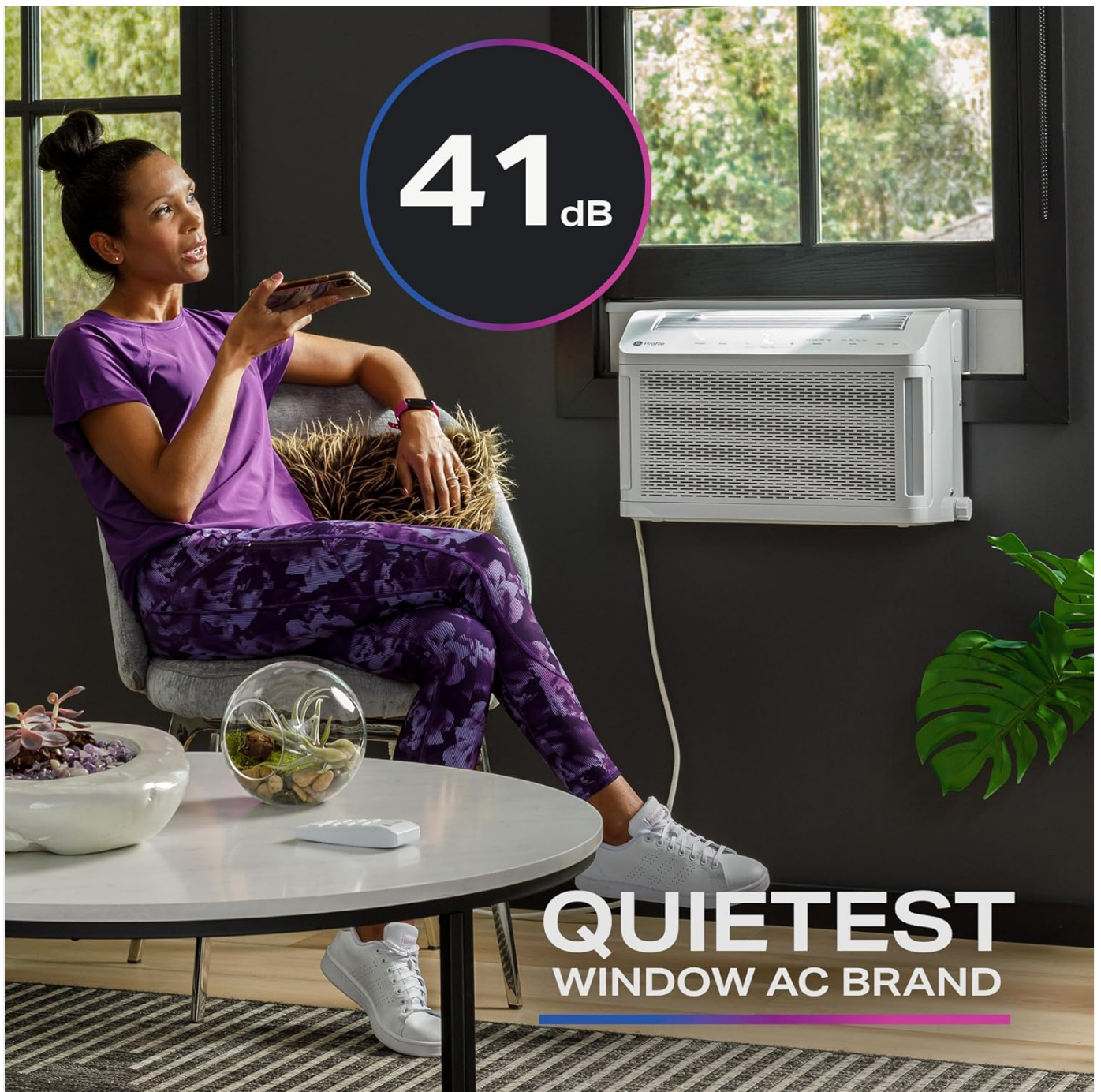
Image: A person relaxing near the air conditioner, highlighting its quiet operation at 41 decibels.