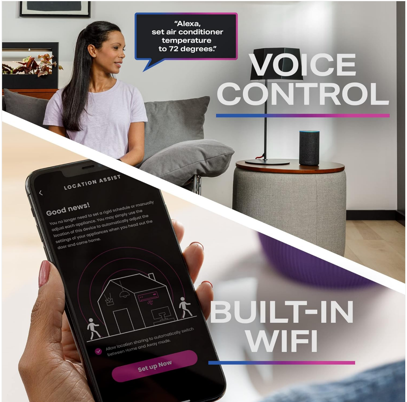
Image: Illustration of the air conditioner being controlled via voice commands and the SmartHQ mobile application.