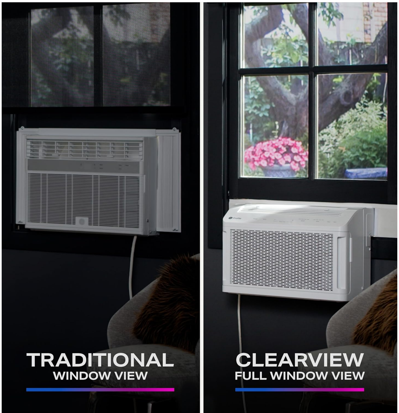
Image: A side-by-side comparison illustrating the full window view provided by the ClearView design versus a traditional window air conditioner.