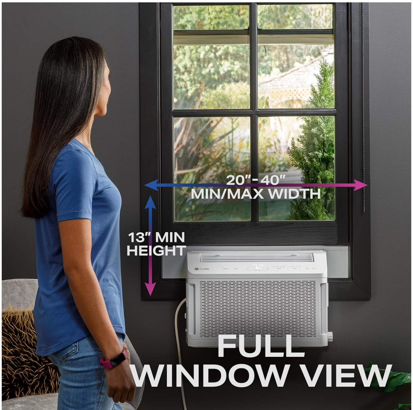
Image: Diagram showing the minimum and maximum window dimensions required for installation of the air conditioner.