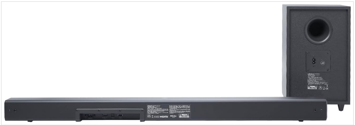
Figure 3: Rear view of the soundbar and subwoofer, highlighting the various connection ports for setup.