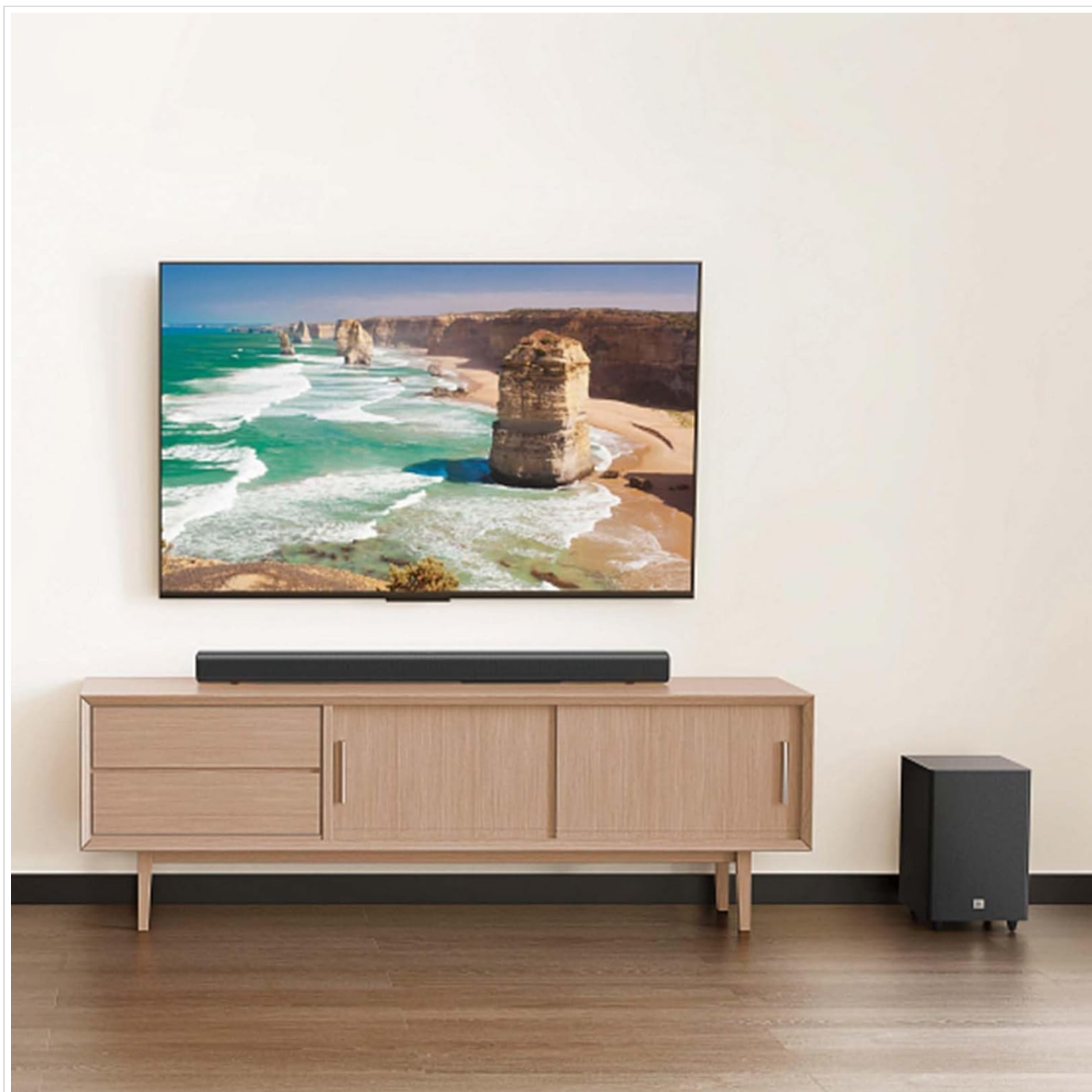
Figure 2: Example setup of the JBL Cinema SB550 Soundbar and wireless subwoofer in a typical living room arrangement.