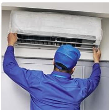
Image: Technician installing the indoor unit of the air conditioner.