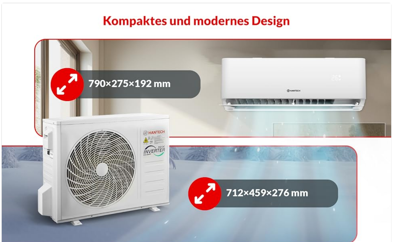
Image: Dimensions of the HANTECH H-PRO indoor unit.