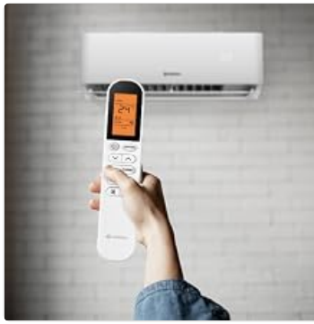
Image: Close-up of the HANTECH air conditioner remote control.