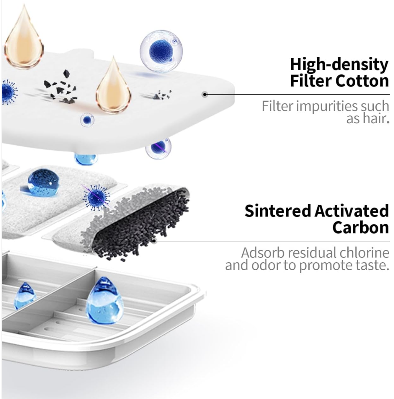
Image: Diagram detailing the multi-layer filtration system.