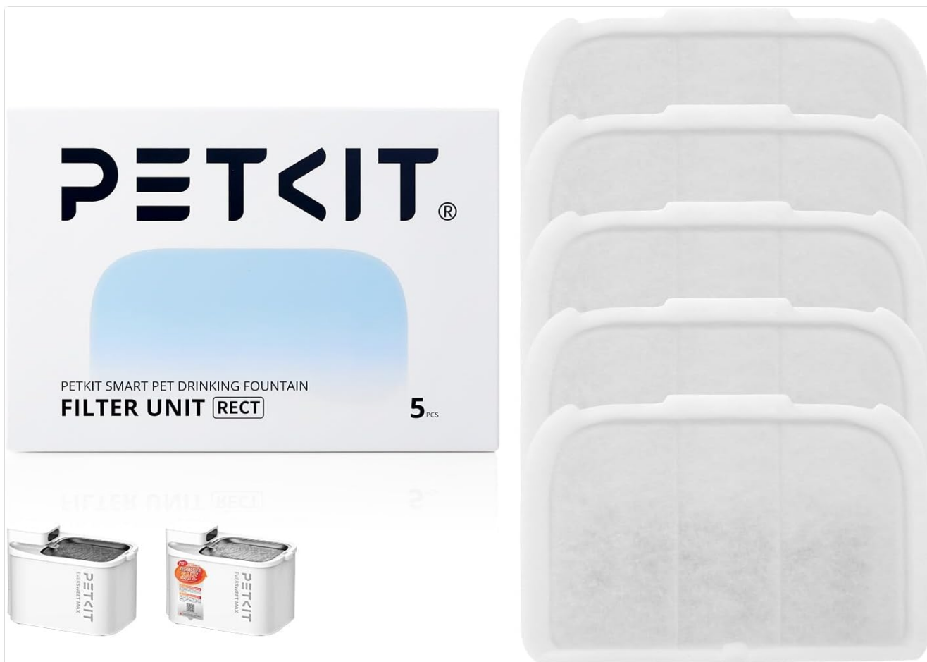
Image: PETKIT Filter Unit Rect 5-pack packaging and individual filters.