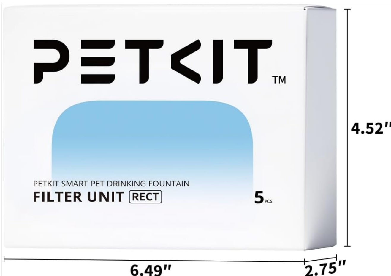
Image: Product packaging with dimensions.