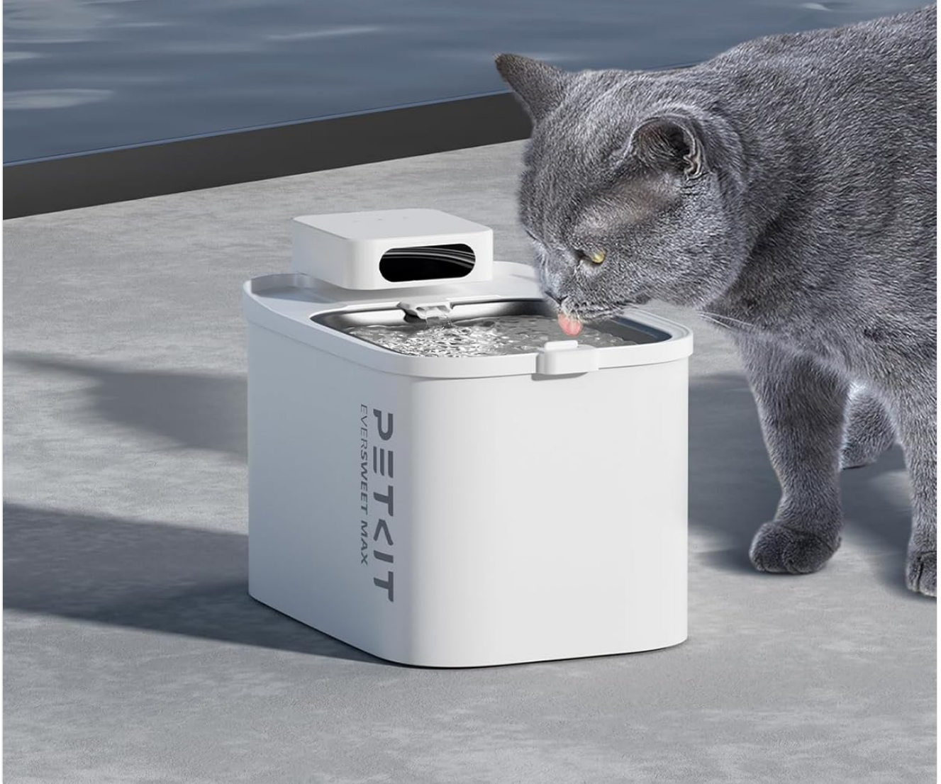
Image: A cat drinking from the compatible PETKIT EVERSWEET MAX Cordless Water Fountain.

Suitable for PETKIT EVERSWEET MAX (cordless)