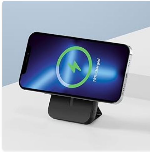
Figure 3.3: Visual representation of the magnetic charging connection.