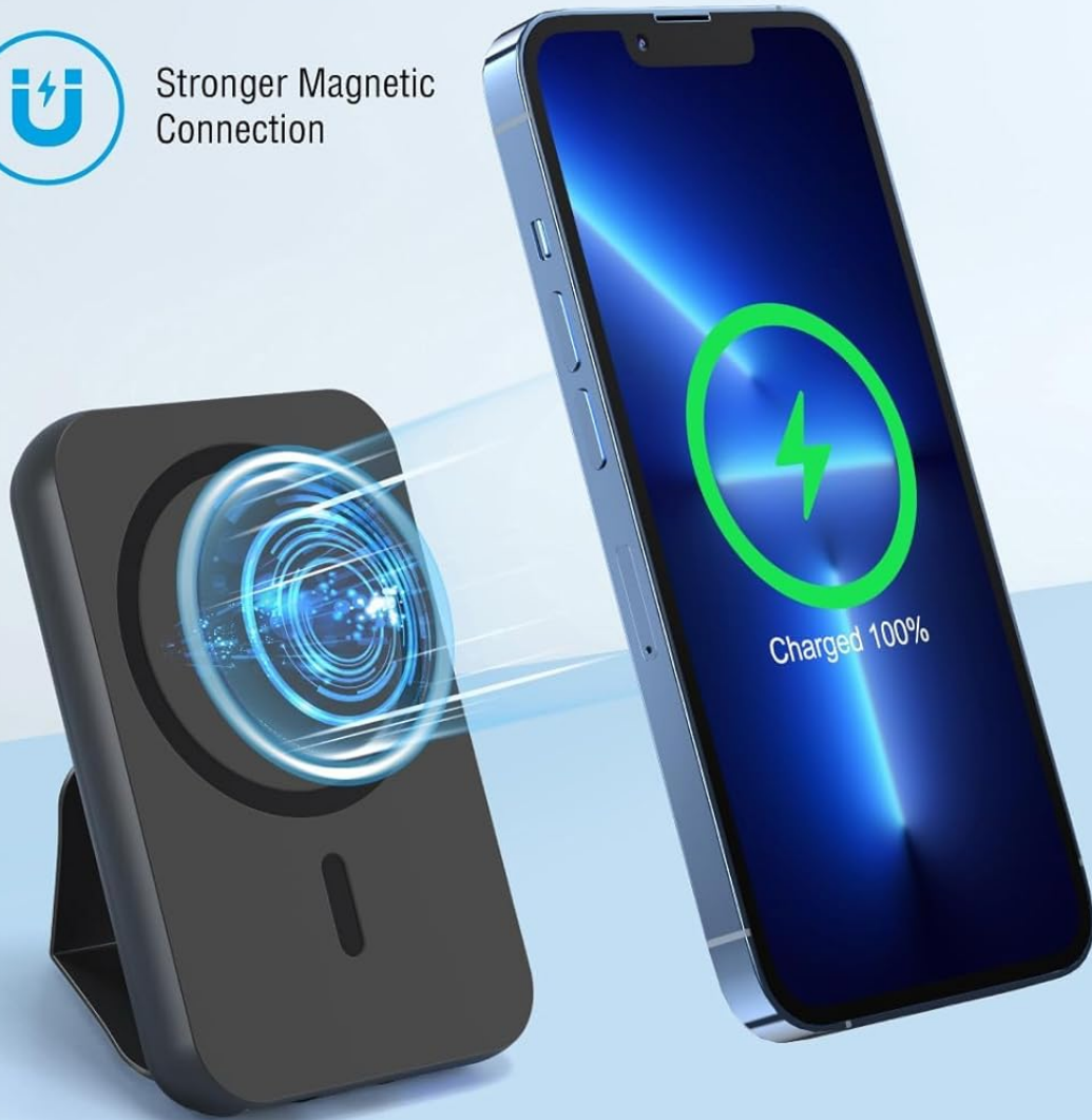
Figure 3.2: Magnetic attachment for wireless charging.