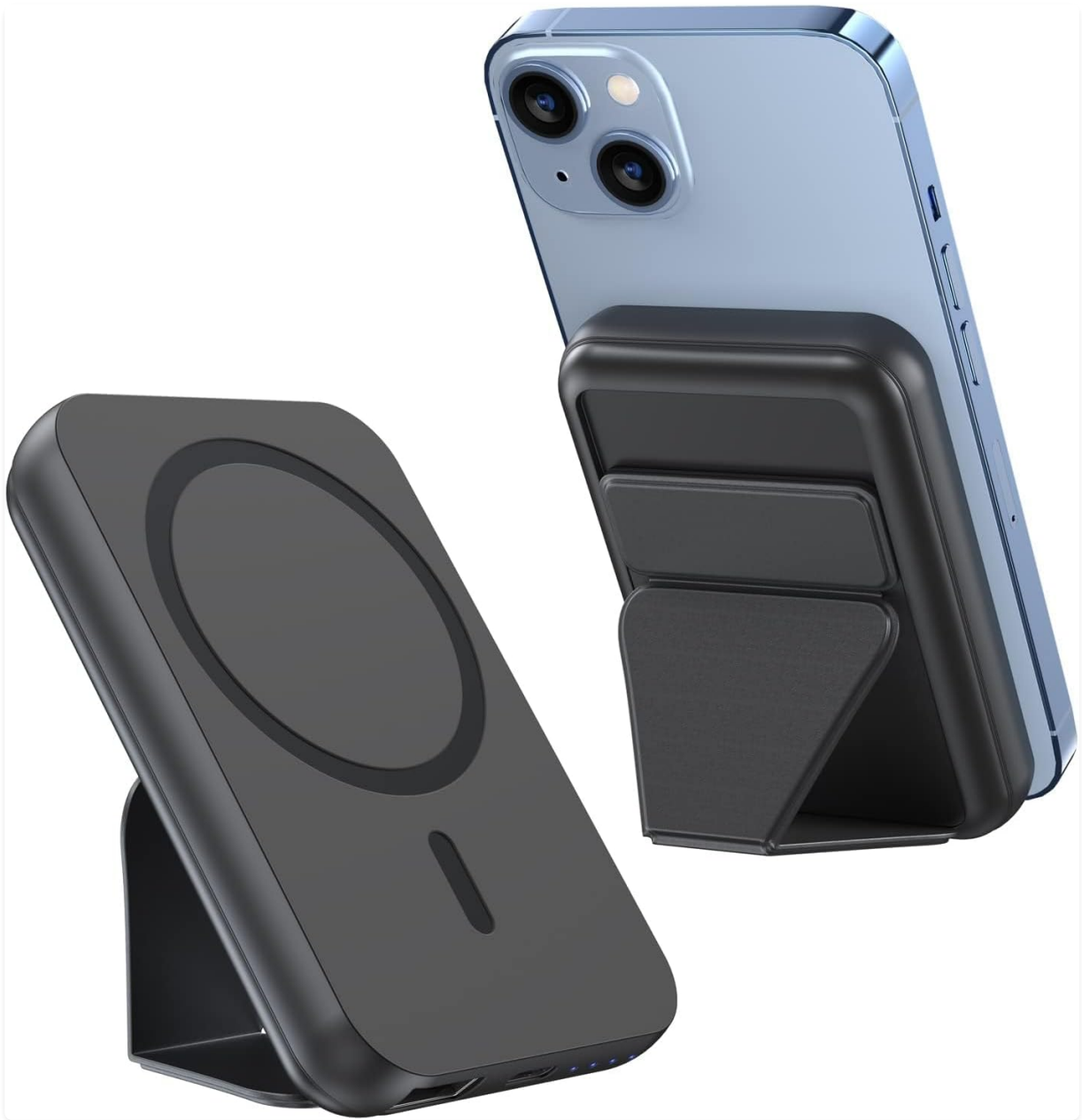
Figure 1.1: QiSa Portable Charger with its integrated foldable stand.