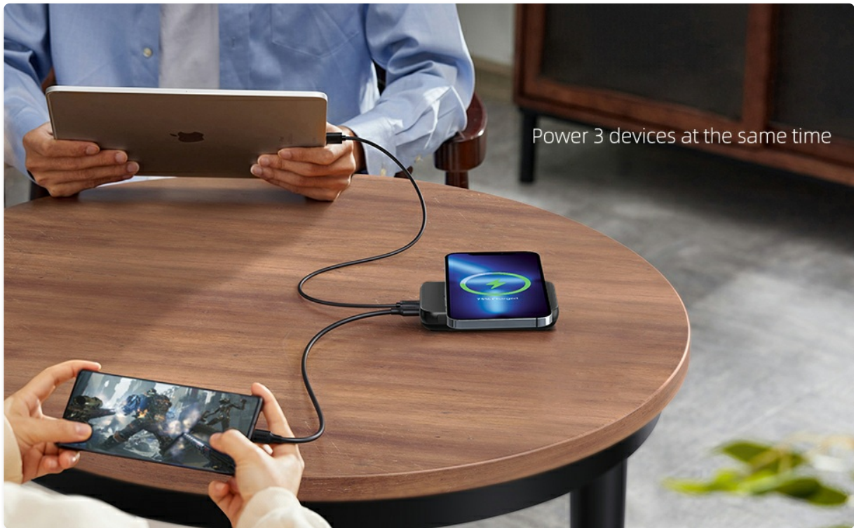
Figure 4.4: Charging multiple devices at once.