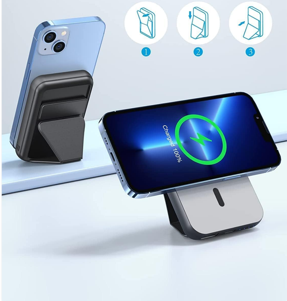
Figure 4.5: How to use the foldable stand.

Versatile foldable kickstand provides stable hands-free phone viewing