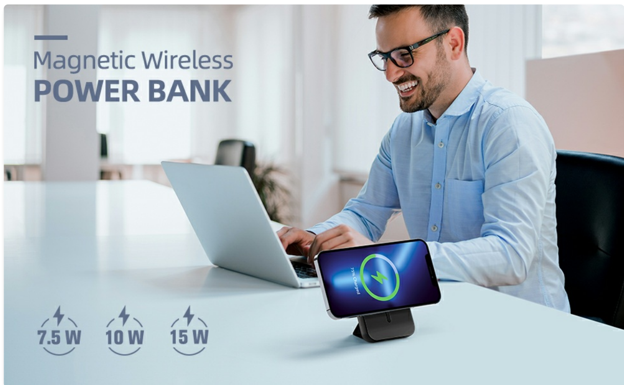
Figure 4.7: Horizontal viewing with the stand.