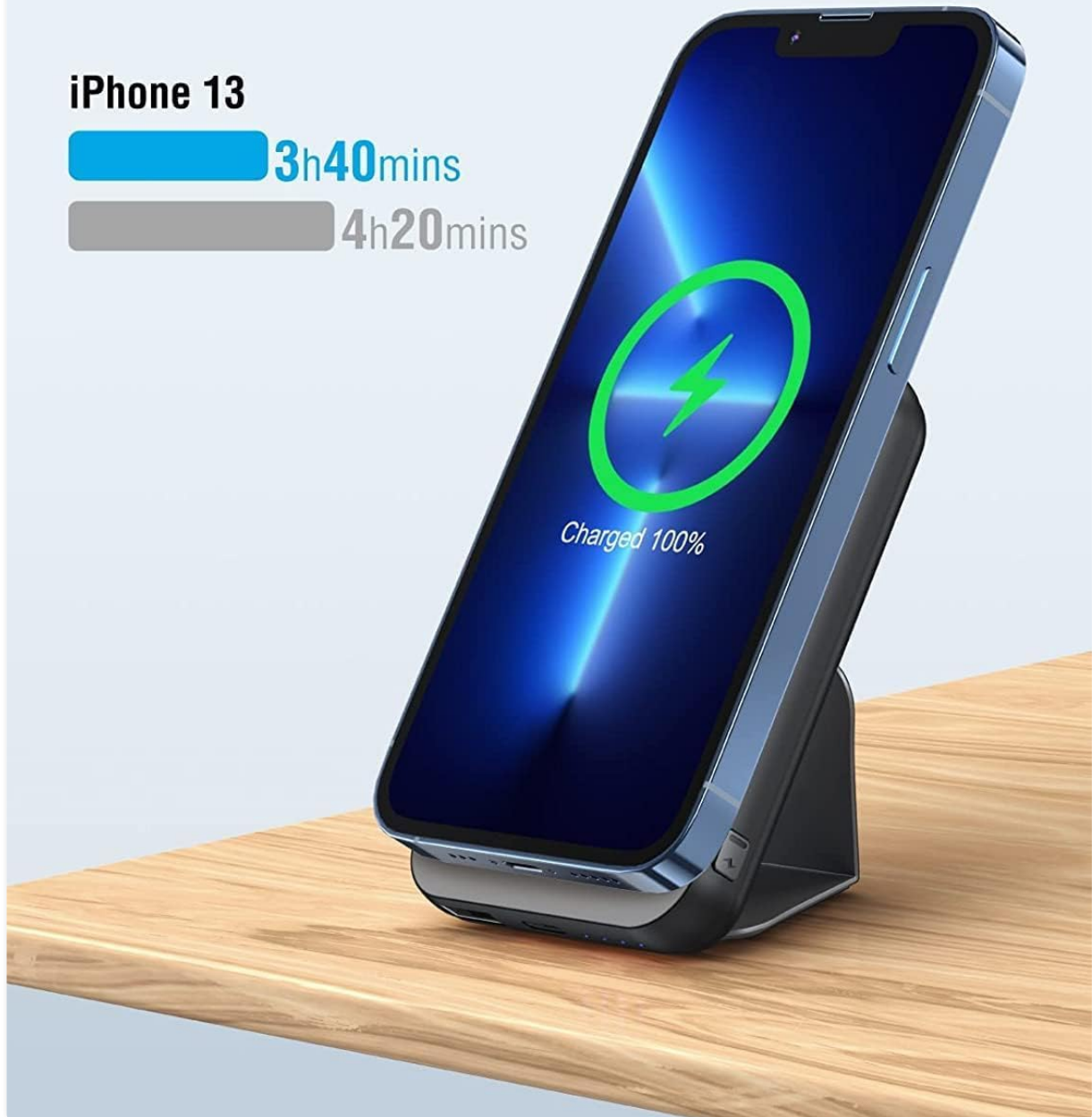
Figure 4.1: Wireless charging in action.