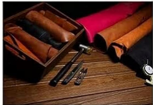
Figure 6: The cover is crafted with attention to detail, reflecting handmade leather craftsmanship.