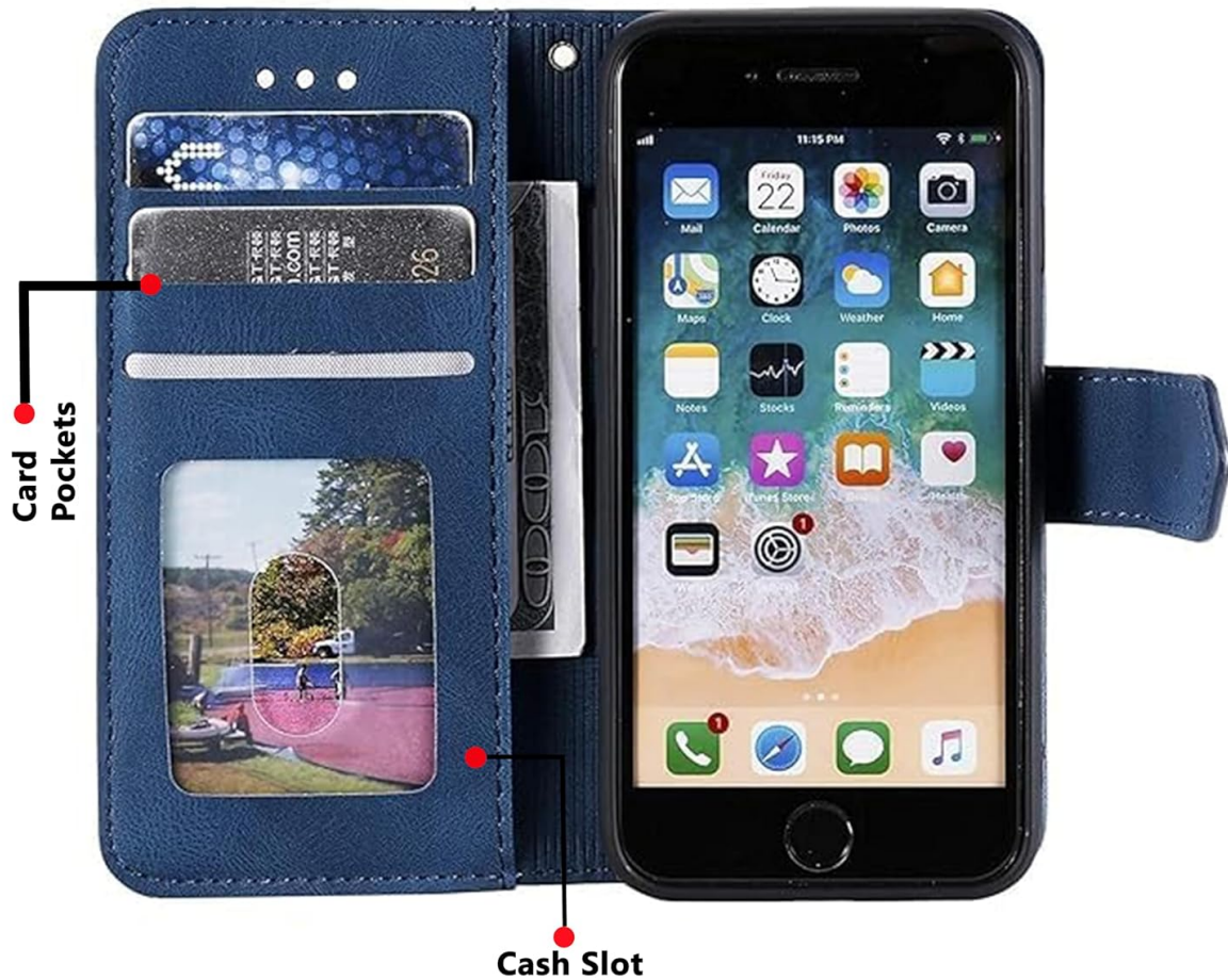
Figure 5: Internal view showing card pockets and a cash slot for convenient storage.

Combines 3 Card Slots and 1 Cash Compartment Specifically Designed to minimize bulk and weight for everyday handy carry