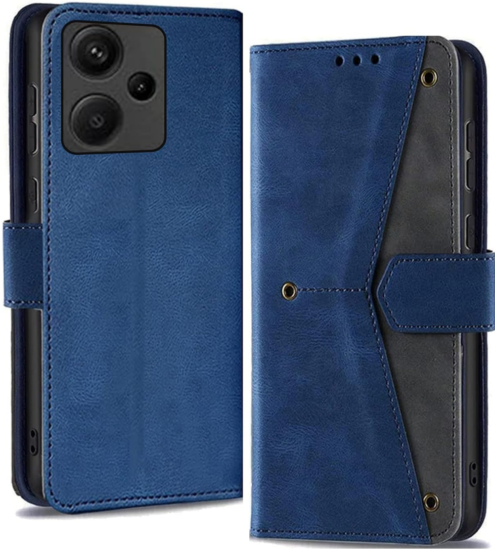
Figure 1: Front view of the Generic Mobile Flip Cover Blue.