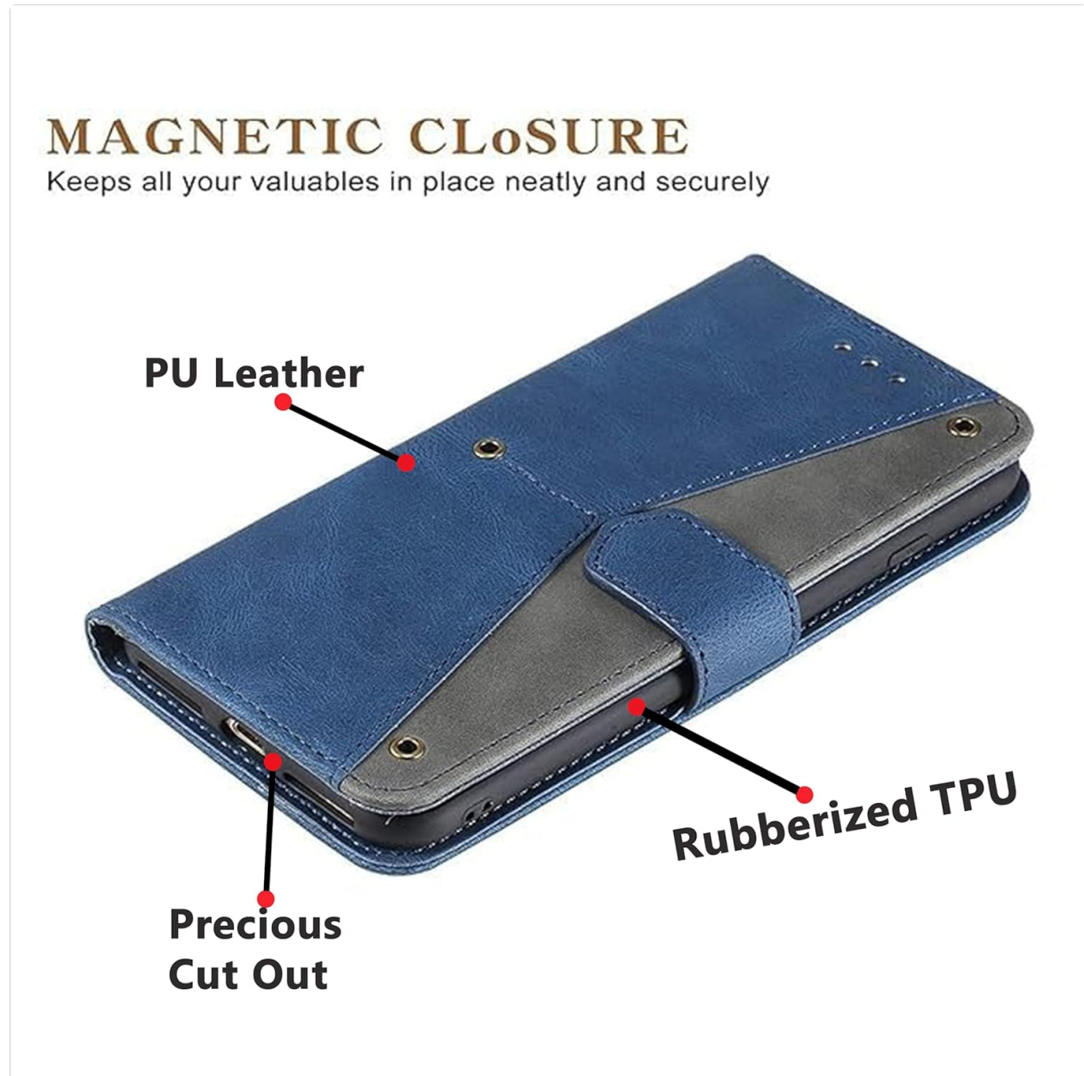
Figure 3: Illustration of the magnetic closure and material composition (PU Leather, Rubberized TPU).

The integrated magnetic closure ensures the front flap remains securely closed, protecting your screen from scratches and impacts when not in use. To open, simply lift the magnetic strap.