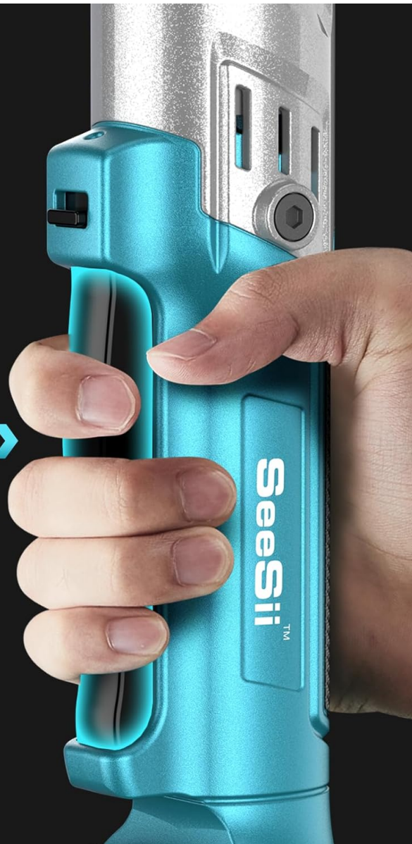
Image: A hand operating the variable speed trigger and the safety lock mechanism on the handle of the ratchet wrench. The harder the trigger is pressed, the faster the tool operates, up to 200 RPM.