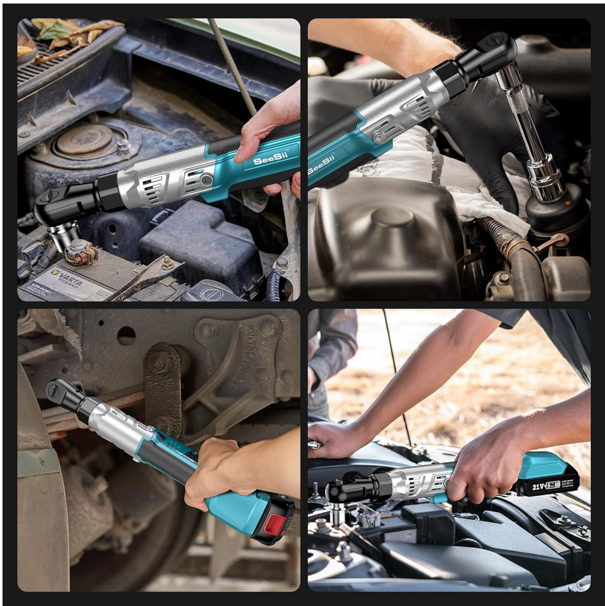
Image: A collage demonstrating the Seesii ratchet wrench being used for different tasks, including working on an engine, tightening bolts, and reaching into tight spaces.