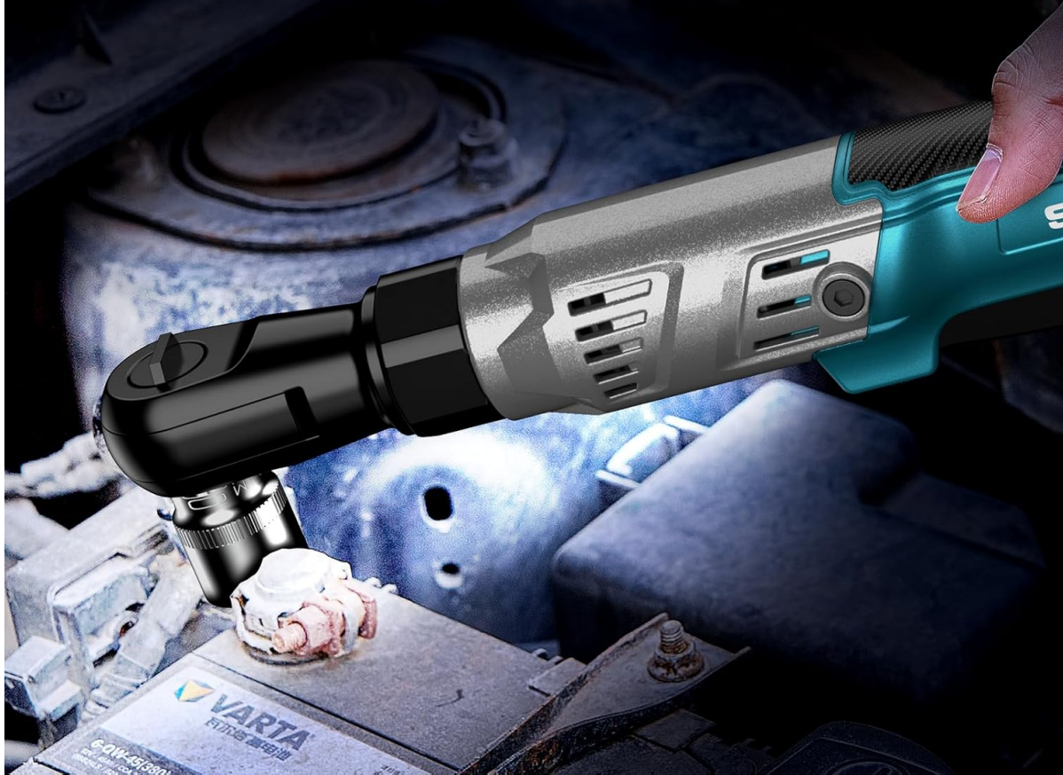
Image: The Seesii ratchet wrench in use, with its built-in LED light illuminating a dark engine compartment, providing clear visibility for the task.