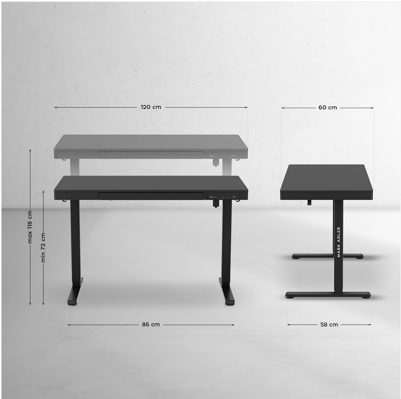
Image: Desk dimensions and height adjustment range (Min 72 cm, Max 118 cm).

Refer to the detailed graphical assembly guide provided with your product for step-by-step instructions. Ensure all connections are secure before use.