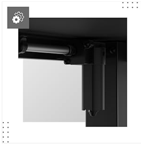
Image: Powerful motor for reliable height adjustment.