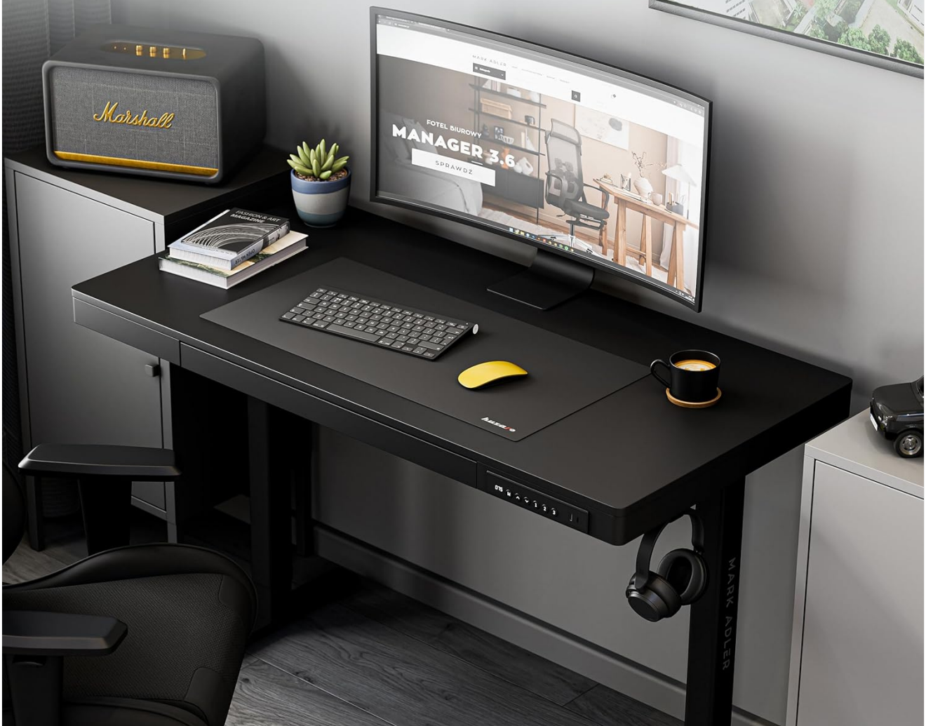
Image: Desk in use, demonstrating comfortable work in both sitting and standing positions.

Height adjustment 72–118 cm. Comfortable work at the electric desk.