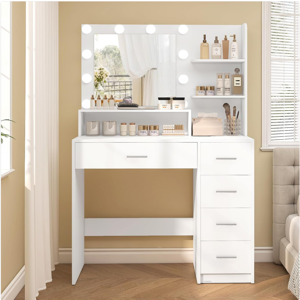
Figure 1: FIONESO Makeup Vanity Desk - Overall View

This image displays the complete FIONESO Makeup Vanity Desk, showcasing its white finish, large mirror with surrounding lights, and integrated storage solutions including drawers and open shelves.