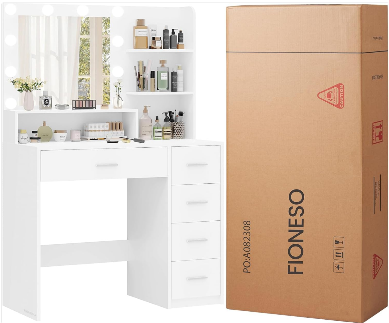
Figure 2: Product Packaging and Main Components

Before beginning assembly, verify that all components listed below are present and undamaged. If any parts are missing or damaged, please contact customer support.