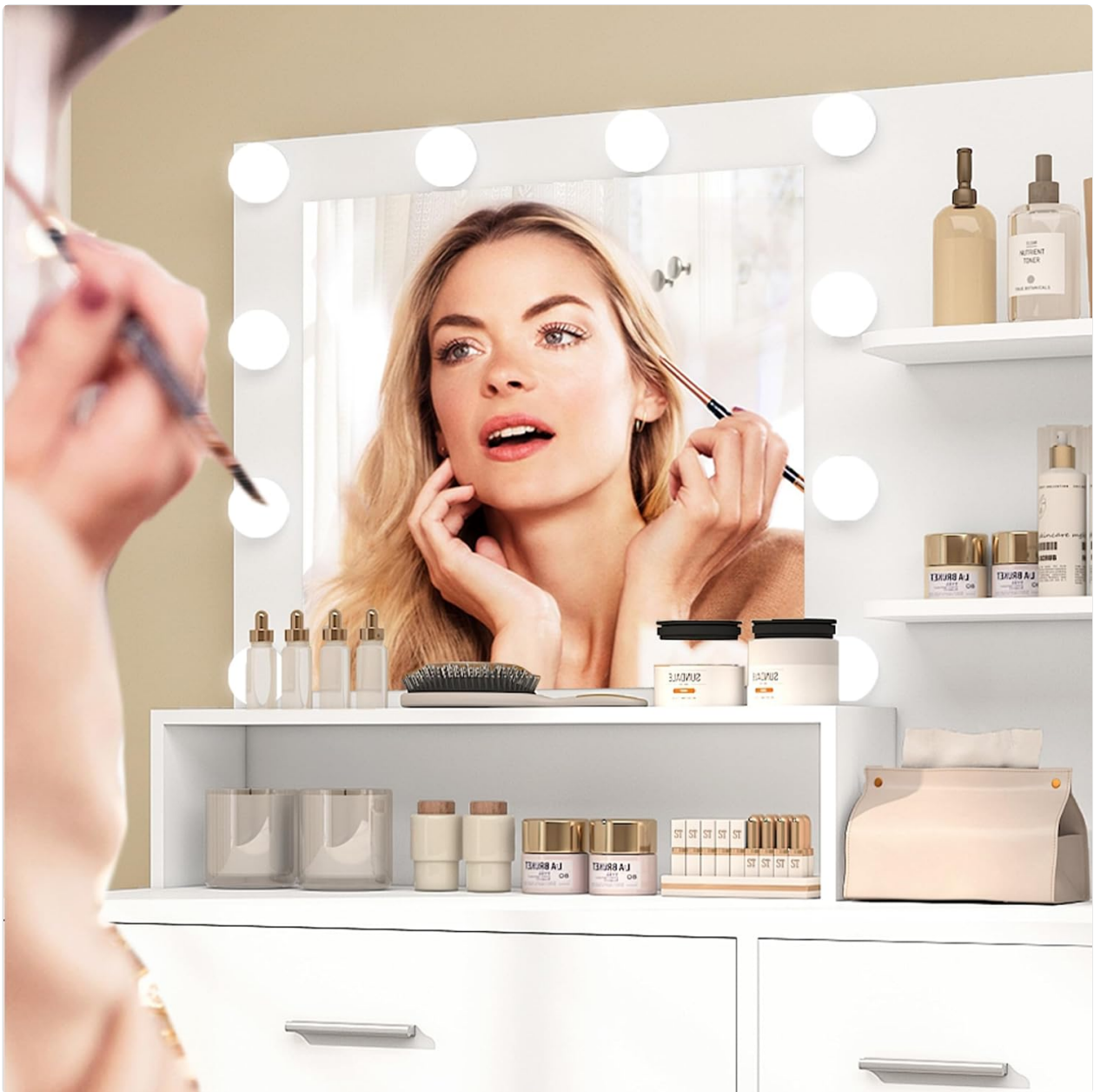
Figure 4: 3 Lighting Effects & Adjustable Brightness

This image illustrates the three distinct lighting modes: Cold White (3500K), Warm White (4500K), and Warm Yellow (6500K), and indicates the tactile switch for control.