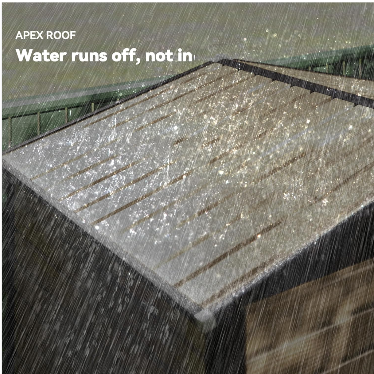
Image 6.1: The apex roof design of the shed, demonstrating its effectiveness in shedding water to prevent accumulation.