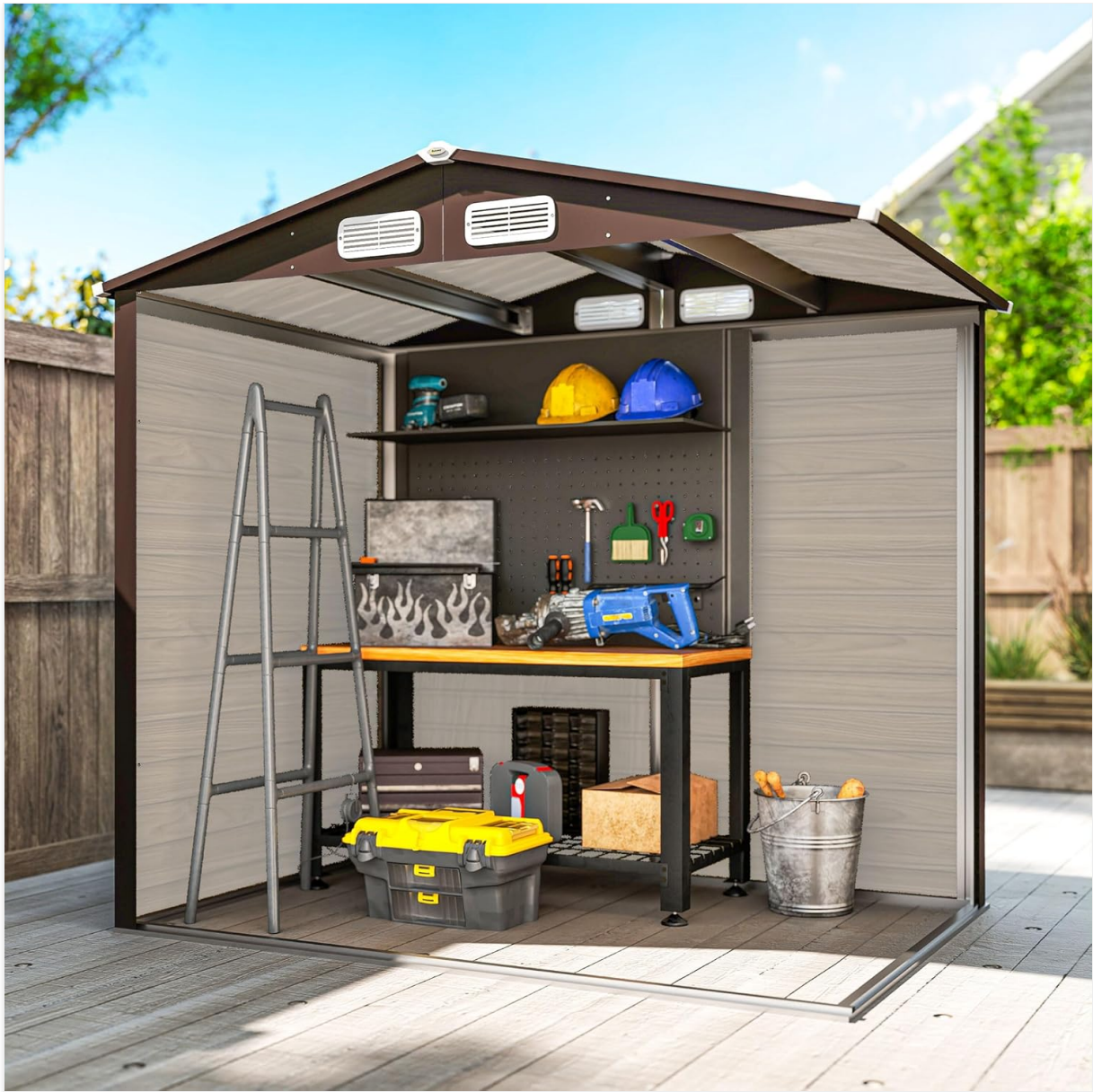
Image 8.2: An interior view of the shed, showcasing its capacity to store various garden tools, equipment, and a workbench, demonstrating practical storage solutions.