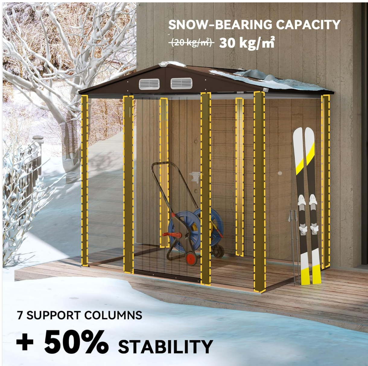
Image 4.2: Illustration of the shed's internal structure, emphasizing the seven support columns that contribute to enhanced stability and snow-bearing capacity.