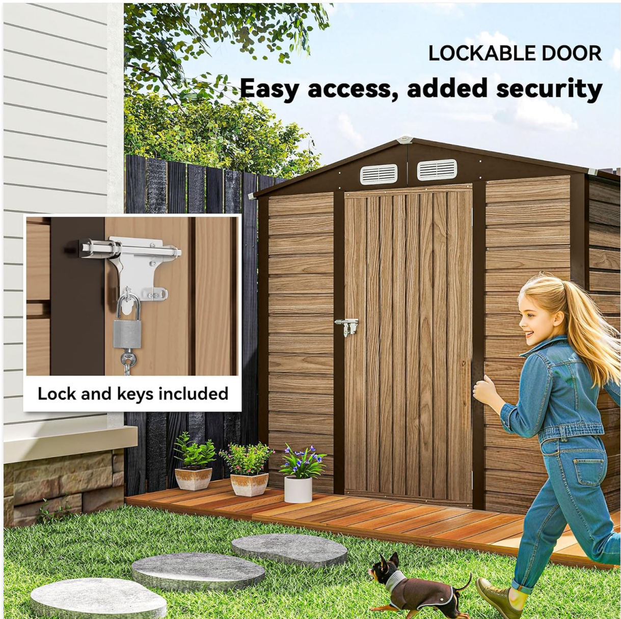
Image 5.1: Detail of the shed's lockable door, showing the latch mechanism, padlock, and keys for securing contents.