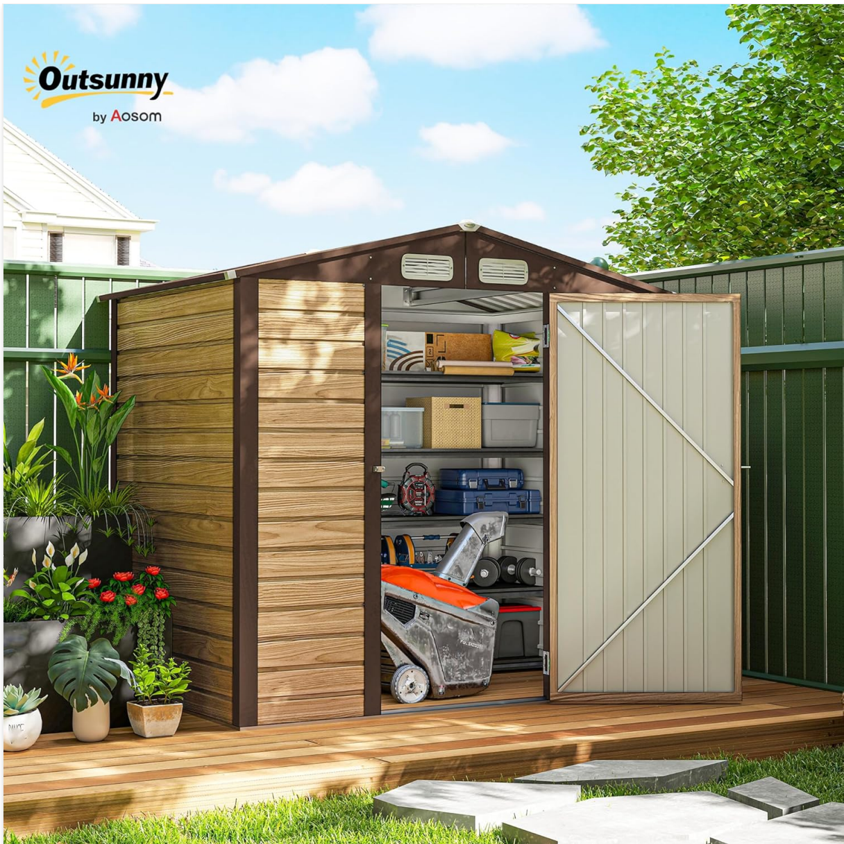
Image 1.2: The Outsunny storage shed situated in a garden, demonstrating its aesthetic integration into an outdoor space, with one door open.