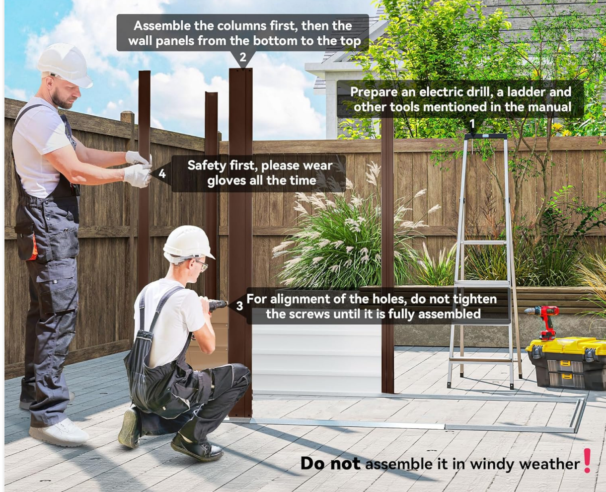
Image 4.1: Visual guide for shed assembly, highlighting the sequence of installing columns and wall panels, and emphasizing safety precautions like wearing gloves and avoiding assembly in windy conditions.