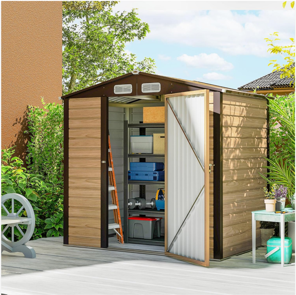
Image 1.1: The Outsunny 6' x 4' Metal Outdoor Storage Shed, featuring its oak-colored panels and open double doors, revealing organized interior storage.