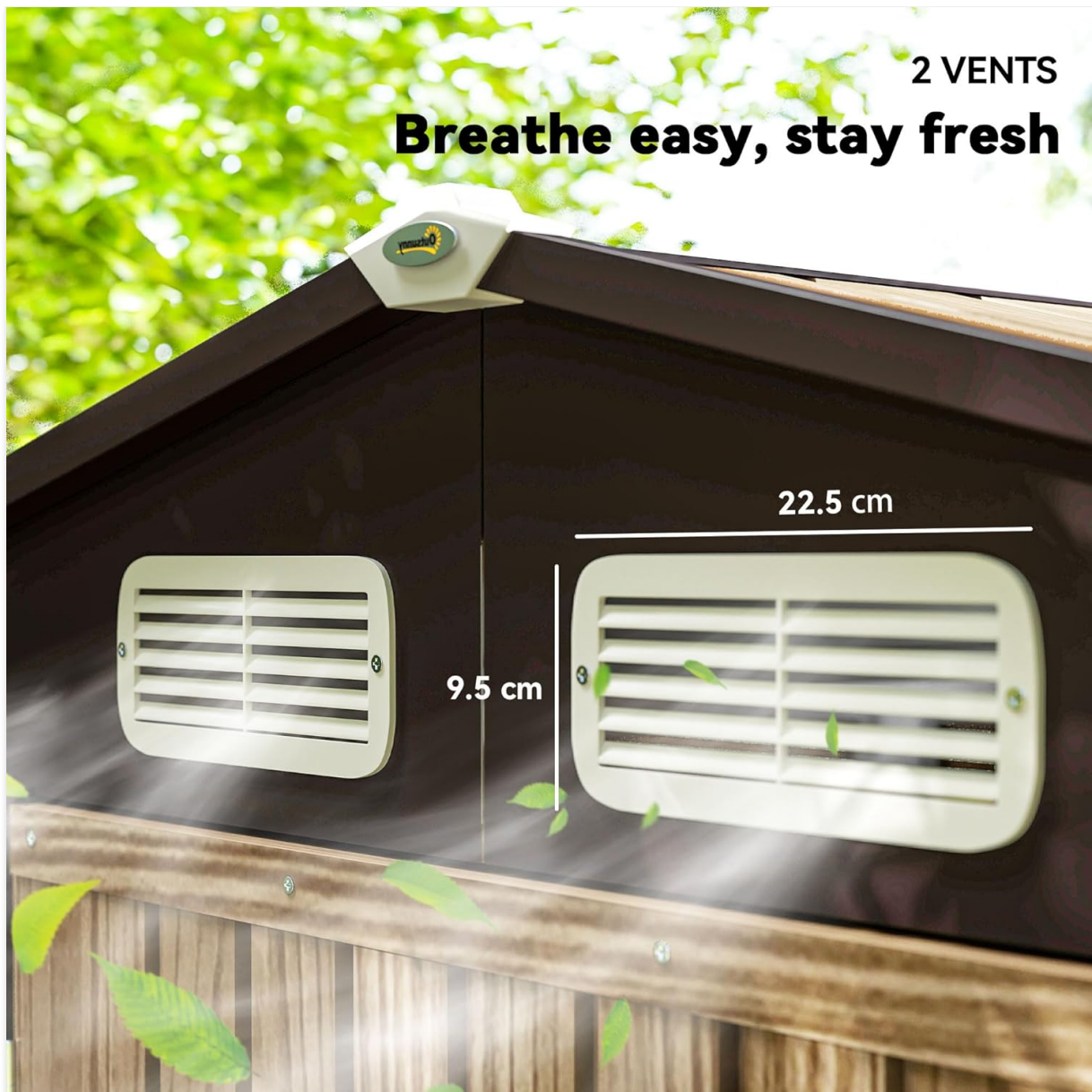
Image 5.2: A close-up view of the two ventilation vents on the shed, illustrating their design for air circulation.