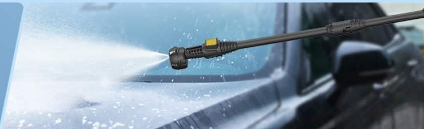
Image: Visual guide demonstrating the different spray patterns available with the 5-in-1 nozzle, from 0° for precision to 65° for wide coverage.