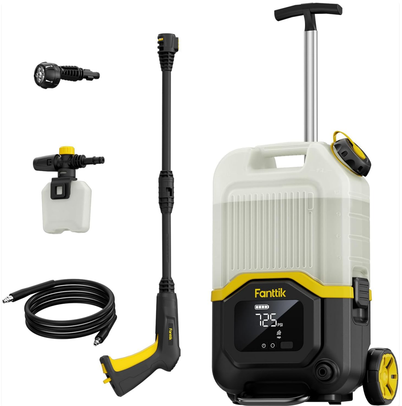
Image: Fanttik NB8 Ultra Cordless Pressure Washer with its main components including the wheeled tank, spray gun, hose, and detergent bottle.