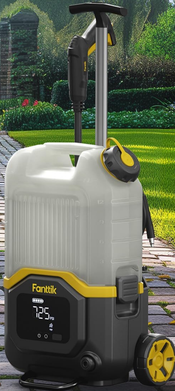
Image: Visual representation of the three smart cleaning modes (Low, Middle, High) with their respective PSI levels on the Fanttik NB8 Ultra.