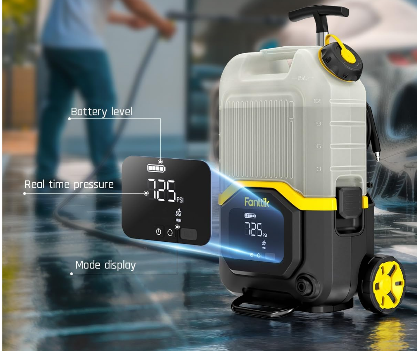
Image: Close-up of the large LED screen displaying battery level, real-time pressure, and mode selection, offering an enhanced interactive experience.