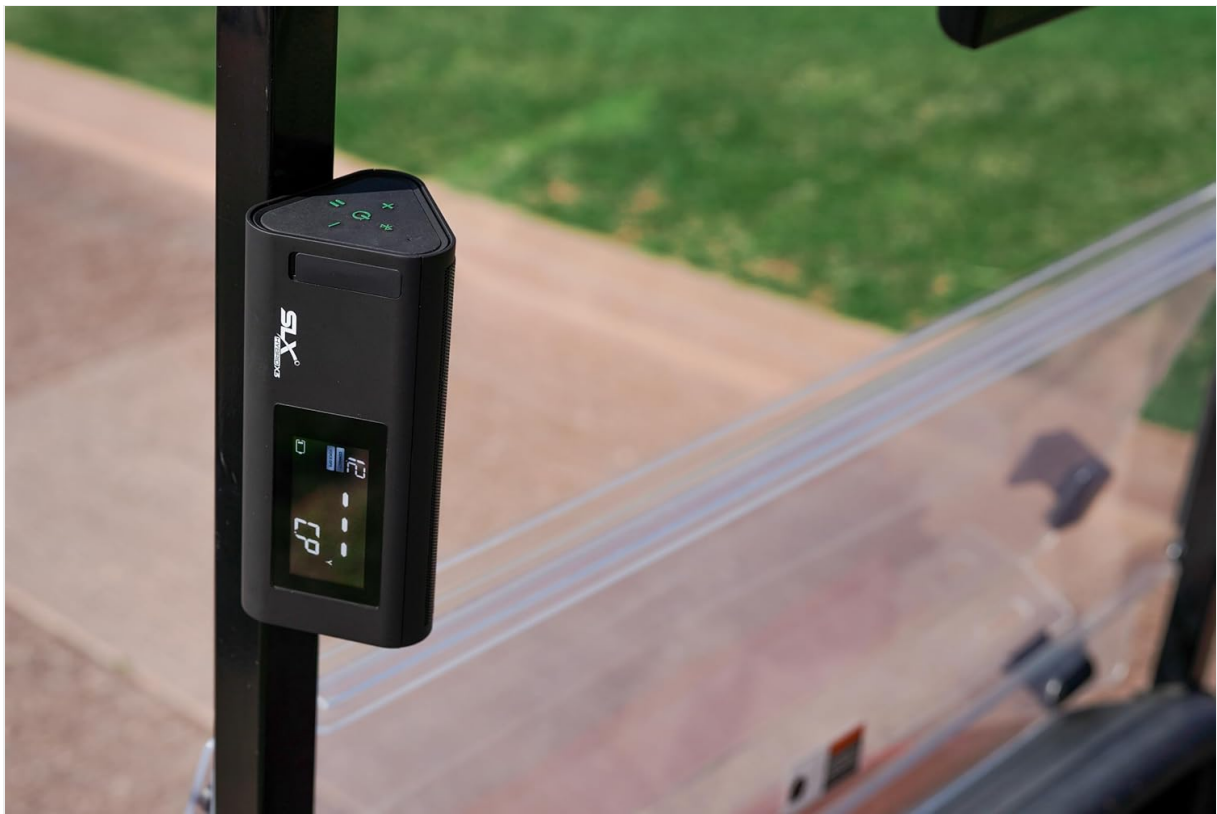
Image: The SLX Hybrid Pro device is shown magnetically attached to the metal frame of a golf cart.