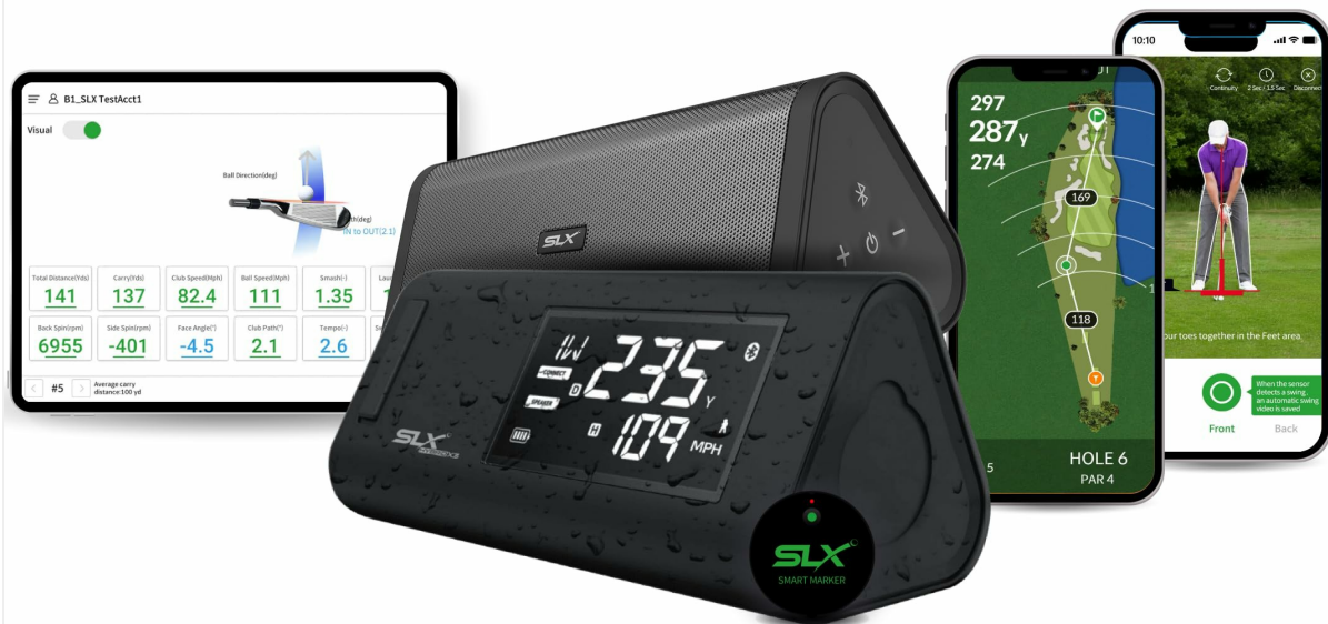
Image: The SLX Hybrid Pro device positioned on green grass, displaying golf metrics like club speed and ball speed.