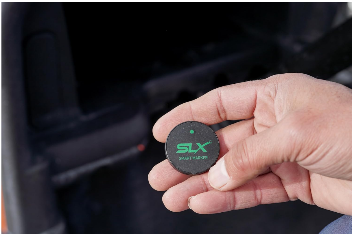
Image: A hand holds the small, circular SLX Smart Marker remote, which is used for various device functions.

The device includes a Smart Marker Remote. This remote can be used to trigger video capture or other functions within the app. Refer to the app's interface for specific uses and setup of the Smart Marker.