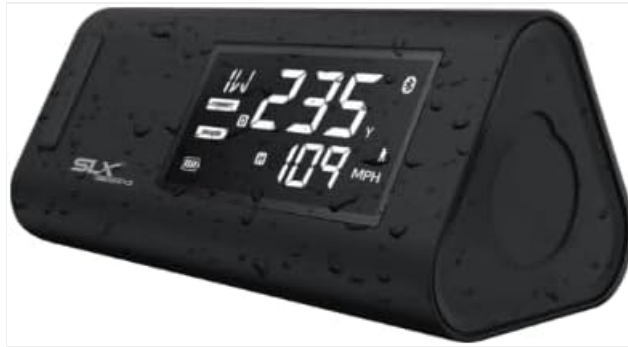
Image: The SLX Hybrid Pro device is shown with water droplets on its surface, illustrating its water-resistant design.