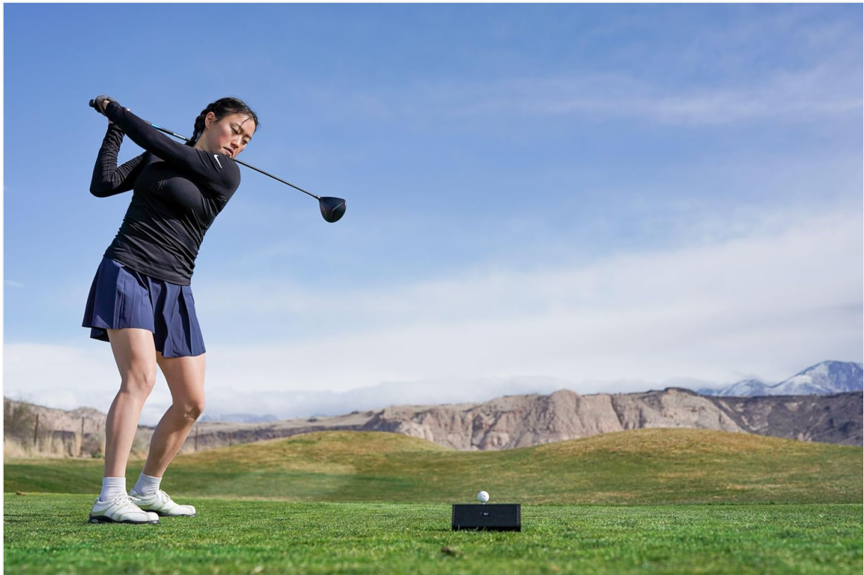
Image: A golfer in mid-swing with the SLX Hybrid Pro positioned on the grass behind the golf ball, ready to capture swing data.

For accurate swing and ball data, place the SLX Hybrid Pro 4-5 feet directly behind your golf ball. Ensure there are no obstructions between the device and the ball. For shorter irons or wedges, moving the device slightly closer to the ball may improve data capture.