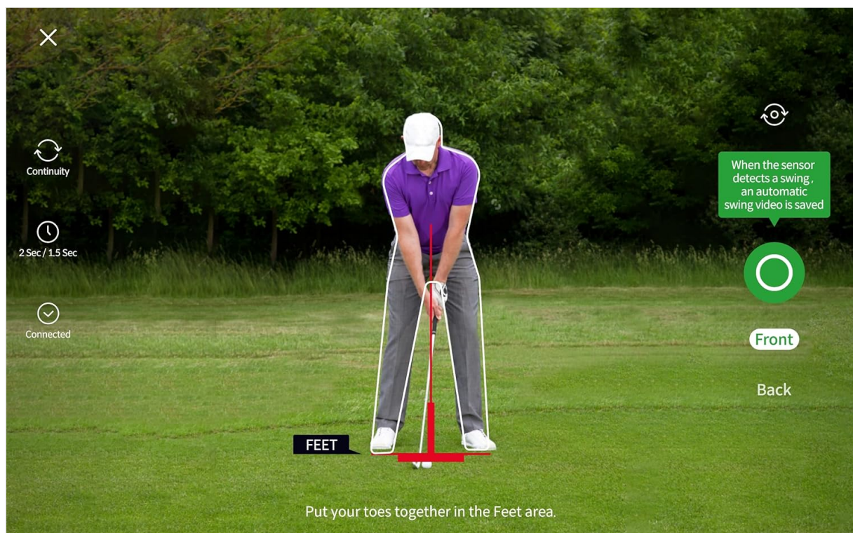
Image: A screenshot from the SLX Connect App demonstrating the setup for swing video capture, including a guide for feet placement.