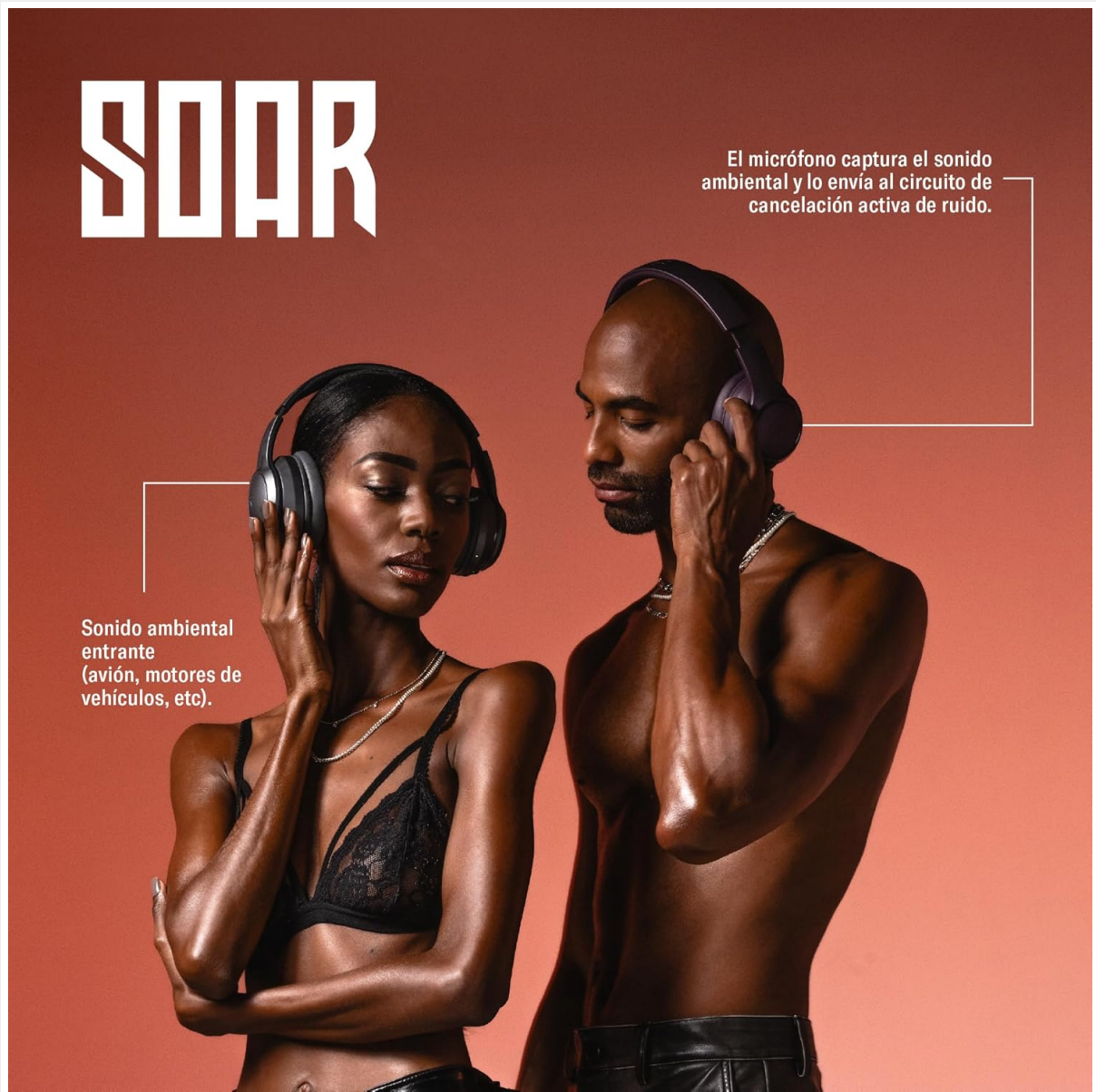
Image: Diagram illustrating how Active Noise Cancellation functions by capturing ambient sound and generating an inverse wave to cancel it.

Sonido ambiental entrante (avión, motores de vehículos, etc).