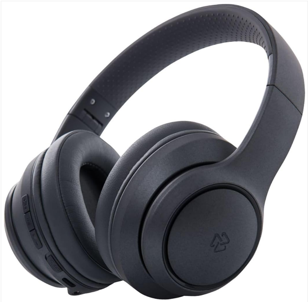
Image: STF Soar Over-Ear Headphones, gray model.