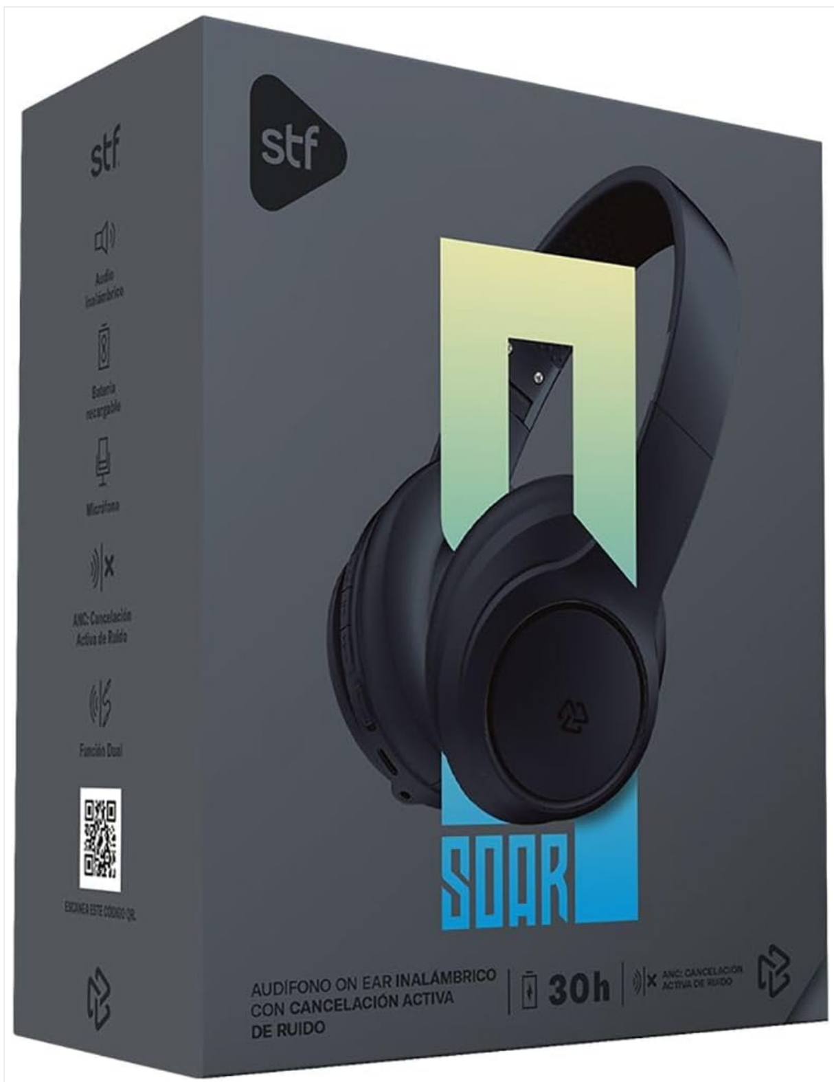
Image: Retail packaging for STF Soar Over-Ear Headphones, showing the product and key features.