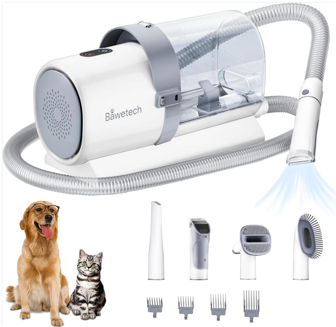
Figure 1: Bawetech Dog Grooming Vacuum Kit and Accessories.

The Bawetech Dog Grooming Vacuum Kit includes the main vacuum unit, a flexible hose, and five interchangeable grooming tools: a grooming brush, deshedding tool, electric clippers, cleaning brush, and a narrow nozzle. Various clipper guard combs are also provided for customized grooming lengths.