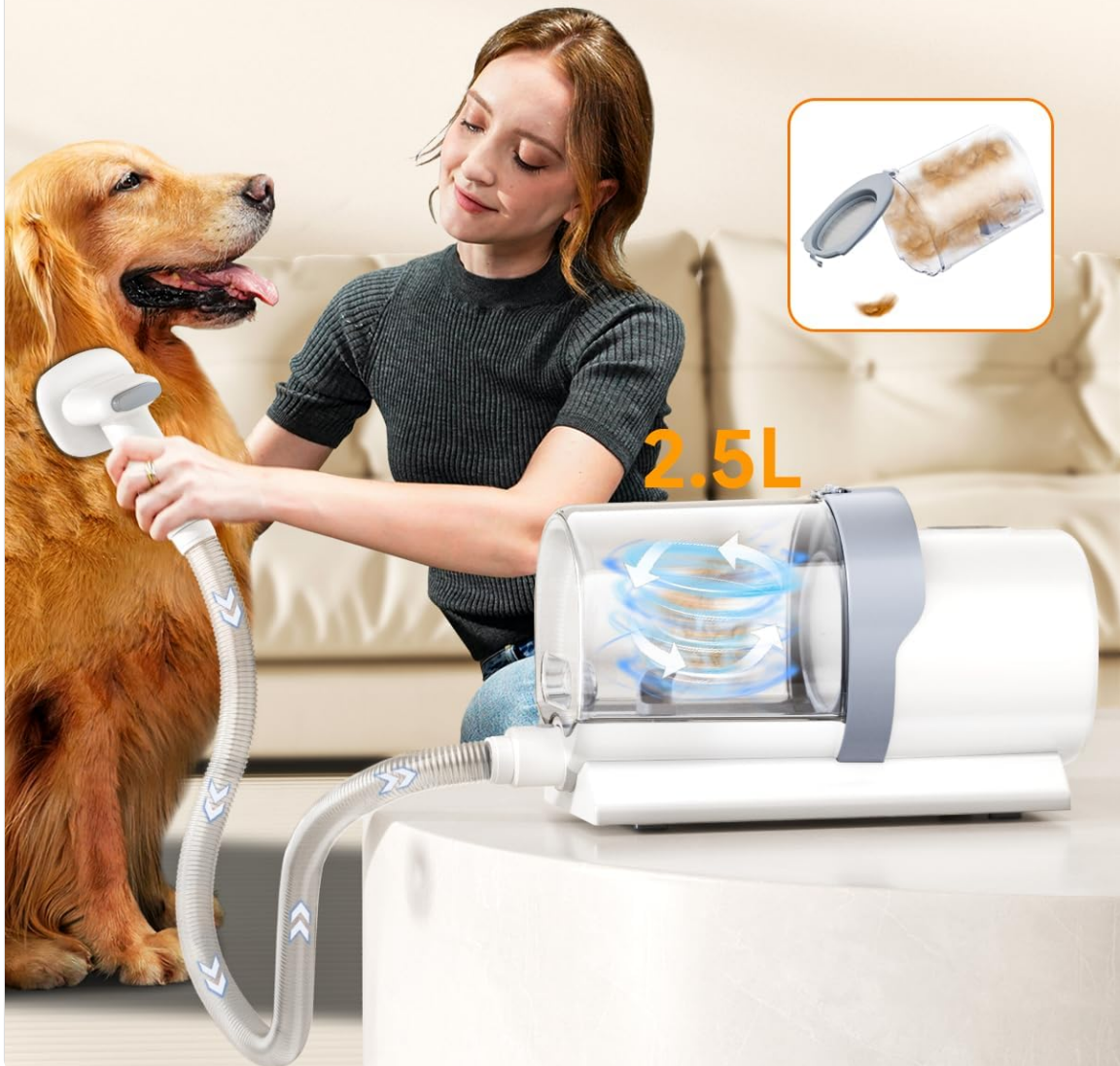
Figure 5: Large Capacity Dust Cup for Easy Maintenance.

The vacuum features a spacious 2.5L dust cup, designed for contact-free hair emptying, reducing the frequency of disposal during grooming sessions.