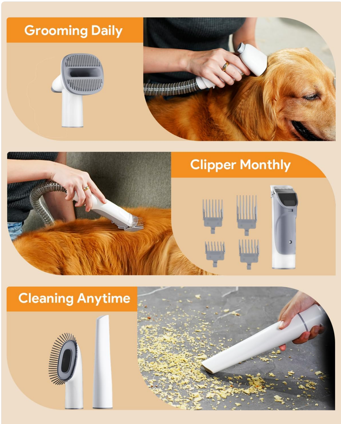
Figure 3: Versatile Tools for Comprehensive Pet Care.

The kit supports various grooming needs: daily brushing to remove loose hair, monthly clipping with adjustable