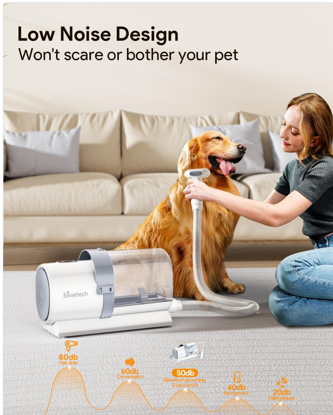
Figure 2: Low Noise Design for Pet Comfort.

The vacuum unit has a control panel with power and suction level buttons. Press the fan icon button to cycle through the three adjustable suction levels. For pets new to grooming vacuums, it is recommended to start with the lowest setting (below 50 dB) to help them acclimate to the sound and sensation.