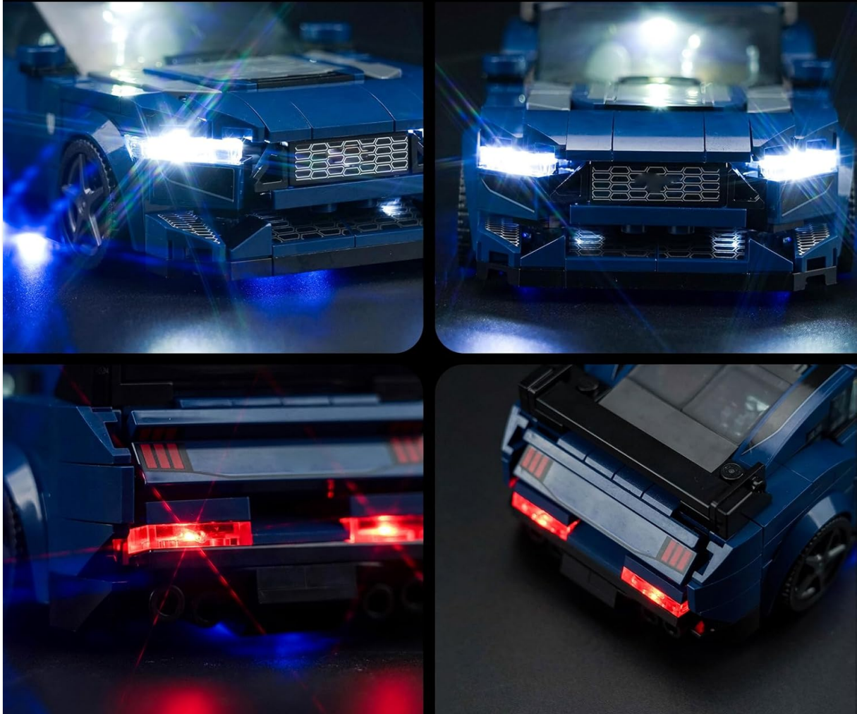
Image 2: Detailed view of the illuminated front and rear sections of the LEGO Ford Mustang model after light kit installation.

(Note: Only Light Kit Not Include The Lego Model)