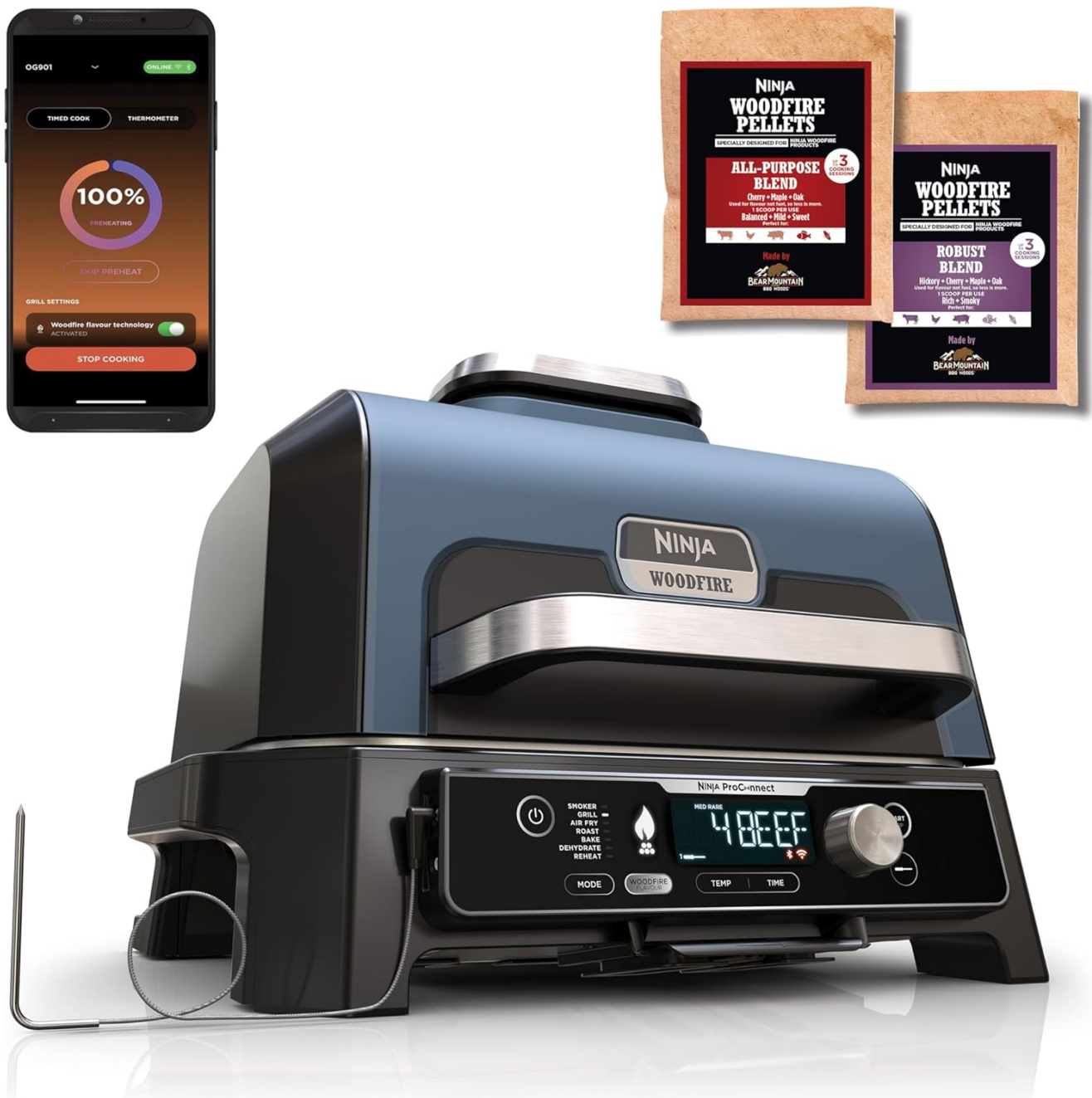
Figure 1.1: Ninja Woodfire Pro Connect XL with app control and wood pellets.

The large cooking capacity allows for preparing meals for a crowd, accommodating up to 10 hamburgers, 6 steaks, or 2 whole 3 kg chickens.