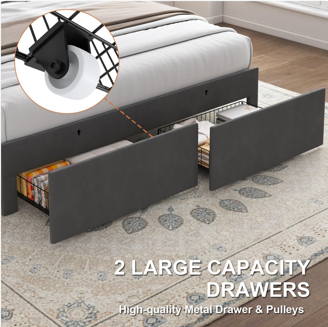
Figure 4.4: Storage Drawers. This image illustrates the two spacious under-bed drawers, designed for convenient storage of various items.