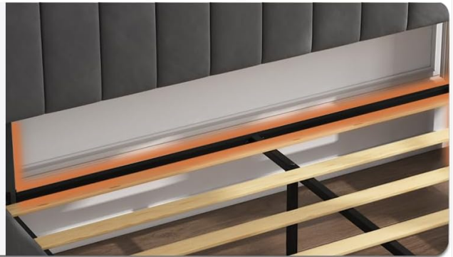
Figure 3.2: Sturdy Frame Construction. This image details the robust metal frame and the arrangement of the high-quality wood slats, designed for stability and durability.