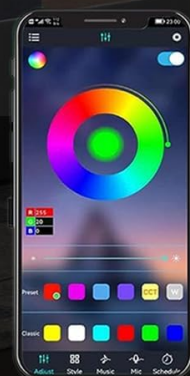
Figure 4.1: LED Light Features. This image displays the various control options and lighting modes available for the headboard's LED strip, including remote and app control.