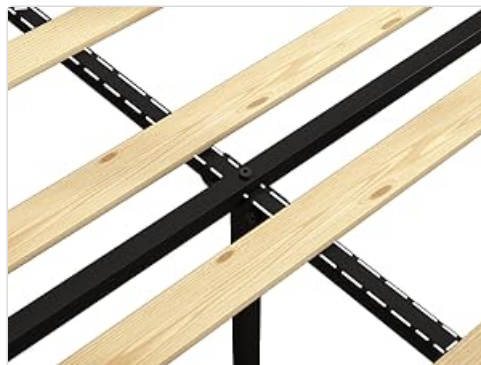
Figure 3.3: Slat Attachment Detail. This close-up shows the secure method of attaching the wood slats to the bed frame, ensuring a stable mattress foundation.