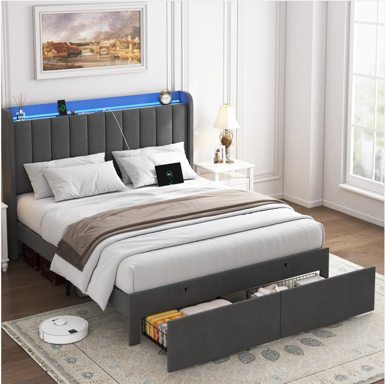
Figure 9.1: TIGUBFRE Queen Size Bed Frame. This image provides an overall view of the assembled bed frame, showcasing its dark grey upholstered finish, LED-lit storage headboard, and integrated under-bed drawers.