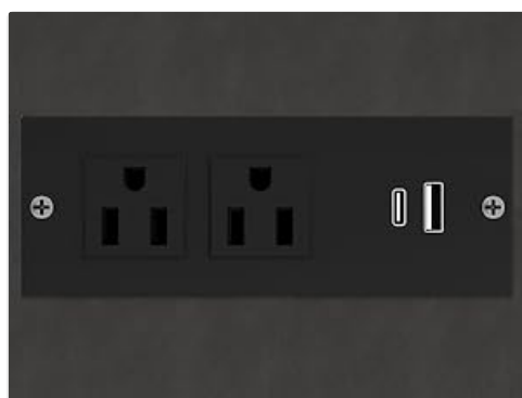
Figure 4.3: Power Outlet and USB Ports. A closer look at the integrated power and USB ports for device charging.