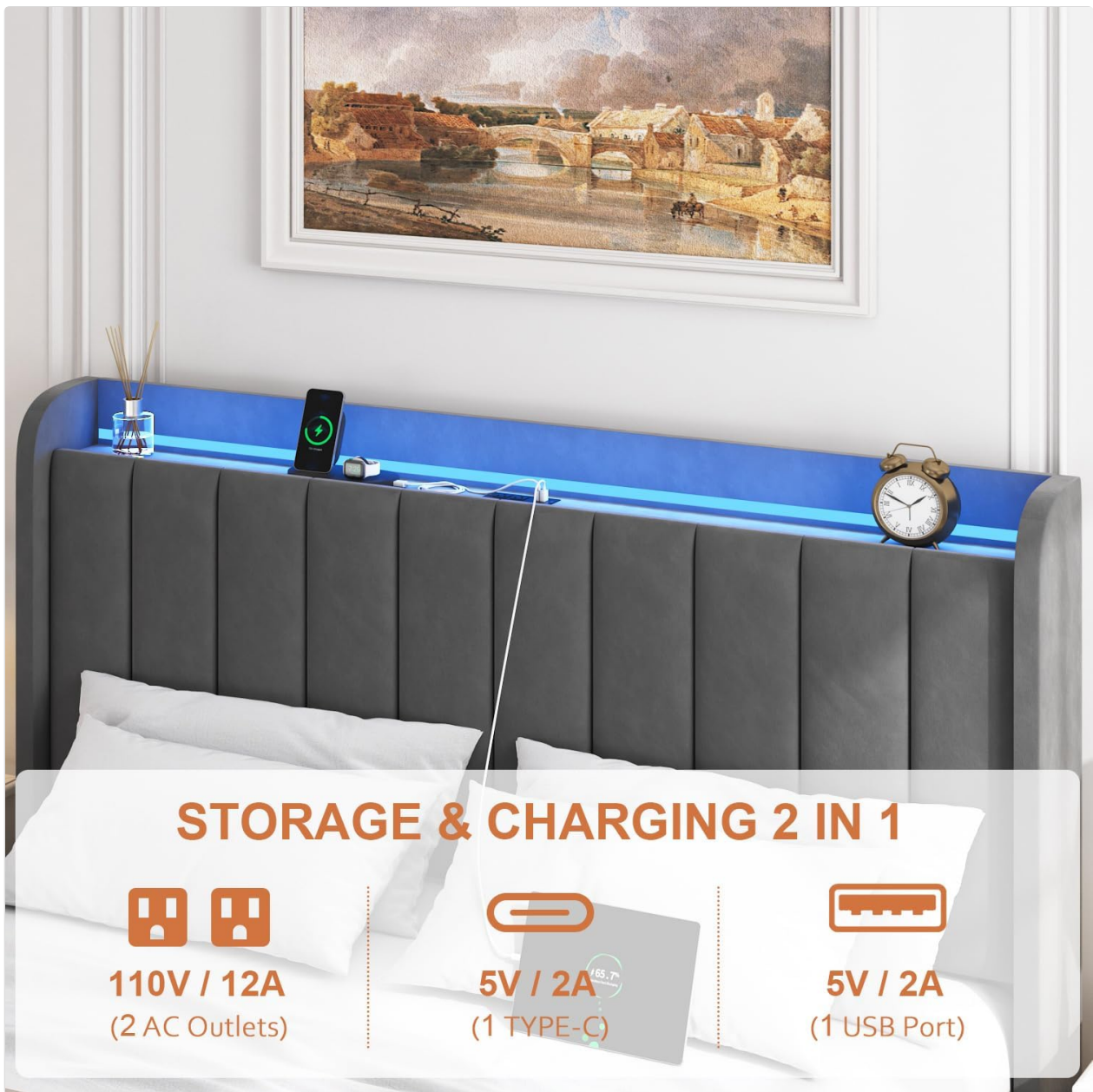
Figure 4.2: Charging Station Details. This image provides a detailed view of the charging station, showing the two AC outlets, one USB port, and one Type-C port.