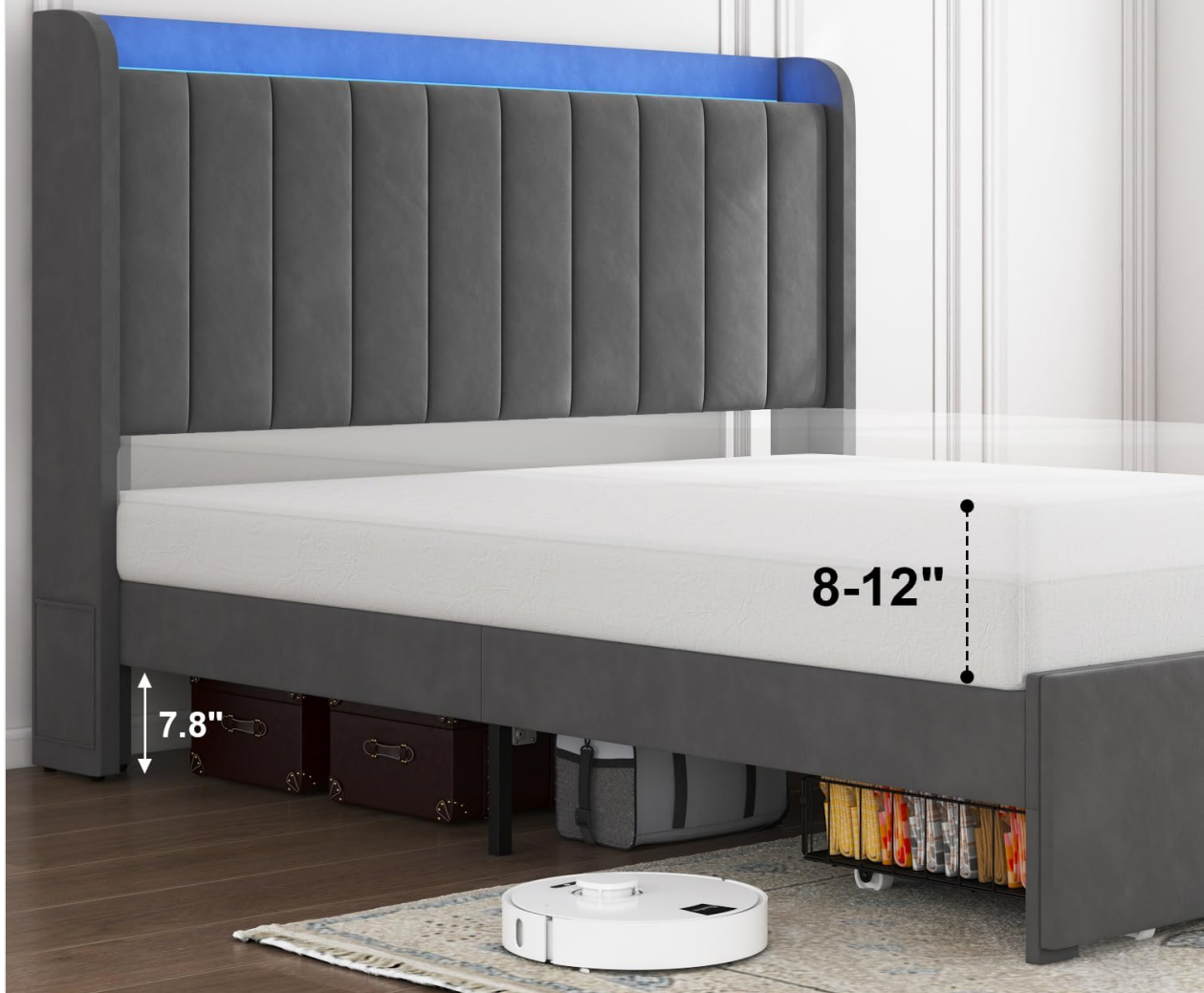
Figure 4.5: Under-Bed Storage and Clearance. This image highlights the 7.8-inch under-bed clearance, suitable for storage and robotic vacuum access, and confirms that no box spring is needed.

EXCEPTIONAL 7.8" UNDER-BED STORAGE SPACE