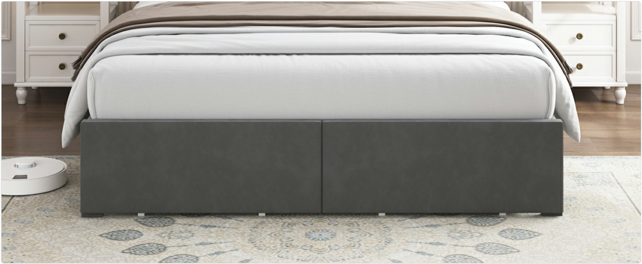
Figure 3.1: Assembly Overview. This image provides a visual guide to the bed frame's structure and indicates an estimated assembly time of 30 minutes.