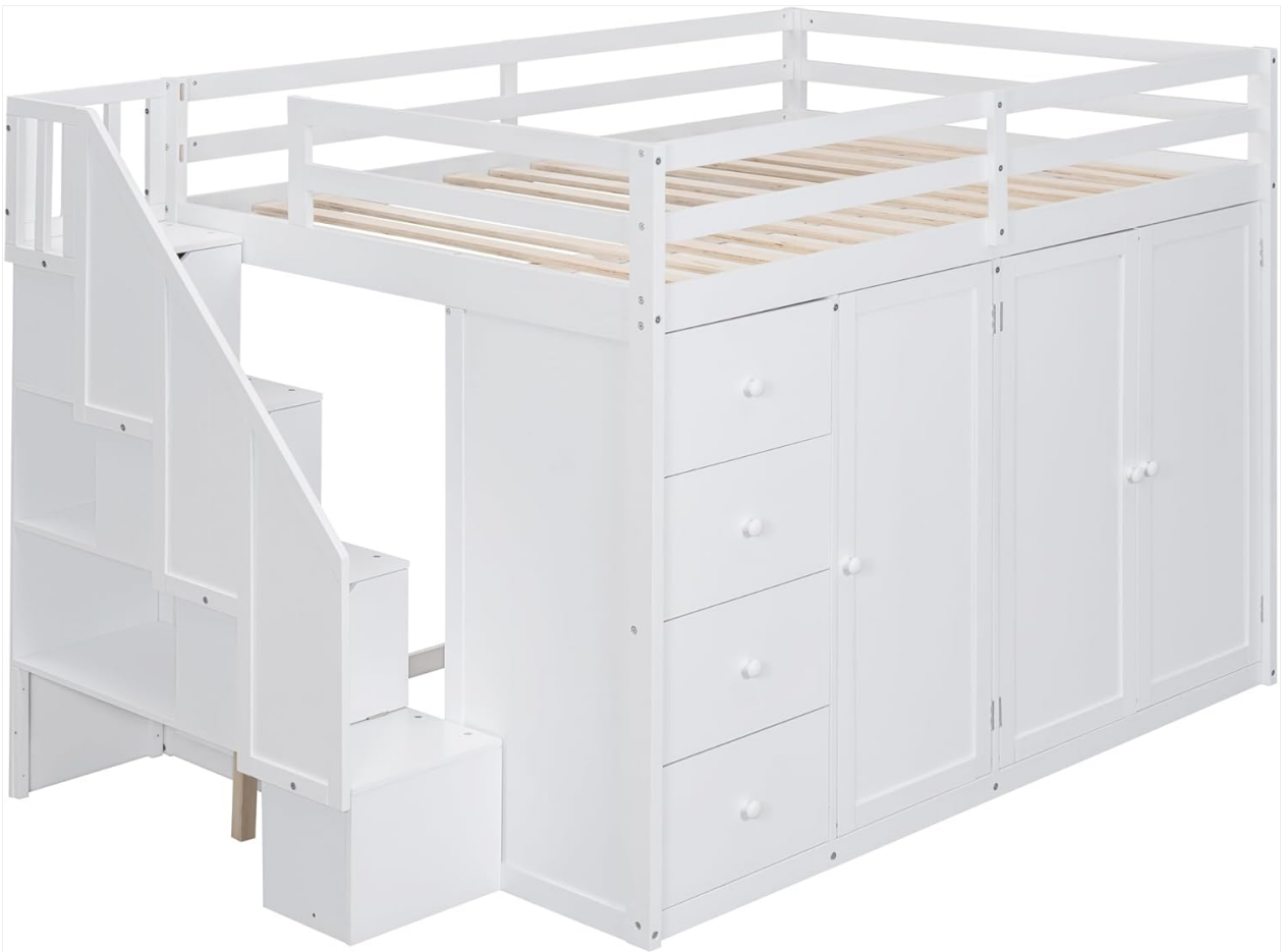
Image: A side view of the Merax Full Size Loft Bed, highlighting the integrated staircase with storage compartments and the overall structure.