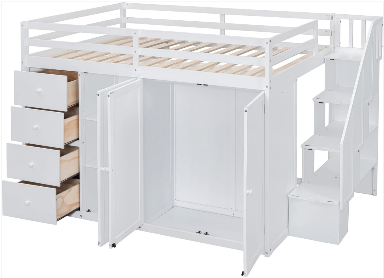
Image: A detailed view of the Merax Full Size Loft Bed with its four drawers pulled out and wardrobe doors open, demonstrating the storage capacity.