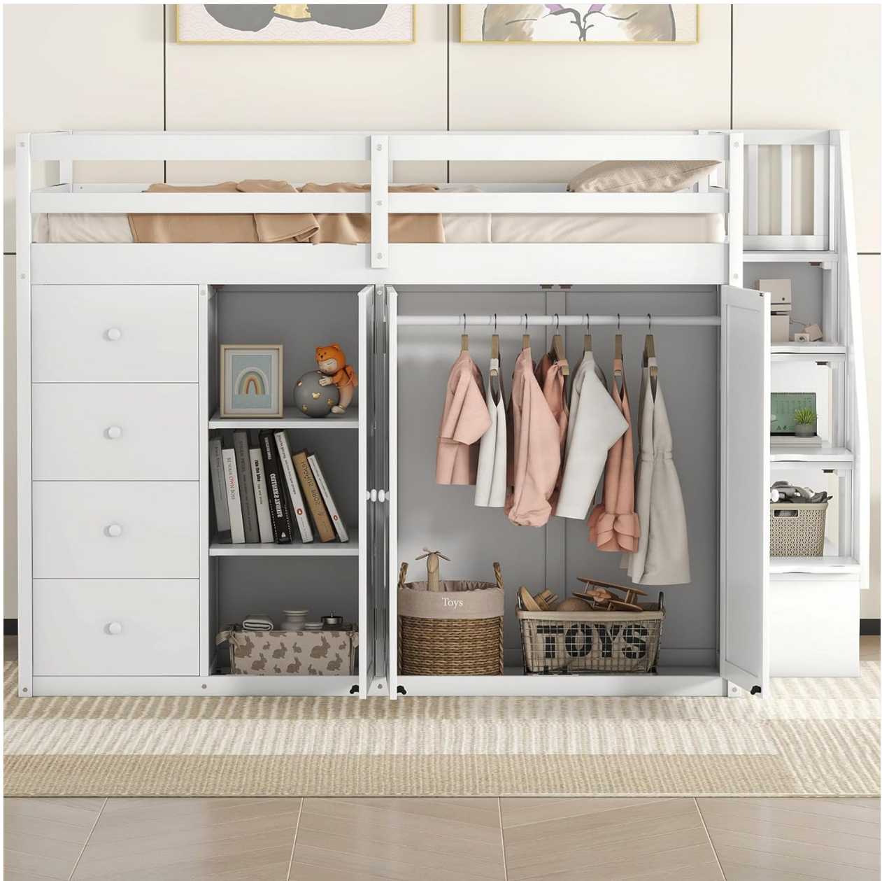
Image: The Merax Full Size Loft Bed showcasing its various storage options, including open shelves, drawers, and a wardrobe with clothes hanging inside.