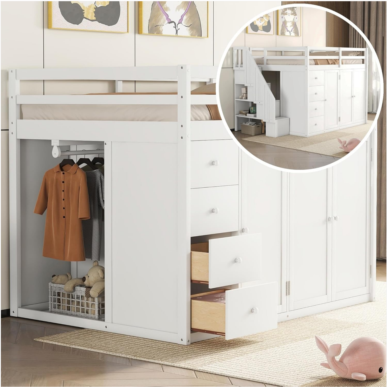
Image: The Merax Full Size Loft Bed with its wardrobe doors open and drawers extended, illustrating the integrated storage features.