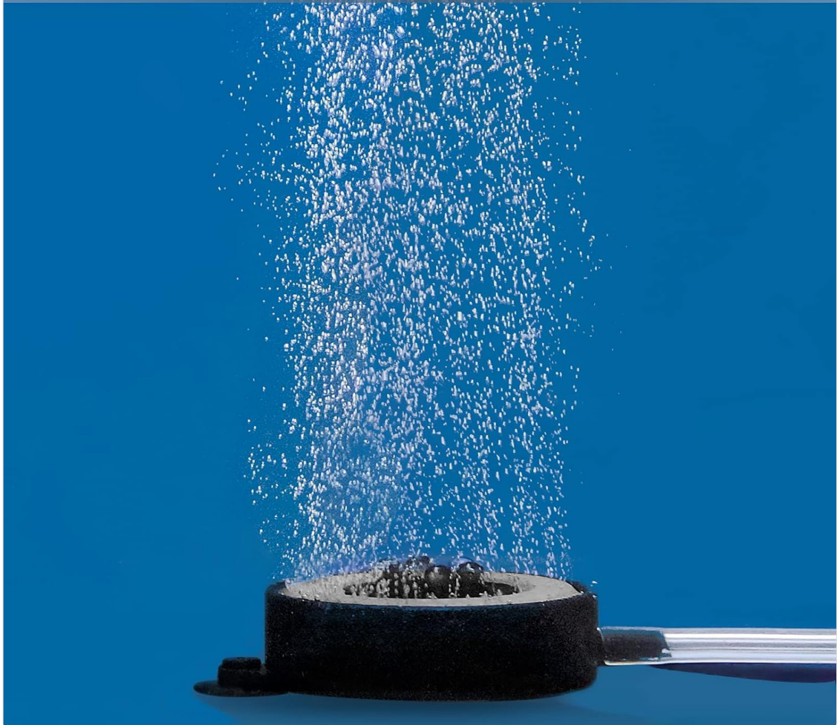
Figure 4: Micro bubbles for enhanced oxygenation.

INCREASING OXYGEN AND ADD VITALITY TO YOUR TEDIOUS TANK