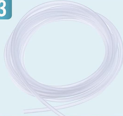
6 ft. Airline Tubing