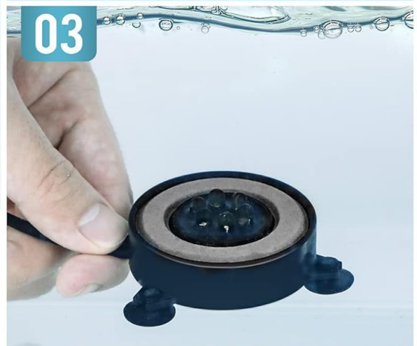
Figure 2: Securing the air stone disc with suction cups.