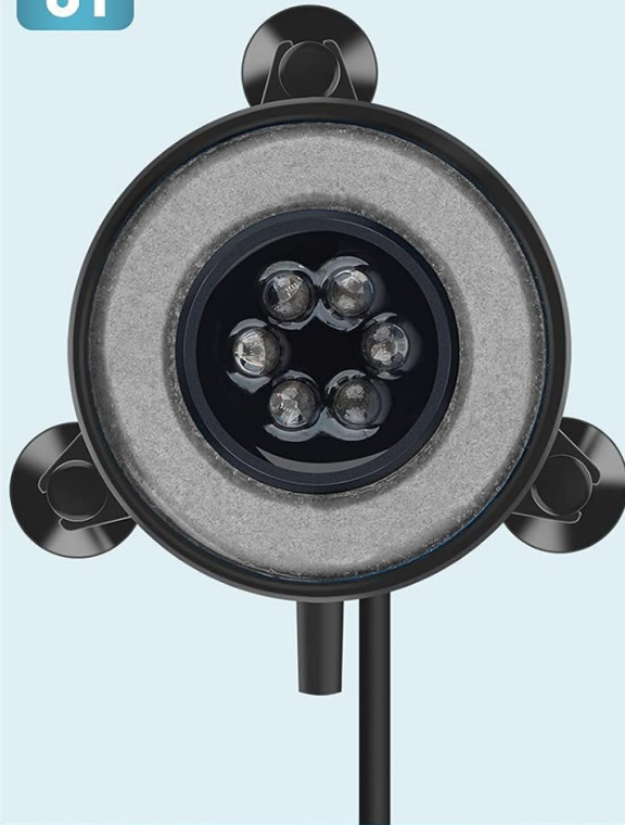
Multicolored air stone disc