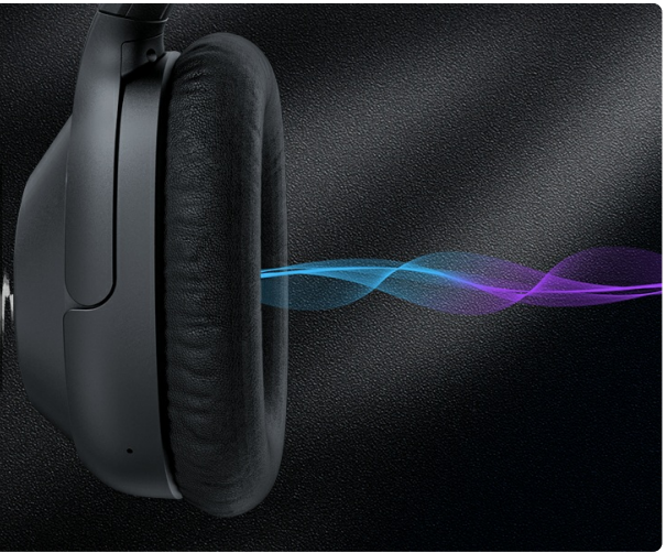
Image: The Ankbit E500Pro headphones with an overlay illustrating the 3 Mics Active Noise Cancellation Technology, designed to deliver high-definition sound by reducing ambient noise.

Delivers you a high-definition sound for an enhanced music listening experience