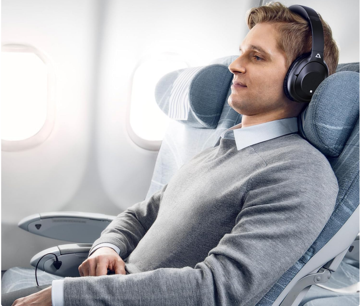
Image: The Anker E500Pro headphones in black, showcasing their sleek over-ear design and accessible controls on the earcups.

Hybrid Active Noise Cancellation - reduce ambient noise