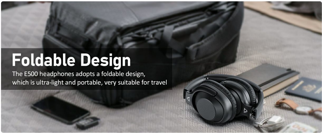
Image: The Ankbit E500Pro headphones in their compact, foldable design, positioned next to travel essentials like a bag and notebook, highlighting their portability.

The E500 headphones adopts a foldable design, which is ultra-light and portable, very suitable for travel