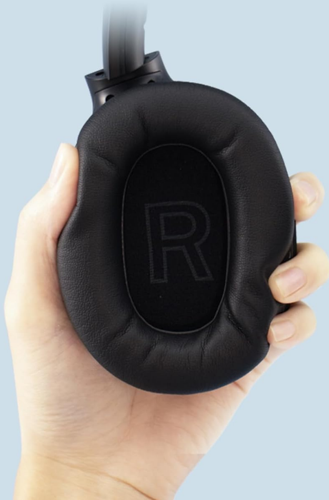
Image: A close-up view of the soft, memory foam earcups of the Ankit E500Pro headphones, emphasizing their comfort and pressure-free design.

Memory foam ear cups and ergonomic design, wear it all day without discomfort