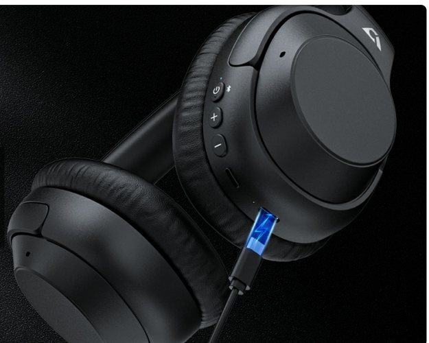
Image: The Ankbit E500Pro headphones connected via a USB-C cable, illustrating the fast charging feature that provides 4 hours of music experience from a 5-minute charge.

5 minutes of charging can enjoy 4 hours of music experience, and it only takes 1.5 hours to fully charge