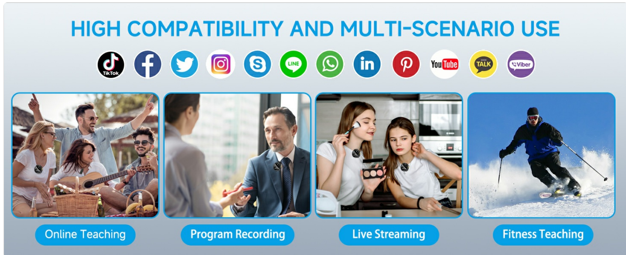
Image: A person wearing the Caiord J6 microphone with an attached windscreen, illustrating its use for clear recording in windy conditions.

For outdoor recording or in windy environments, attach the provided windscreens to the microphones to minimize wind noise and ensure clear audio capture.