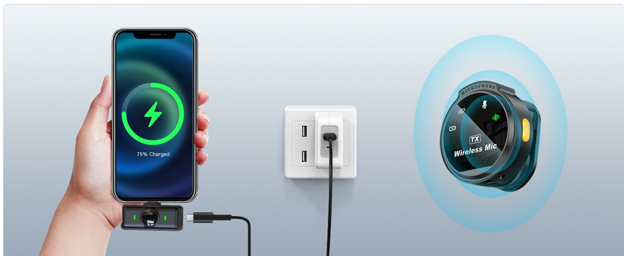
Image: The charging case displaying battery life and the microphones inside, indicating their charging status.

Before first use, ensure both transmitters (TX) and the charging case are fully charged. Connect the provided USB-C charging cable to the charging case and a power source. The charging case features a built-in rechargeable battery, offering up to 42 hours of extended usage for the microphones.