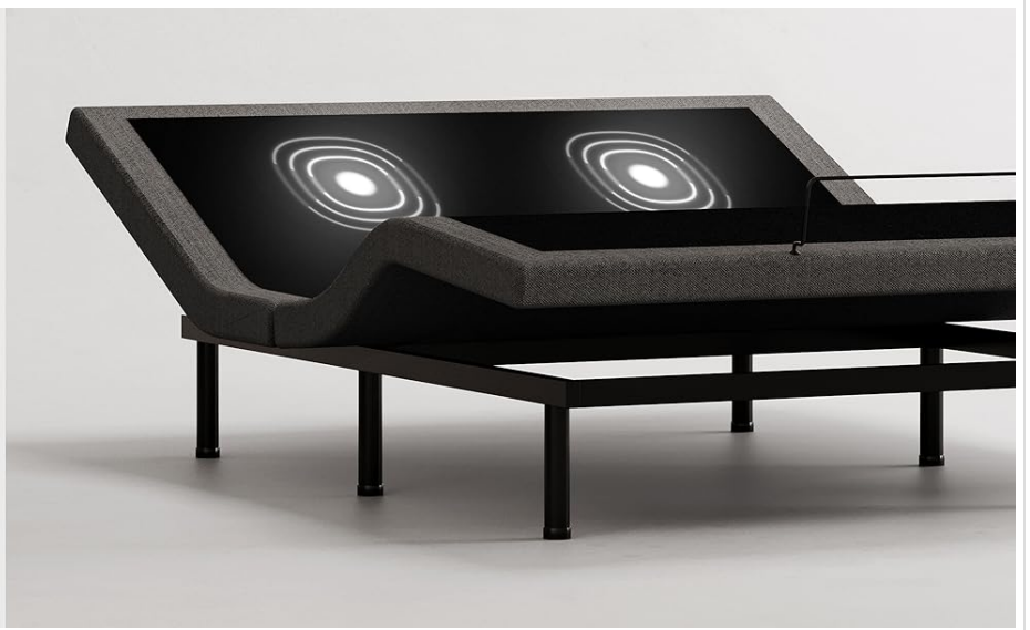
Figure 3: Overview of Base Features.

Whisper quiet vibrations melt daily stress with three different intensities.