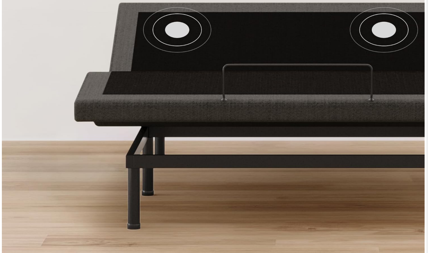
Figure 5: Customizable Comfort and Zero Gravity Setting.

Elevate your head or feet and turn down the pressure with the Zero Gravity setting.