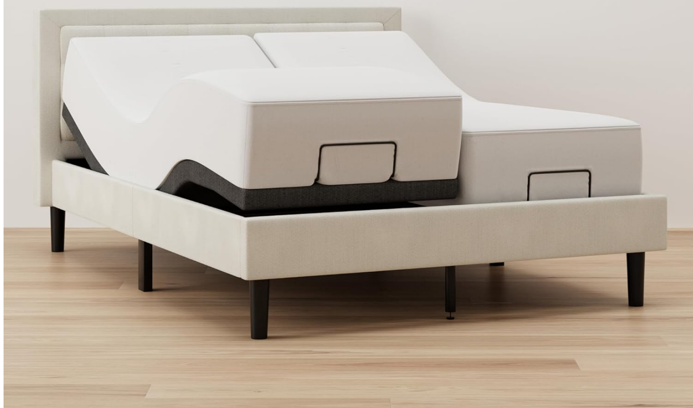
Figure 6: Split King Configuration (shown with Twin XL bases).

Our Split King size allows you to individually control each sleeper's position separately with two Twin XL mattresses. Adjust each side however you like.