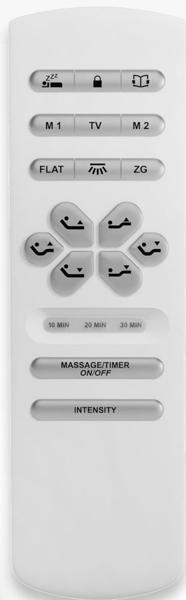
Figure 2: Wireless Remote Control for the Adjustable Base.