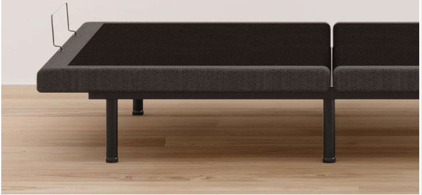
Figure 1: Quick and Hassle-Free Setup of the Adjustable Base.