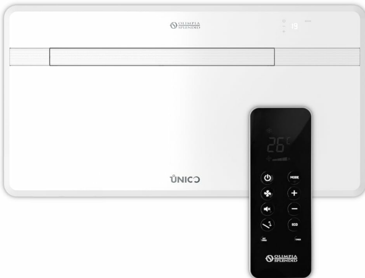
Image Description: Front view of the Olimpia Splendid UNICO EVO 25 PVAN monobloc air conditioner, showing its sleek white design and the Olimpia Splendid logo.