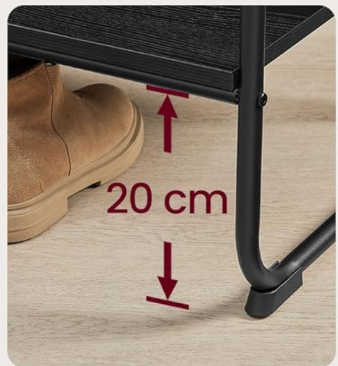
Image: Close-up details of the VASAGLE RGR116B02 garment rack, showing the removable hooks for accessories, the spacing between shelves, and the dedicated shoe storage area with a 20 cm clearance.