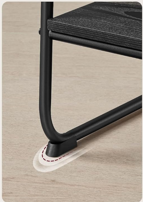
Image: Close-up details of the VASAGLE RGR116B02 garment rack, highlighting the X-bars at the back for stability and the design of the feet.