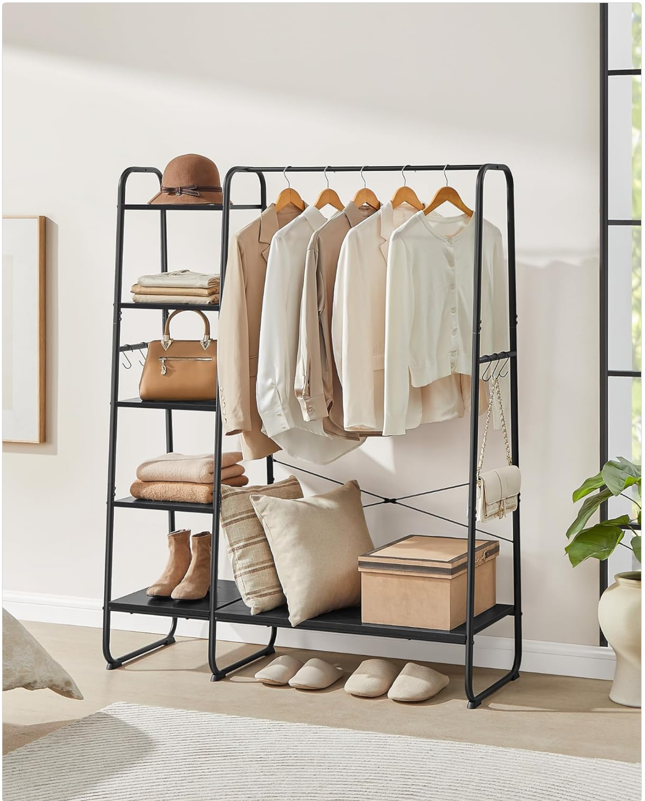
Image: A VASAGLE RGR116B02 garment rack in an ebony black and matte black finish, fully assembled and styled with various clothing items, bags, hats, and shoes, demonstrating its storage capabilities.