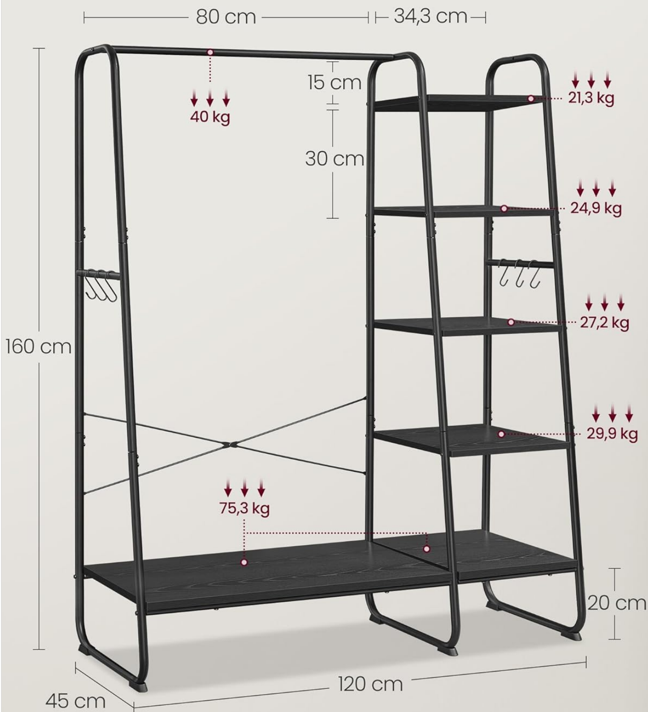
Image: A detailed diagram of the VASAGLE RGR116B02 garment rack showing all dimensions in centimeters and maximum load capacities in kilograms for the hanging rail, individual shelves, and hooks.