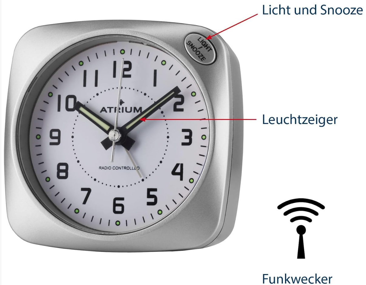
Figure 2: Front view of the alarm clock, showing the light/snooze button.