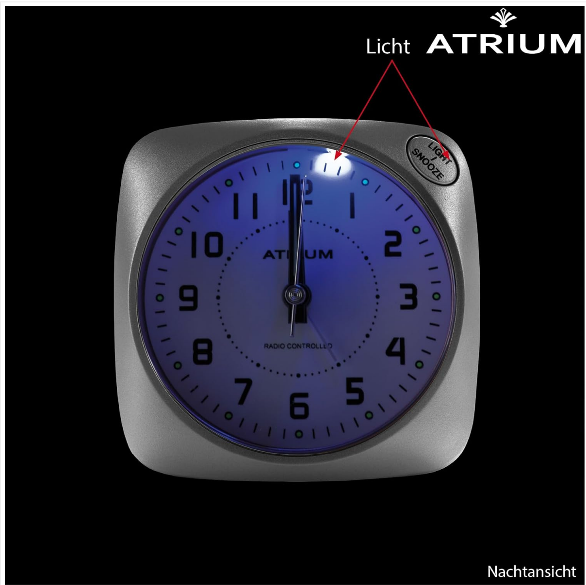
Figure 3: Night view of the alarm clock with the backlight activated.