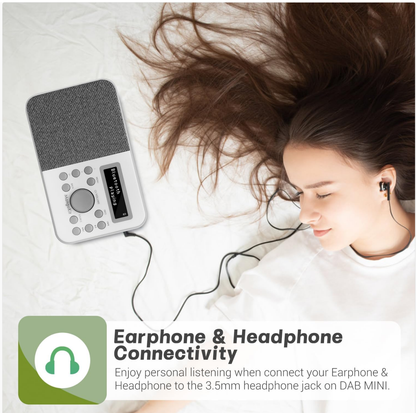
Figure 4.3: Headphone connectivity for personal listening.