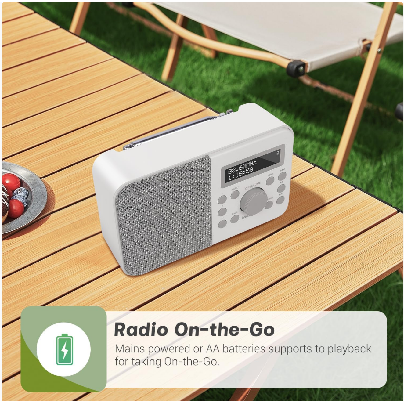
Figure 5.1: The radio can be powered by mains or AA batteries for portability.