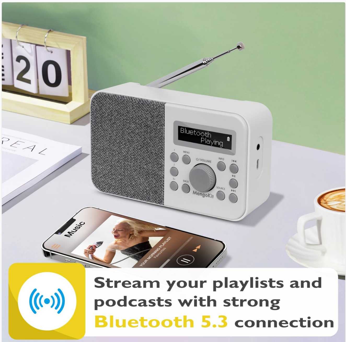
Figure 6.2: Bluetooth streaming from a mobile device.

Note: The MangoKit PR2S functions as a Bluetooth receiver only; it cannot transmit audio to Bluetooth headphones.