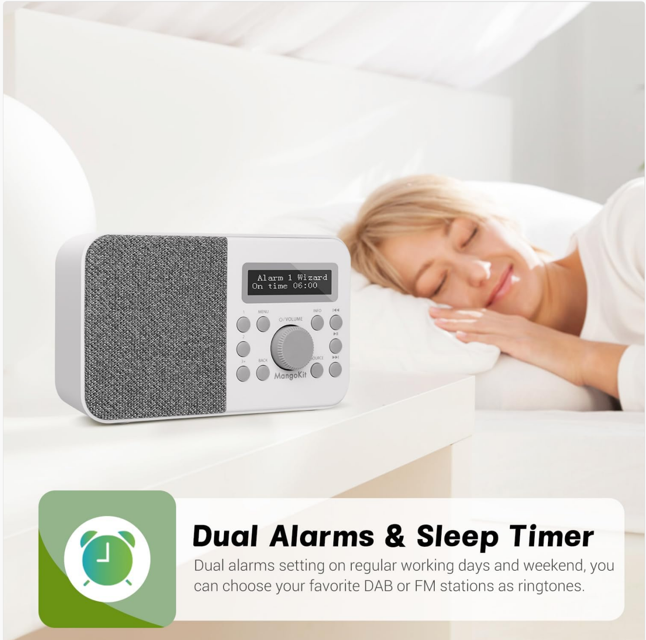
Figure 6.3: Setting dual alarms for your schedule.