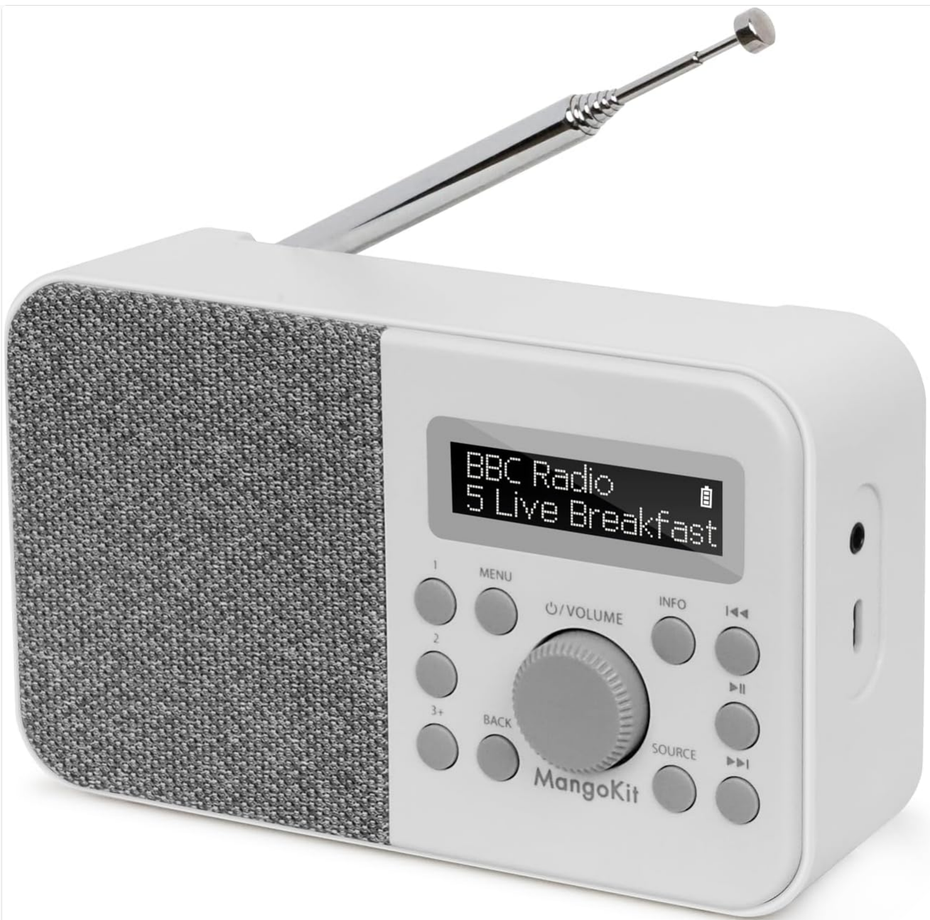
Figure 4.1: Front view of the MangoKit PR2S DAB Radio.