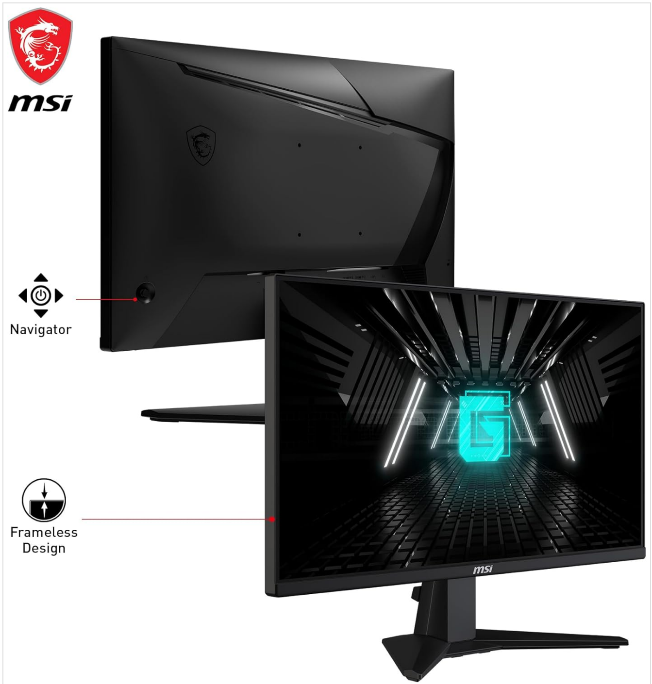
Image: MSI G255F monitor with its stand fully assembled.

Alternatively, the monitor supports VESA mounting (100x100mm) for wall or arm installation. Remove the stand neck if using a VESA mount.