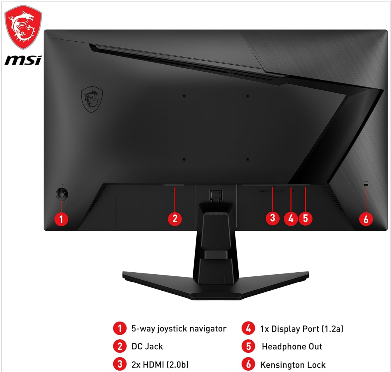
Image: Rear view of the MSI G255F monitor, showing the 5-way joystick navigator, DC Jack, 2x HDMI (2.0b) ports, 1x DisplayPort (1.2a), Headphone Out, and Kensington Lock.