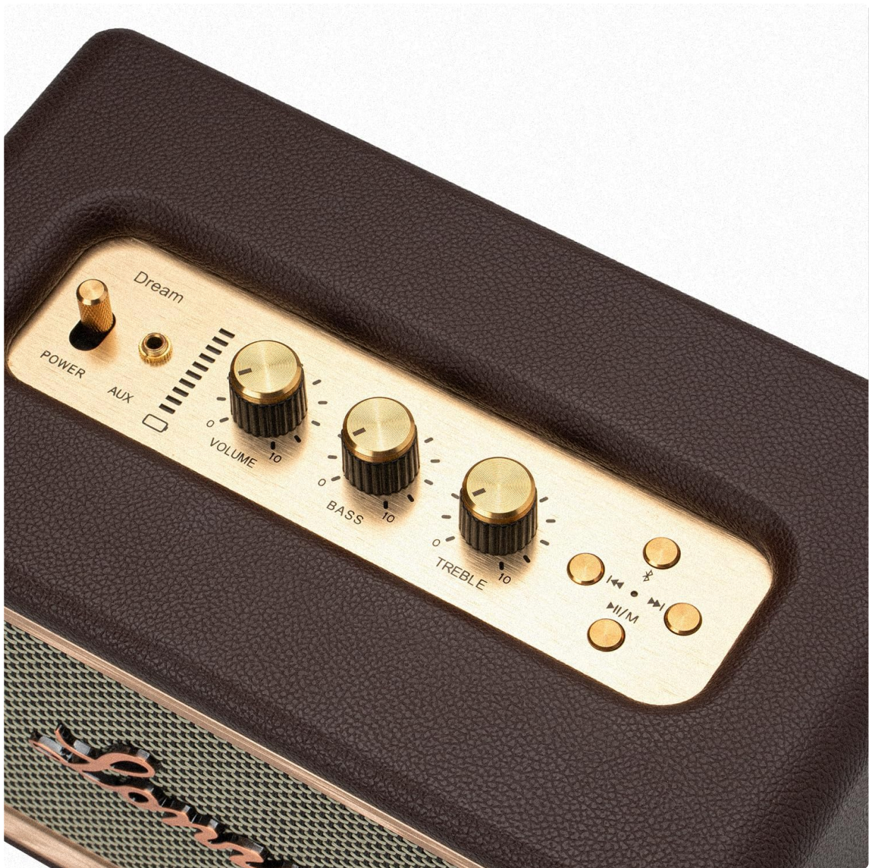
Image: Detailed view of the speaker's top control panel, featuring Power, AUX, Volume, Bass, Treble knobs, and playback buttons.