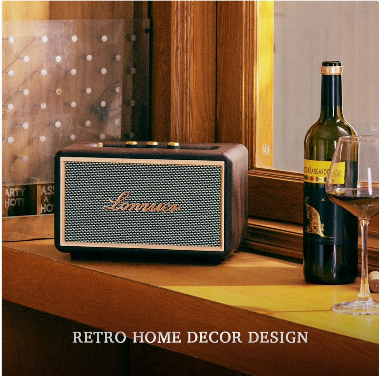
Image: Lonzuer Dream speaker showcasing its retro home decor design.

The Lonzuer Dream speaker features a vintage retro wooden design with leather wrapping, offering both aesthetic appeal and robust audio performance.