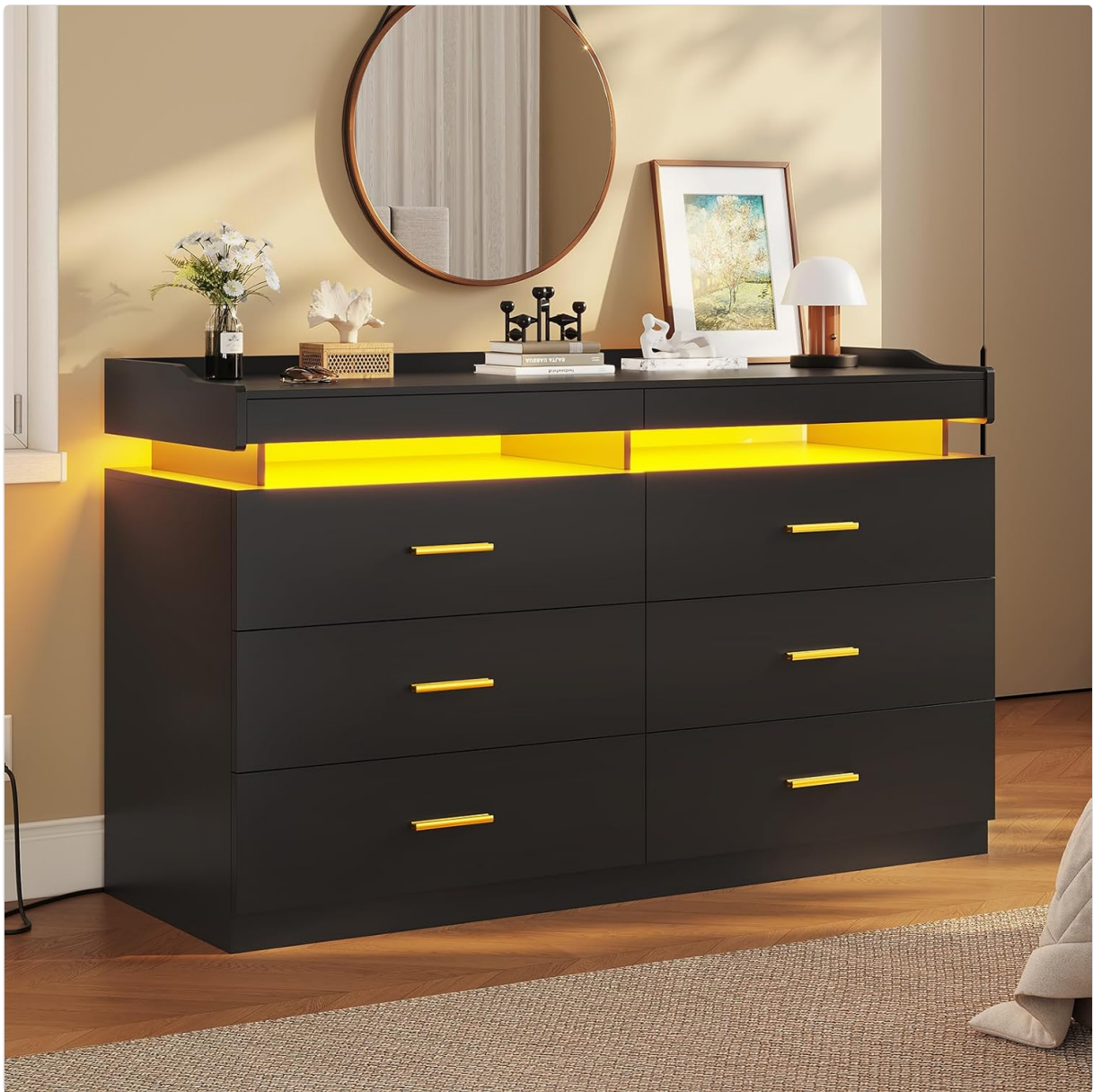
Image 1.1: The BTHFST LED Dresser featuring six drawers, two pull-out trays, and integrated LED lighting.