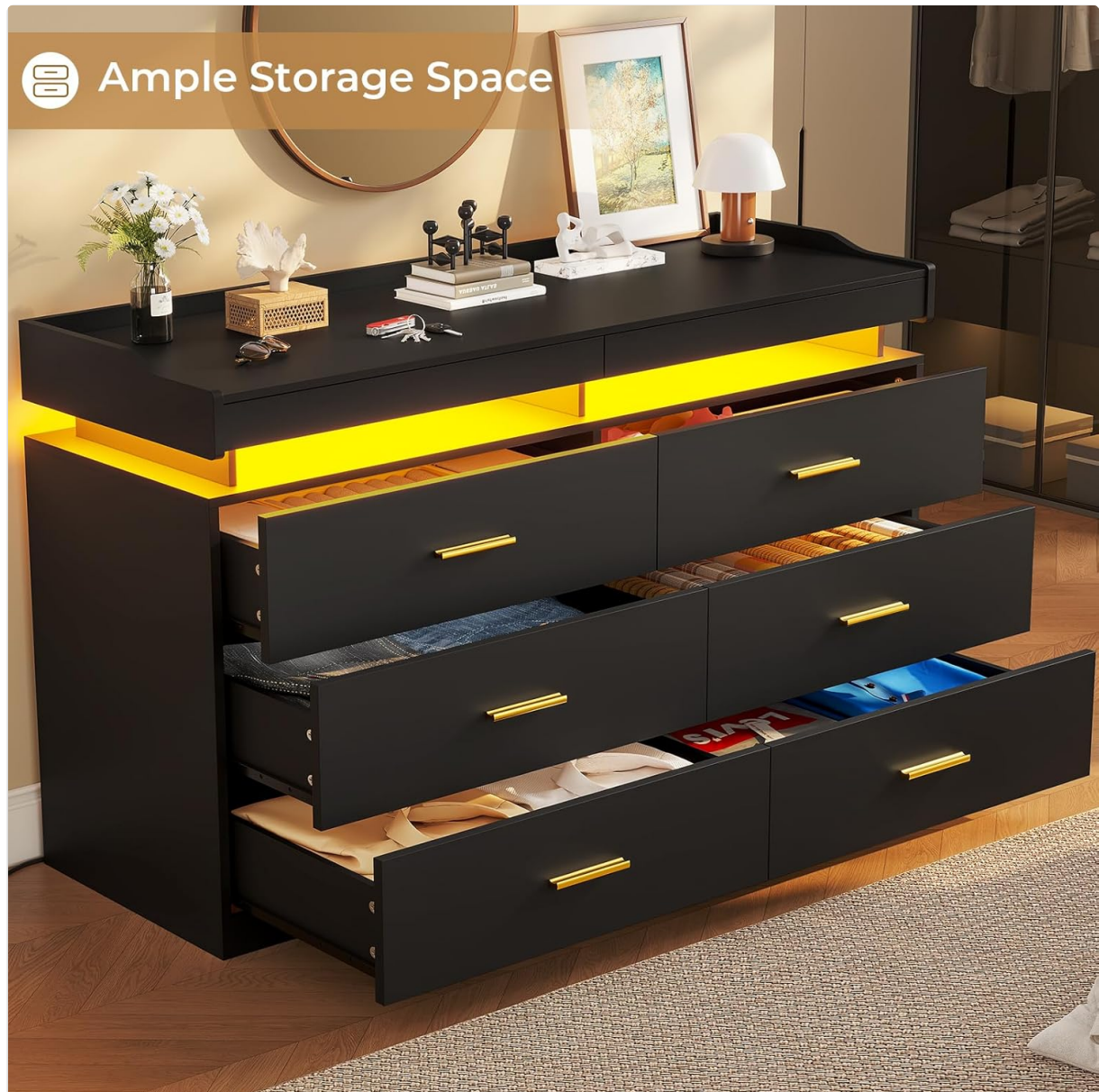
Image 3.5: The dresser with several drawers open, illustrating the generous storage capacity for clothing and other personal belongings.