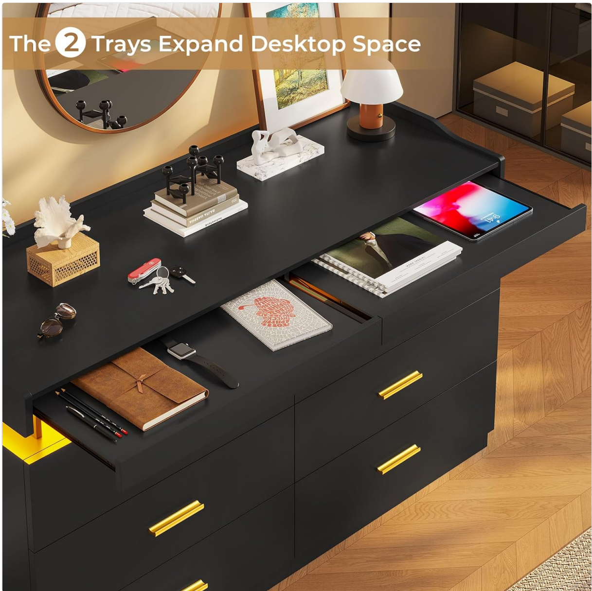
Image 3.3: The pull-out tray in an extended position, showcasing its utility for holding a tablet and other personal items, thereby expanding the available surface area.