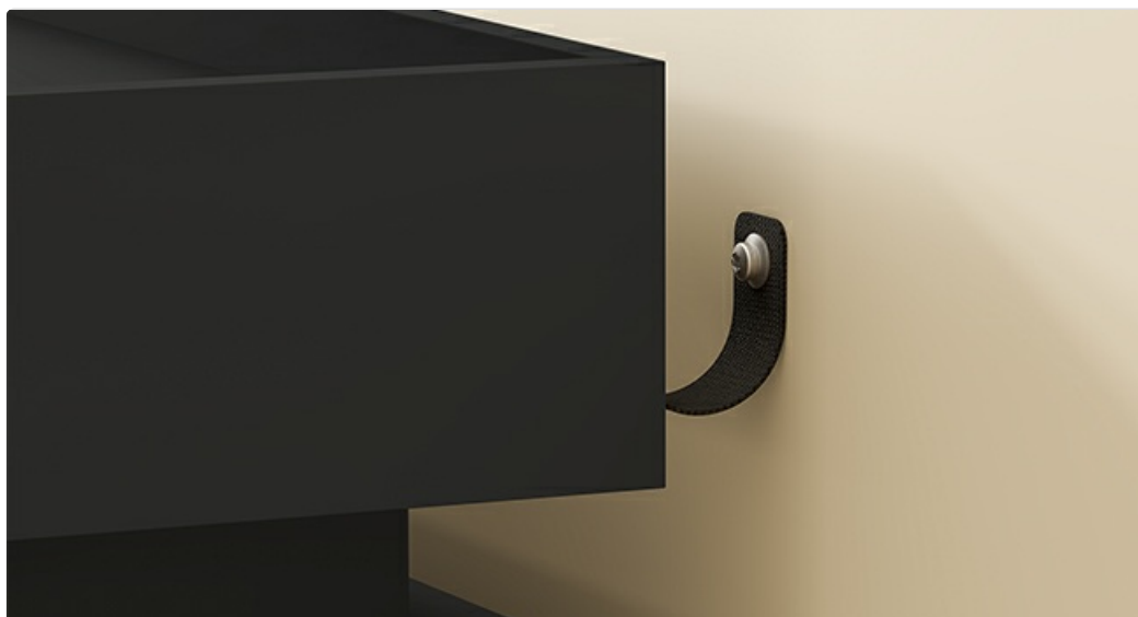
Image 2.2: A close-up view of the anti-tipping strap, showing how it connects the dresser to the wall for safety.