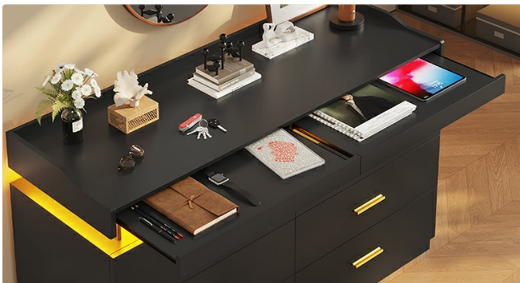
Image 3.4: A detailed view of the pull-out tray, demonstrating its capacity to organize small daily essentials.