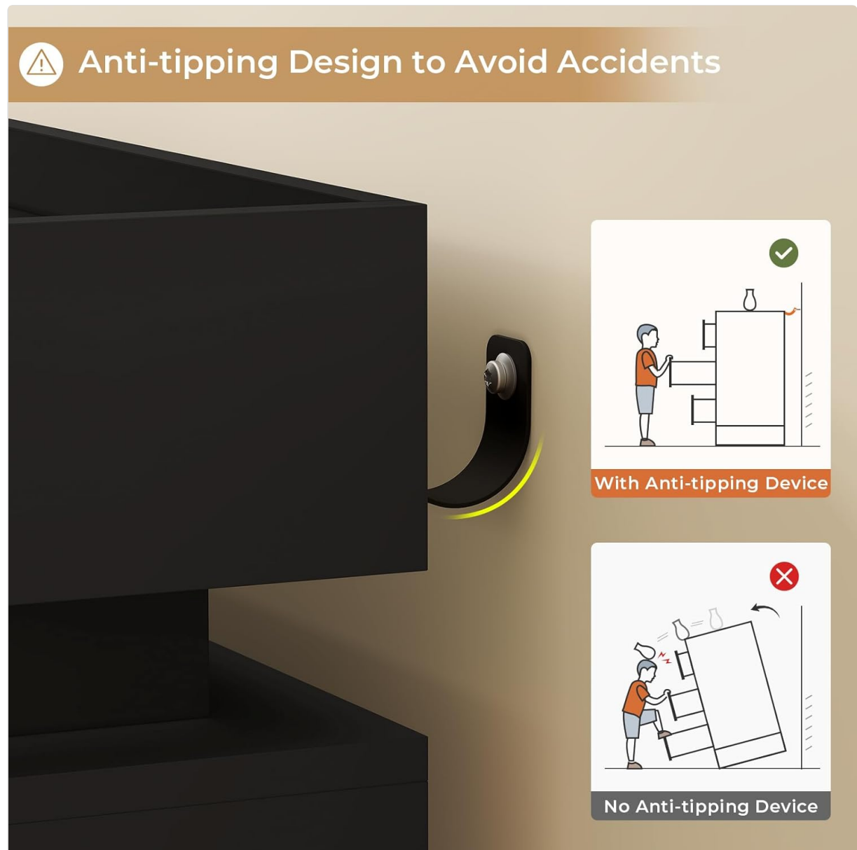
Image 2.1: Illustration of the anti-tipping device securing the dresser to a wall, demonstrating correct installation for enhanced stability.

For safety, it is crucial to install the anti-tipping devices. These devices secure the dresser to the wall, preventing accidental tipping, especially in households with children or pets.