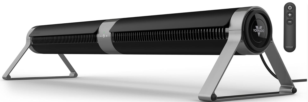
Image: The Vornado Airbar 6 in its horizontal configuration, showcasing its sleek design and accompanying remote control.

The Vornado Airbar 6 is a versatile air circulator designed to provide powerful and adaptable airflow for medium to large spaces. Unlike typical tower fans, the Airbar 6 offers both vertical and horizontal operation, allowing you to optimize air circulation based on your specific needs. Its innovative magnetic base system enables easy conversion between modes without the need for tools, ensuring a hassle-free experience. With intuitive touch controls and a convenient omnidirectional remote, you can effortlessly manage its three speed settings to create a comfortable environment.