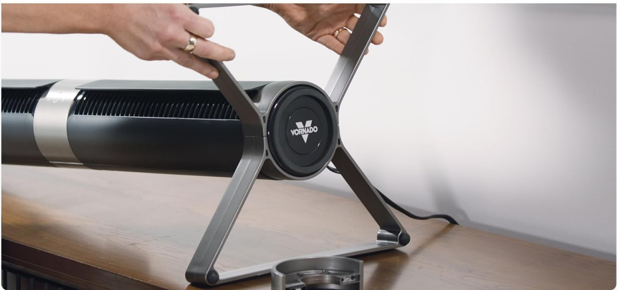
Image: Demonstrates the magnetic base system allowing easy conversion of the Airbar 6 from a vertical tower fan to a horizontal air circulator.