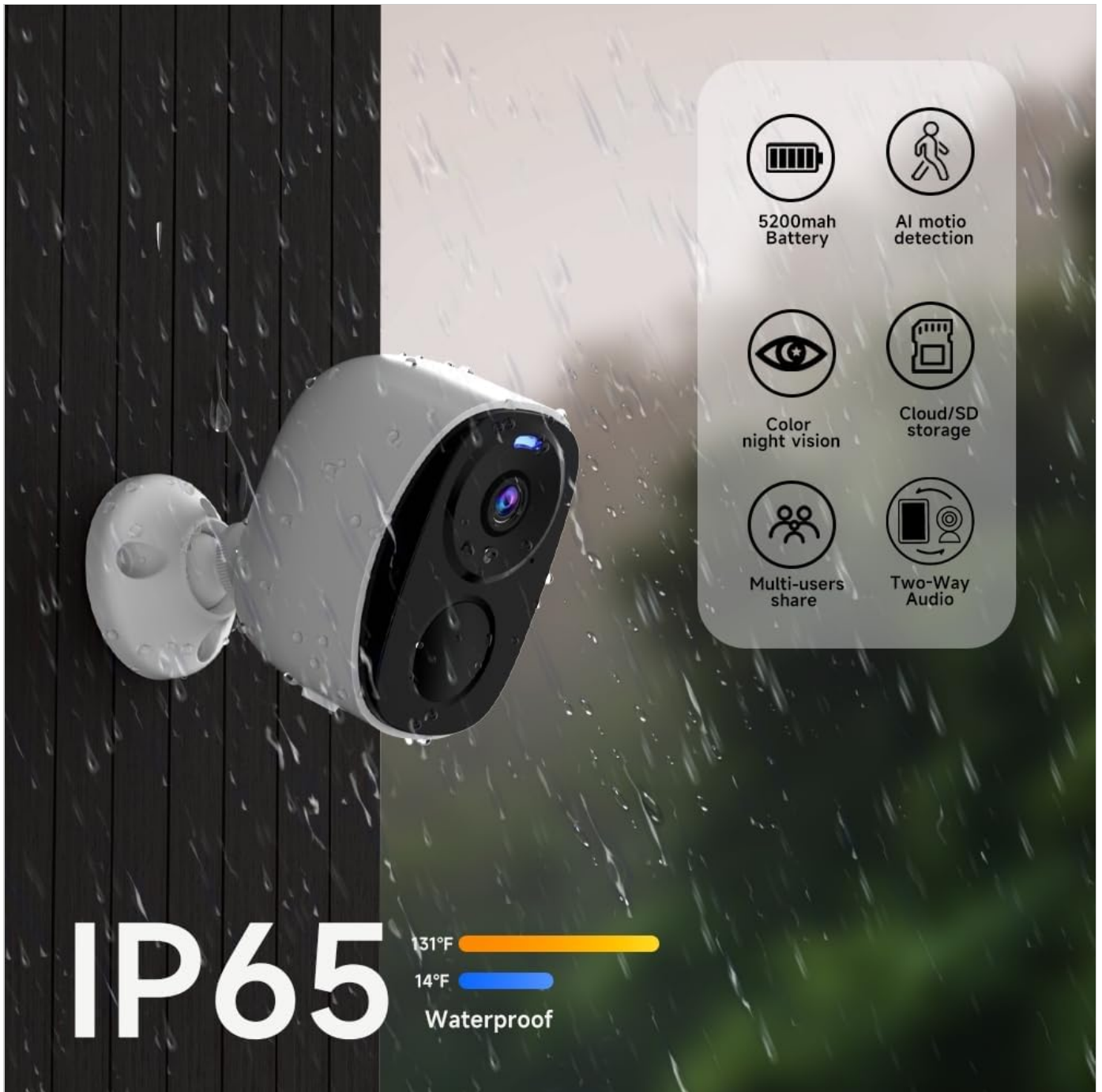
Image: This image highlights the flexible storage options of the Rraycom BW4 camera, including cloud storage and local storage via a microSD card.