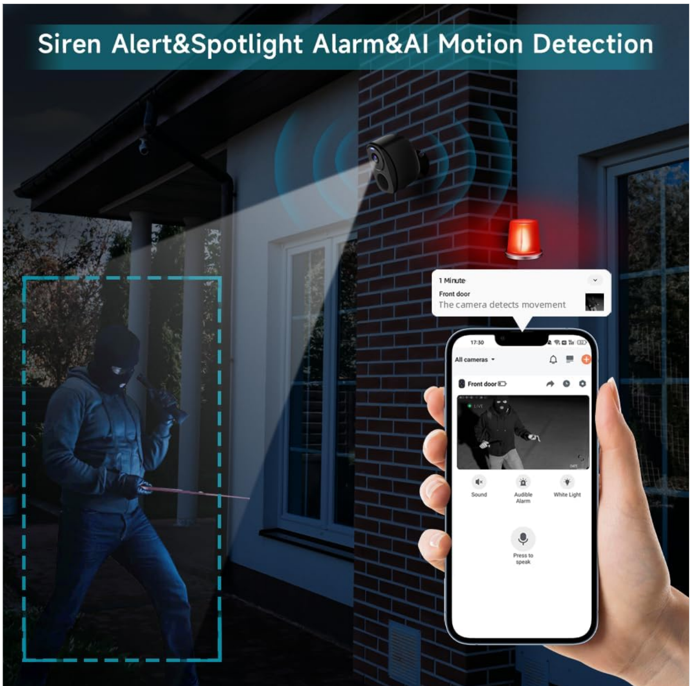
Image: This image demonstrates the siren and spotlight alarm features of the Rraycom BW4 camera, showing how it can deter intruders and send alerts to the user's phone.

Your browser does not support the video tag.