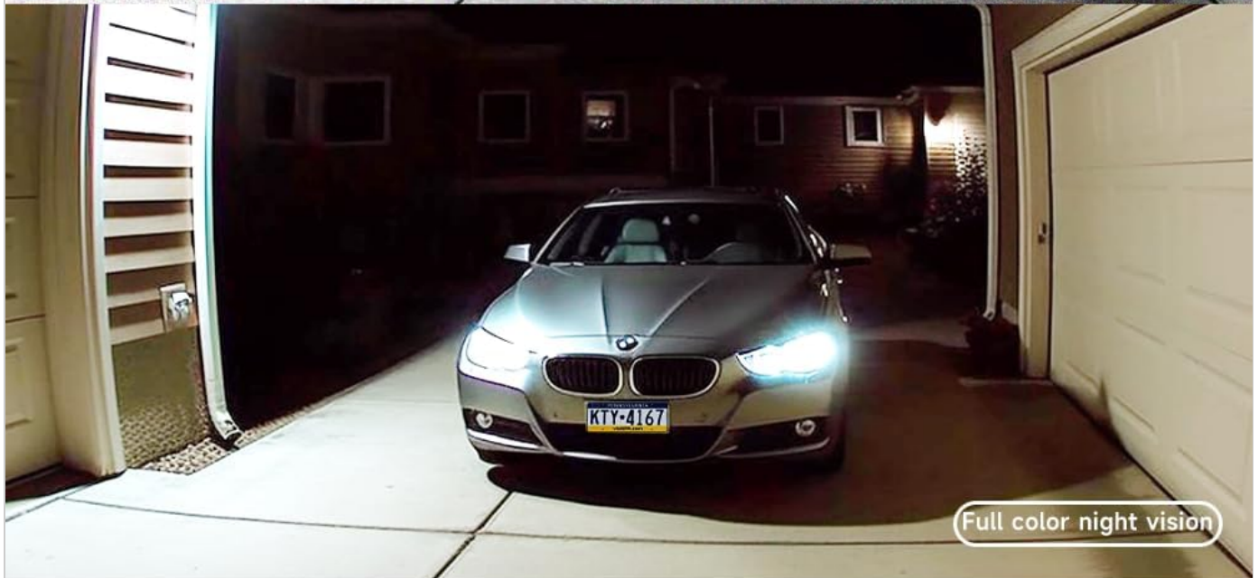
Image: This image visually compares the clarity and detail of 2K HD color night vision with standard black and white night vision, demonstrating the camera's superior low-light performance.