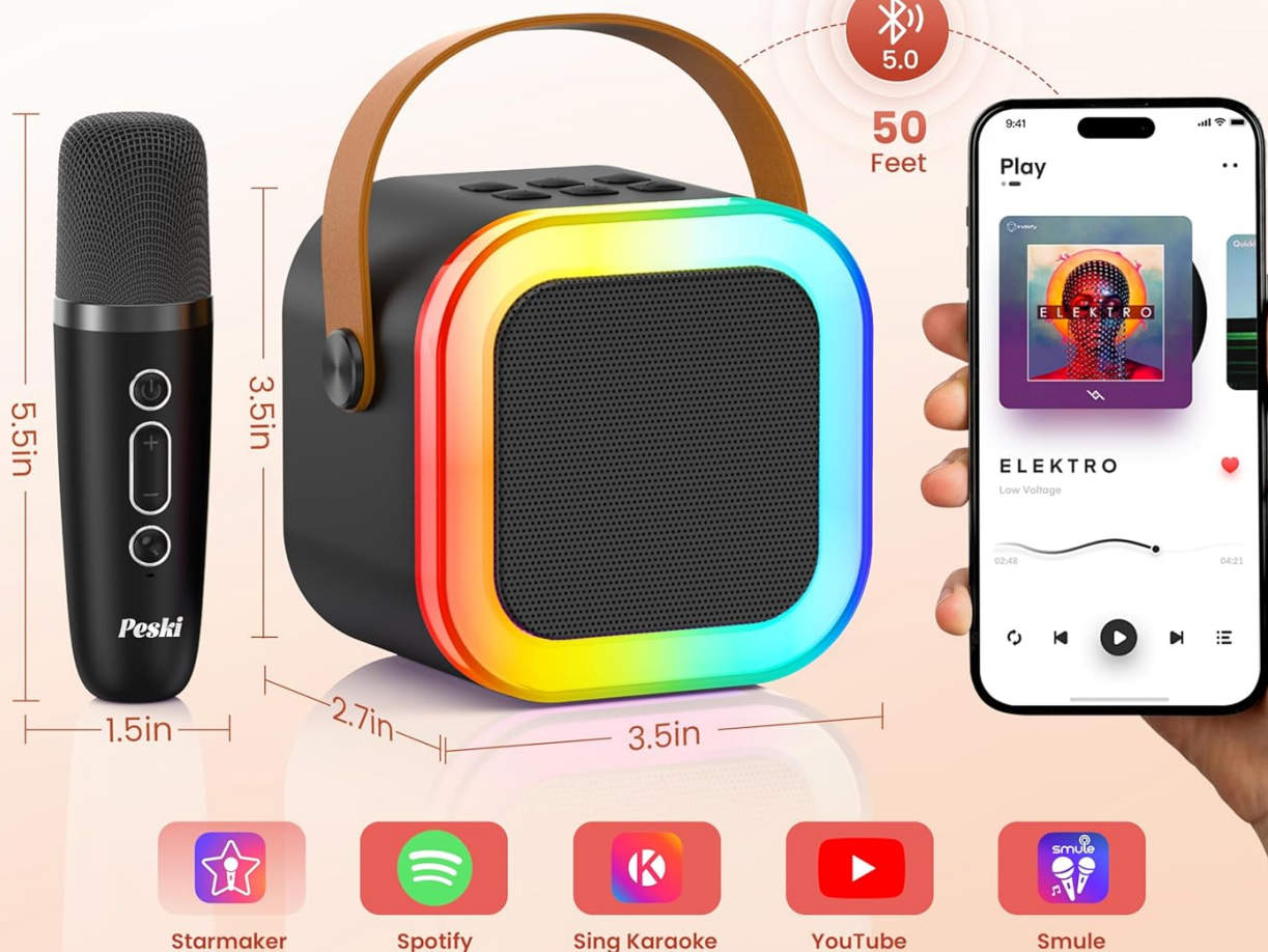
Image: Illustration of the speaker's Bluetooth 5.0 connectivity, showing a 50-foot wireless range and compatibility with various devices and music/karaoke applications like Starmaker, Spotify, Sing Karaoke, YouTube, and Smule.