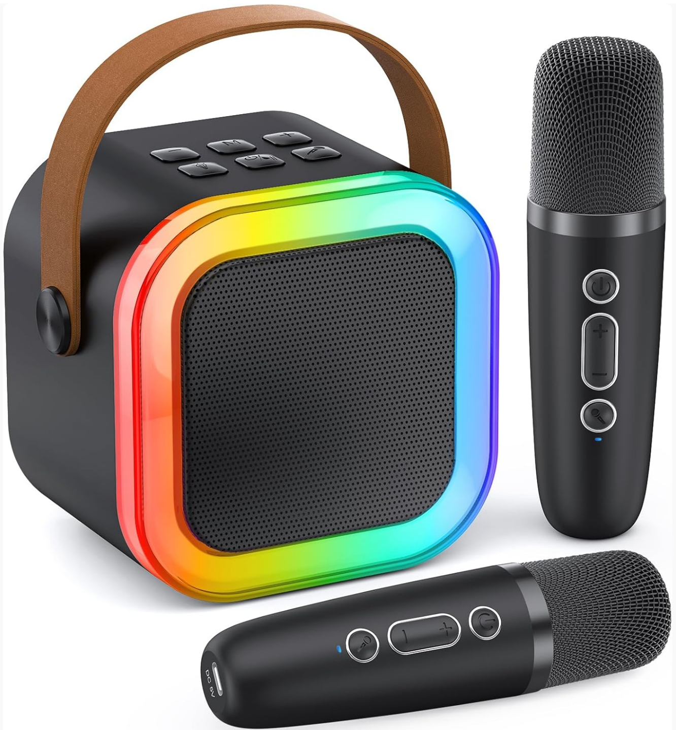
Image: The Peski Mini Karaoke Machine speaker, showcasing its compact design and vibrant LED light ring.

The main unit features a professional tuning grade speaker with subwoofers and tweeters for clear, powerful stereo sound. It includes a dynamic colorful LED light show that can sync with your music.