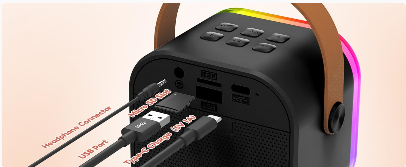
Image: Diagram illustrating the various input and output ports on the back of the speaker unit, including USB, Micro SD, Headphone, and Type-C charging port.

The speaker features intuitive controls for volume, play mode, echo, power, and lights. It also includes multiple input options: TF card slot, USB port, AUX input, and a Type-C charging port.