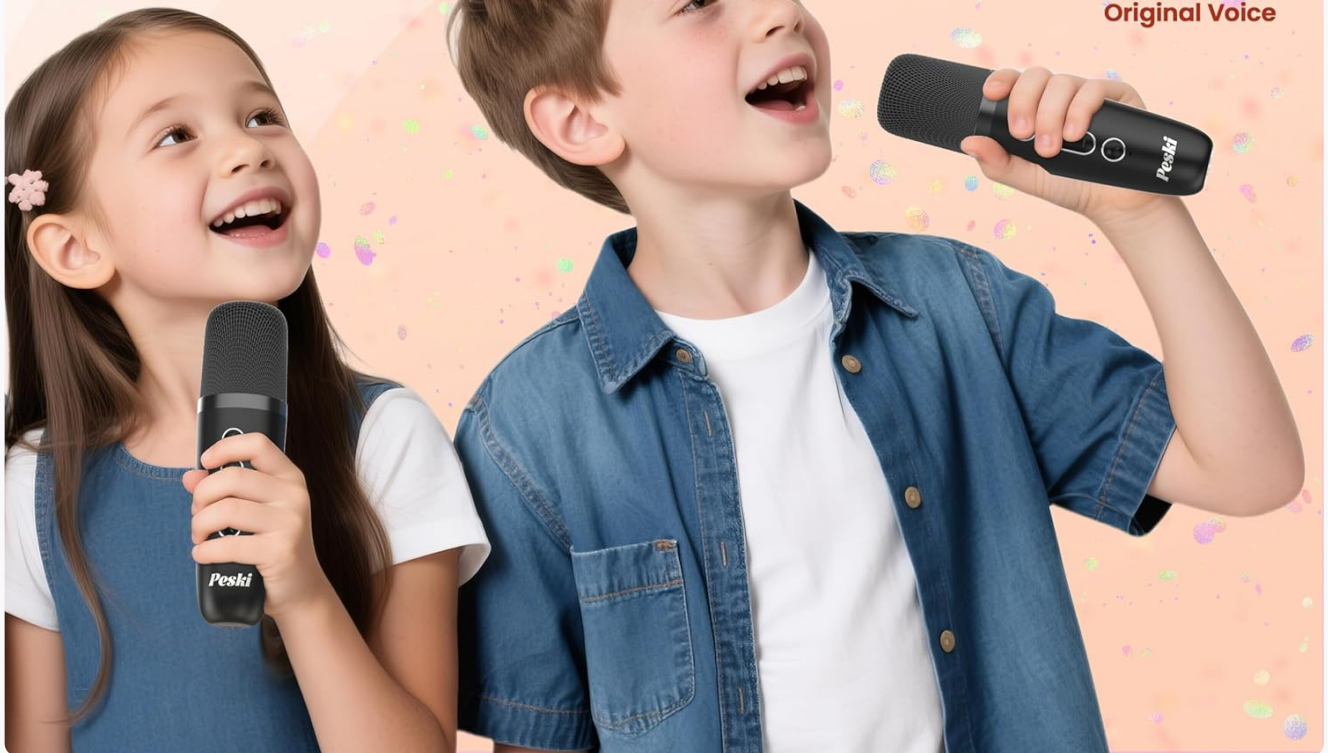
Image: Two children holding microphones, with illustrations of the five magic voice effects: Monster, Baby, Female, Male, and Original/Accompaniment.