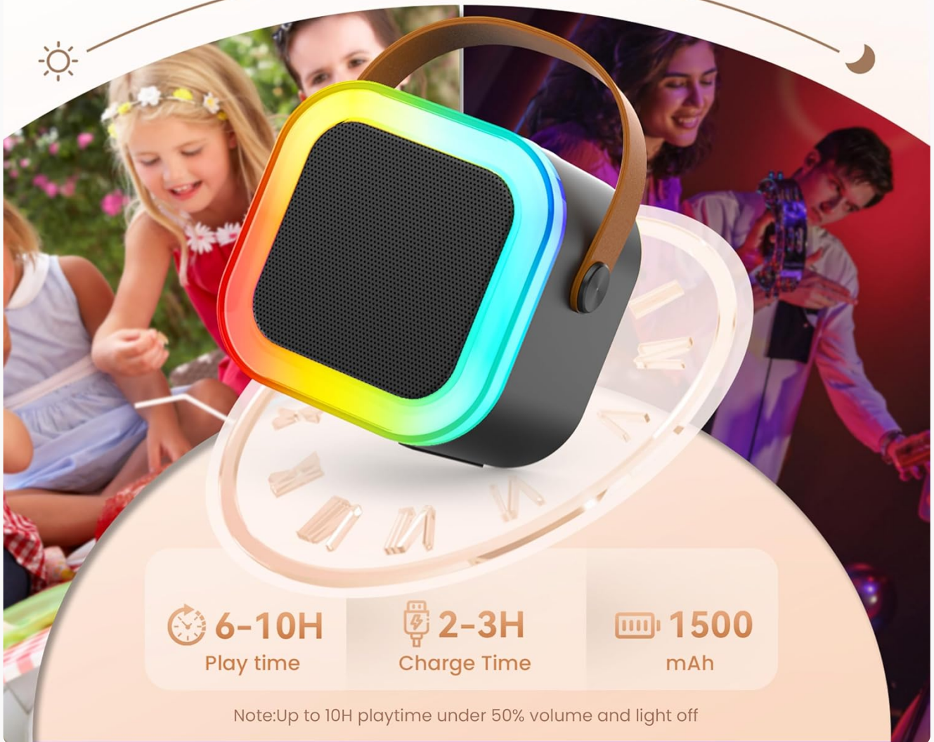
Image: Visual representation of the speaker's battery life (6-10 hours playtime) and charging time (2-3 hours for 1500mAh battery).