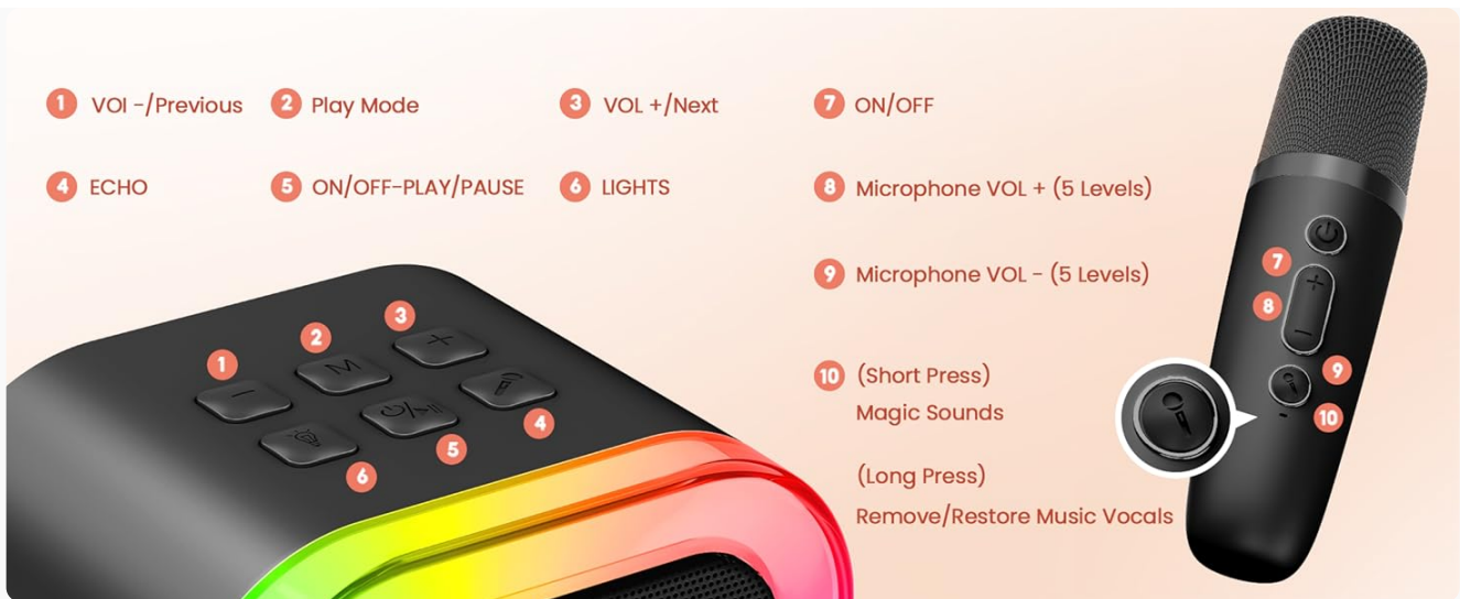
Image: Detailed diagram showing the control buttons on both the speaker and the wireless microphones.