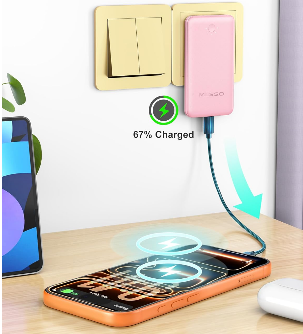
Figure 5: Pass-Through Charging in action