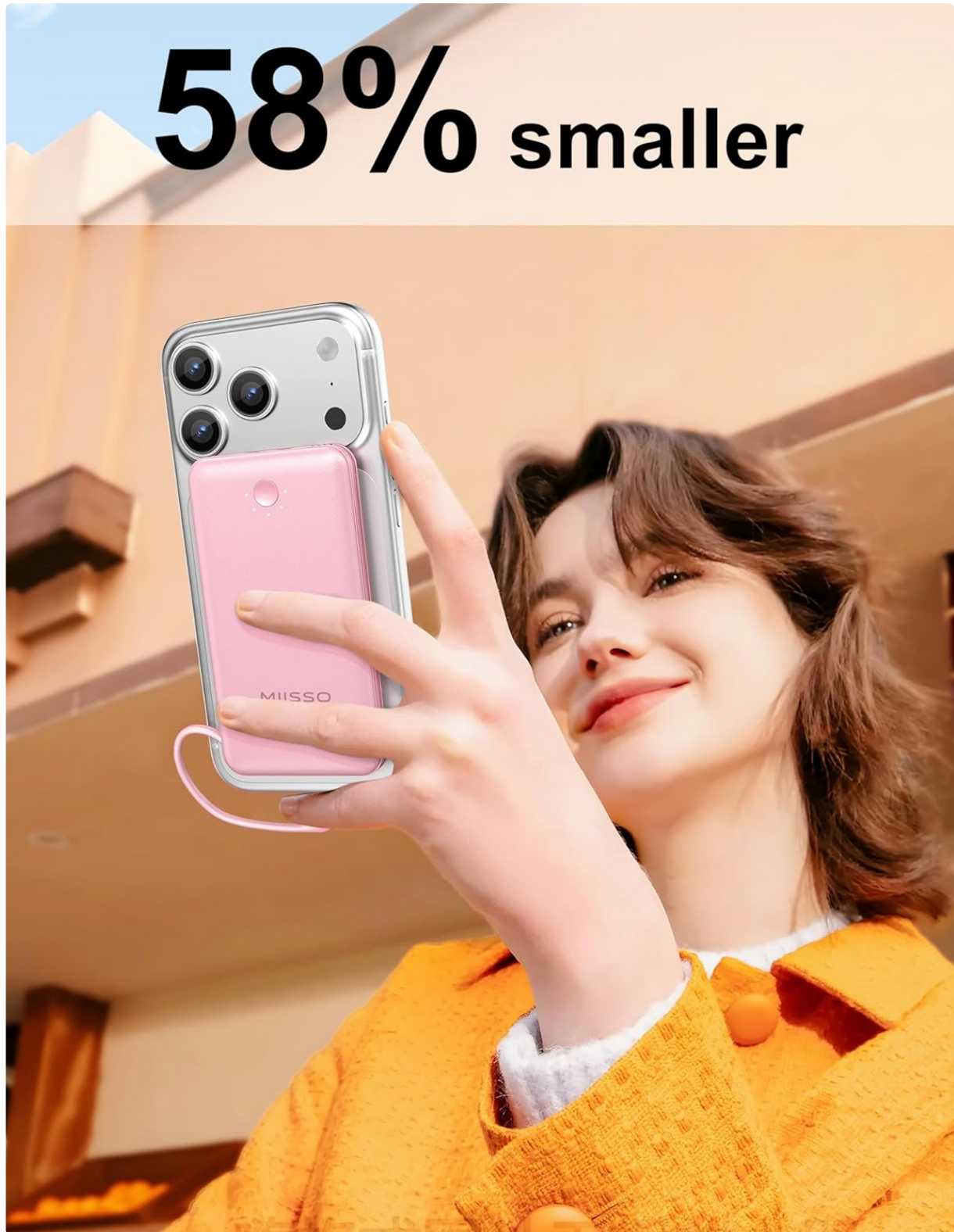
Figure 6: Compact and Portable Design