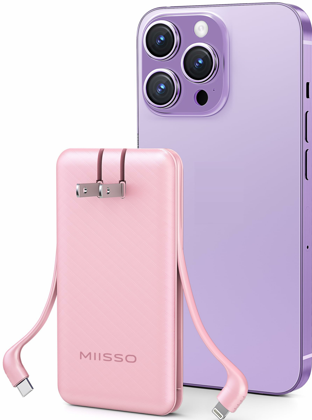
Figure 1: miisso Ultra Slim 10000mAh Power Bank