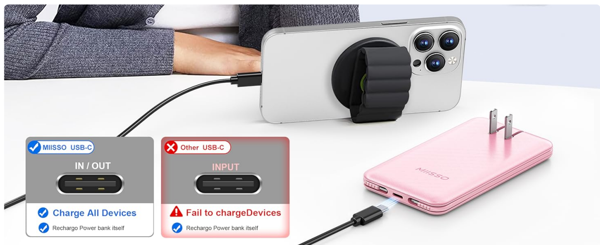
Figure 4: Charging Multiple Devices